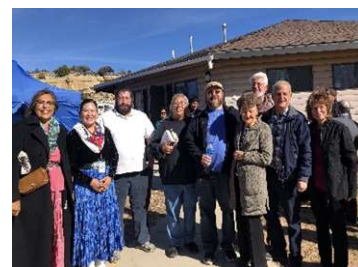
Bisti Board and some PHSDA Attendees