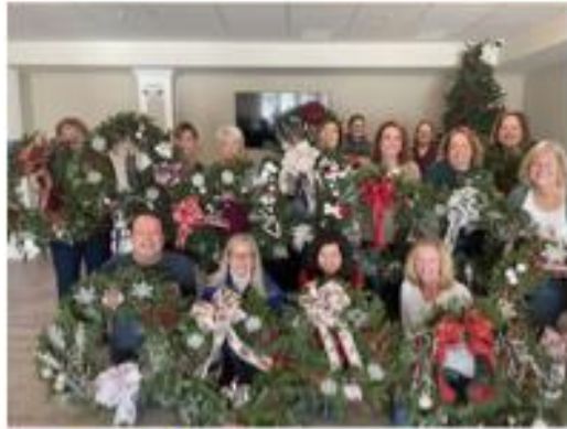
Holiday Wreath Making