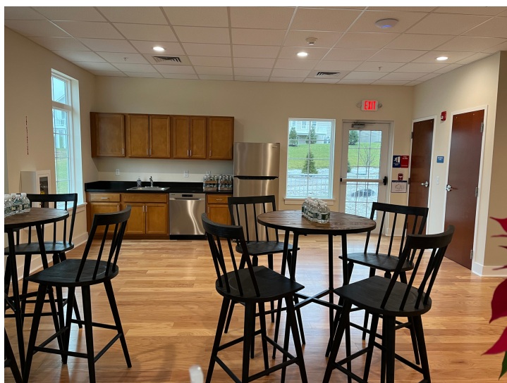
Upper Level - Kitchen