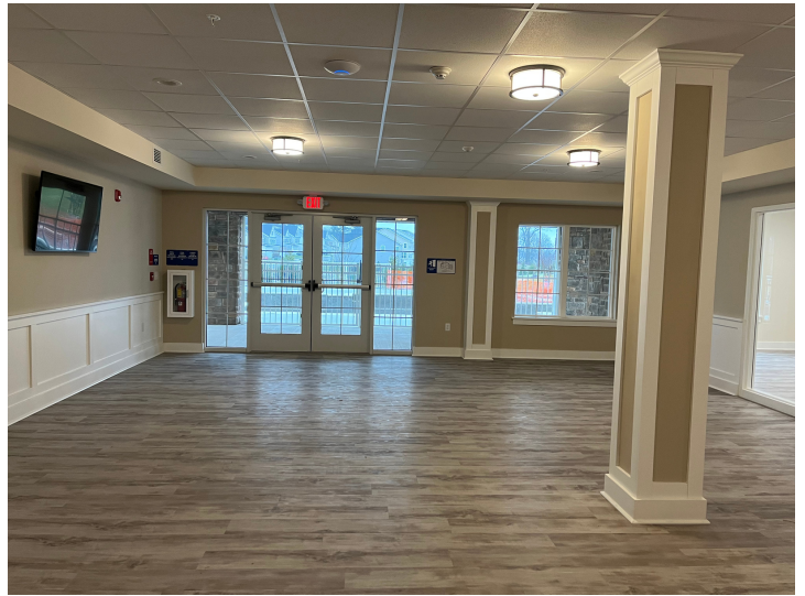
Lower level - Game room