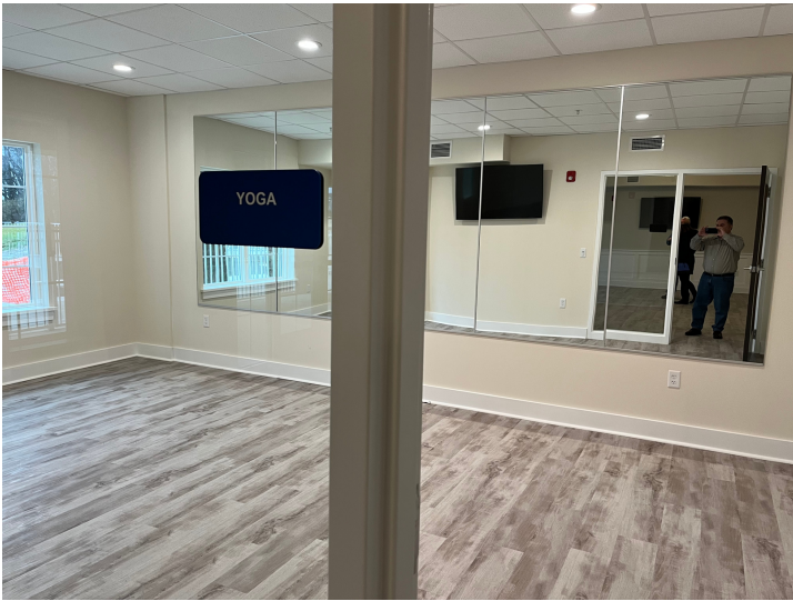
Lower level - Yoga studio