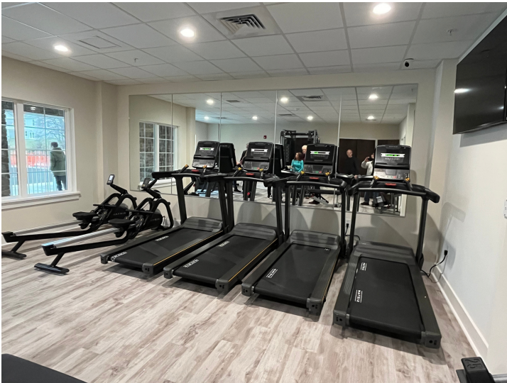
Lower level - Fitness room