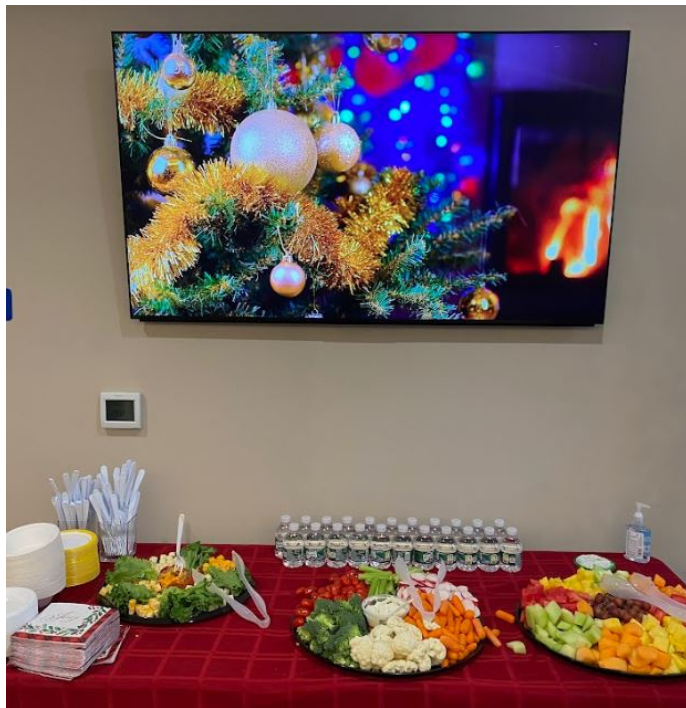
Fruit and Veggie Trays