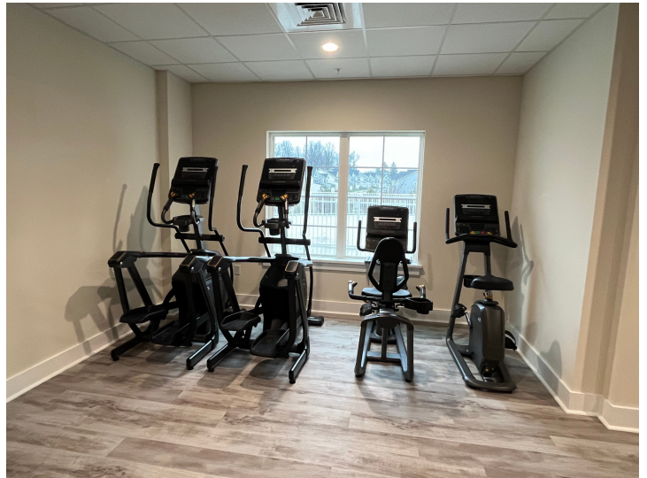
Lower level - Fitness room