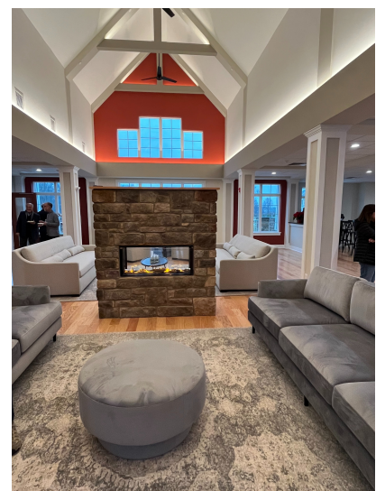
Upper level - Great room fireplace