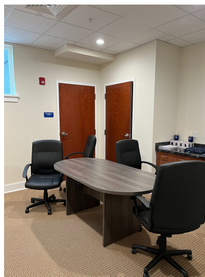
Upper level - Conference room