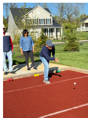
Bali tossing the pallino