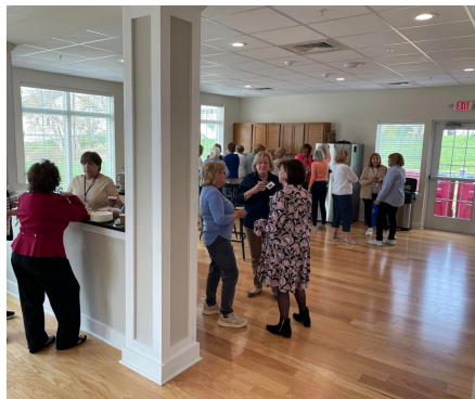
A fun social time for all