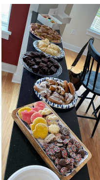
Plenty of good food