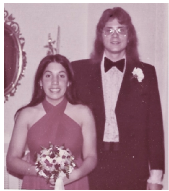
1973 High School Prom