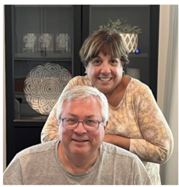
Rell chairs the HOA Finance Committee