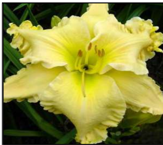
DUCK UNIVERSITY 36",Tet,6",Evr,E,Frag,Re ELLER 2008 $20