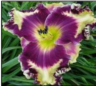
GLAMOUREYEZ 27",Tet,7",SEv,EM,Re HARRY-GASKINS 2008 DISPLAY