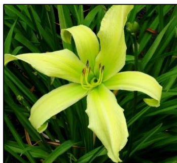
LET LOOSE 36",Tet,9.50",Evr,EE,VFrag, Re,UFO STAMILE 2003 $25