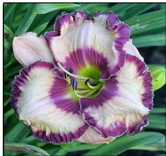
DOUG WARNER 23",Tet,7",Evr,M,Frag,Re PETIT 2008 $25