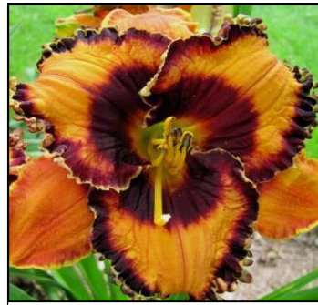
HAPPY HALLOWEEN 18",Tet,5",SEv,M,Re SALTER 2005 DISPLAY