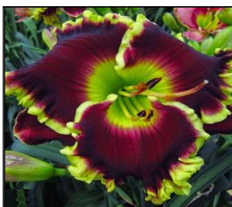
IRISH ROYALTY 28",Tet,6",SEv,EM,Re WALDROP 2015 DISPLAY