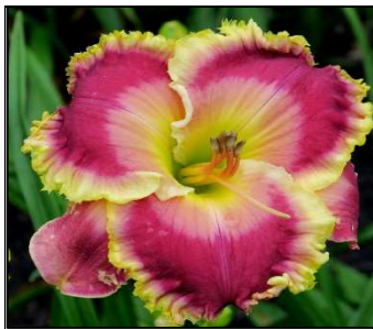
COOL RUNNINGS 39",Tet,6.50",Evr,EM,Re PIERCE-G. 2012 $40