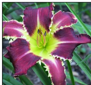
EIGHT MILES HIGH 30",Tet,7.50",Evr,M,Re,UFO LAMBERTSON 2003 DISPLAY