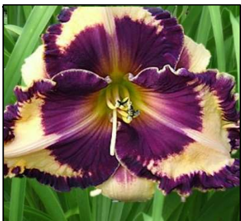
LEDGEWOOD'S TONY LIKES IT 26",Tet,6",SEv,EM,Re ABAJIAN 2006 $25