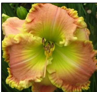
KENNESAW MOUNTAIN HAYRIDE 27",Tet,6",SEv,EM,Frag,Re WALDROP 2007 $25