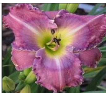
CERULEAN WARBLER 28",Tet,5",SEv,EM,Re LAMBERTSON 2005 $20