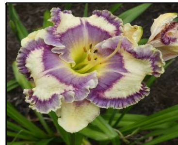
LUMINOUS INTENTIONS 34",Tet,6.25",SEv,EM PIERCE 2014 $40