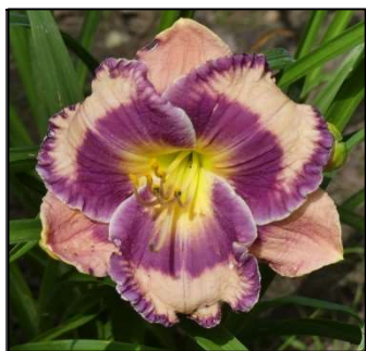
I'M SO BLUE 26",Tet,5.50",SEv,EM,Re HARRY-P. 2012 $30