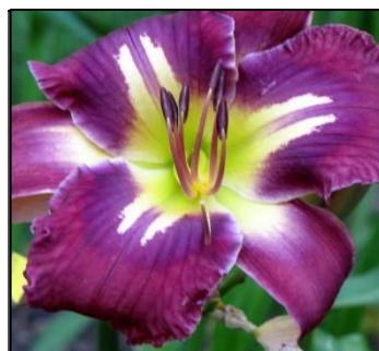
COBRASKIN NECKTIE 39",Tet,6",SEv,EM HANSON C 2005 $25