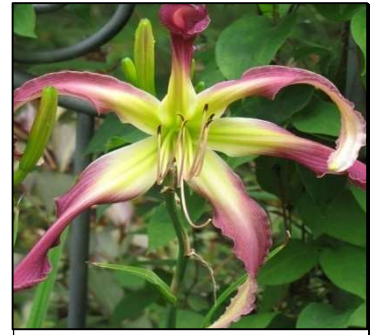
DETVAN 40", Dip, 10", Dor, M, UFO KAMENSKY 2012 $30