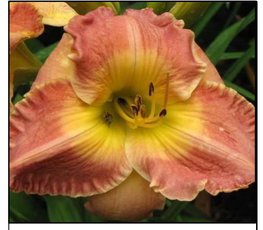
HO-TAI TEMPLE 30",Tet,6",SEv,M,Re WOODHALL 2008 $15