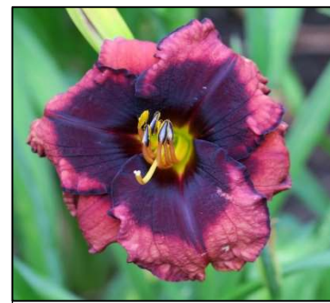
BROADWAY LAST MOHICAN 29",Tet,3.50",Dor,EM,Re STAMILE-G-PIERCE 2011 $30