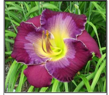
DARKNESS AND DAWN 30",Tet,6",SEv,ML BROOKER-G 2007 $25