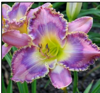
FREE BIRD 26",Tet,6.25",SEv,E,Re LAMBERTSON 2006 $20