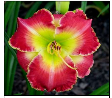
FELIZ NAVIDAD 26",Tet,6",Evr,EM,Frag,Re CARPENTER J 2006 $25