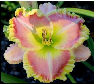
GLAMOUR PUSS 34",Tet,7",SEv,EM,Re SMITH, FR. 2009 DISPLAY