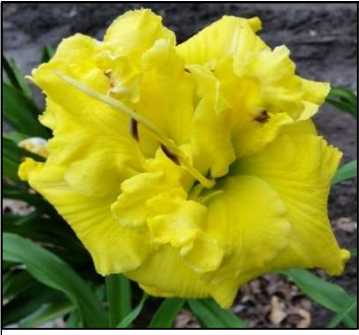
HIGH SCHOOL CHEERLEADER 26",Tet,6.50",SEv,L,Frag,Db,Re CARPENTER 2015 DISPLAY