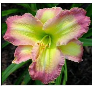
DIAMOND SHORES 36", Tet, 6.75", SEv, EM PIERCE 2016 $50