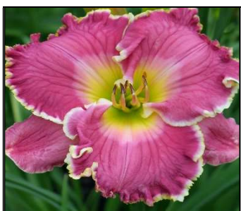
CERISE BEAUTY 32",Tet,6",Evr,EM,Frag,Re STAMILE 2007 $25