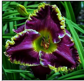
BELLA NOTE 25",Tet,6",Evr,M,Re STAMILE 2009 DISPLAY