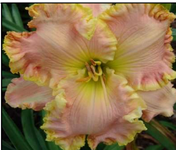
APRIL LAQUINTA 30",Tet,7",SEv,M,Frag,Re PETIT 2006 $25