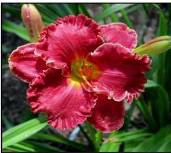
CHRISTMAS GREETINGS 28",Tet,6",SEv,M,Re SALTER 2005 DISPLAY