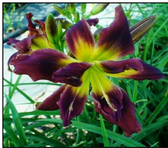
DOUBLE RED WHIRLWIND 28",Dip,7.50",Dor,EM,Frag, Re,UFO GOSSARD 2013 $25