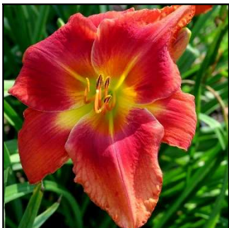
LATE STARTER 34",Tet,6",Evr,L,Re SANTA LUCIA 2011 $25