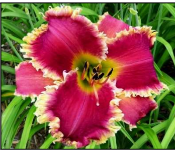
CRIMSON MOON 30",Tet,5",Dor,M,Frag POLSTON 2016 DISPLAY