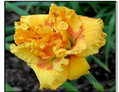
CIRCUS TRUFFLE 26",Tet,6",Evr,E,Frag,Db,Re,Ext KIRCHHOFF-D. 2008 $30