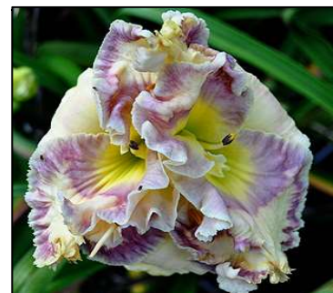
BLUE PLATE SPECIAL 24",Tet,5.25",Evr,E,Frag,Db TRIMMER 2015 DISPLAY