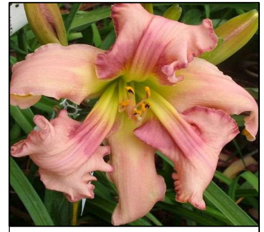
GRANDMA NUT 32",Tet,5.50",Evr,M,Re HANSEN-D. 2012 $25