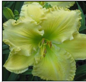
BUTTERCREAM 28",Tet,7",Dor,M,Frag,Ext WHATLEY 1998 $30