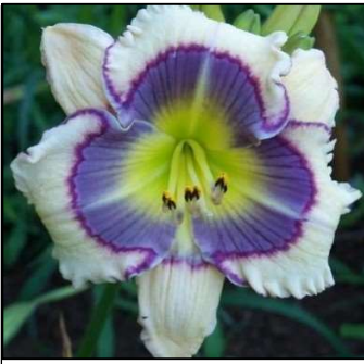
BLUE SPRING 35",Tet,4",Evr,E,VFrag,Re STAMILE 2008 DISPLAY