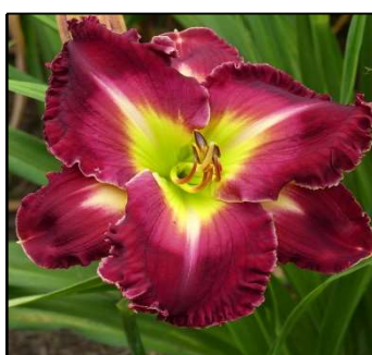
CHERRIES GO ROUND 30",Tet,7",Dor,EE PIERCE 2018 $50