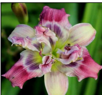
LITTLE SWIRLING SHADOWS 17",Dip,2.50",Evr,EM,Db, Re,Mini STAMILE, G 2014 DISPLAY