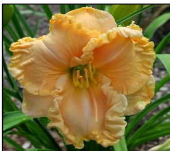
ACROSS THE GALAXY 32",Tet,6.25",Evr,M,Re TRIMMER 2007 $25