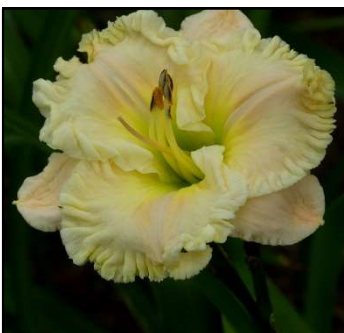
BLONDES BEACH 34",Tet,6",Evr,EM,Frag,Re PIERCE-G 2011 $25