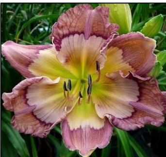
COSMIC KALEIDOSCOPE 27",Dip,6.50",Evr,M,Frag,Re CARPENTER J 2006 $30