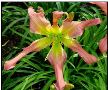
LAVENDER STALACTITE 40",Dip,7",Dor,M,UFO GOSSARD 2005 $25