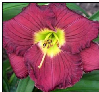
IMPERIAL DECREE 36",Tet,5.50",Dor,M,Frag,Re BENZ J 2004 $25