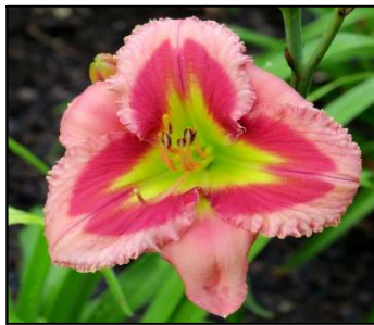
GARNET PRISM 39",Tet,6.50",Evr,M,Re STAMILE 2009 DISPLAY