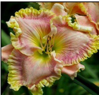
AMERICAN CLASSIC 41",Tet,6.75",Evr,E,Frag,Re TRIMMER 2013 $40