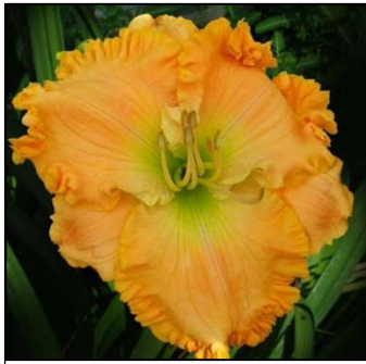
DREAMCICLE SUPREME 31",Tet,7",SEv,EM,Re HARRY 2007 $25