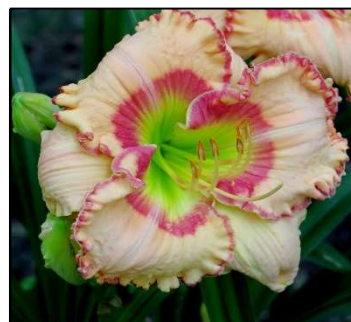
FABULOUS FREYA 26",Tet,6.50",Evr,EM,Re WHEELER-H. 2012 DISPLAY