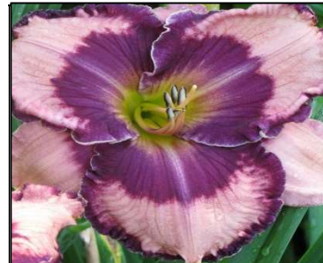
LEDGEWOOD'S PANSY EYE 29",Tet,6.75",SEv,EM,Re ABAJIAN 2005 $25