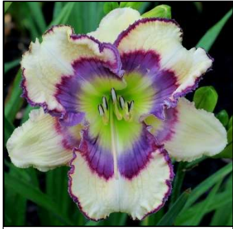
COLORFUL IMPRESSIONS 40",Tet,5.75",SEv,EM,Re PIERCE 2014 $35