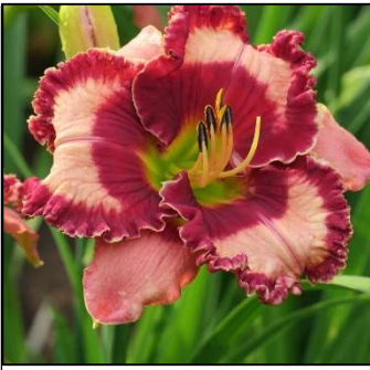
ELITE STOCK 30",Tet,5.50",SEv,E PETIT-GOFF 2016 $60