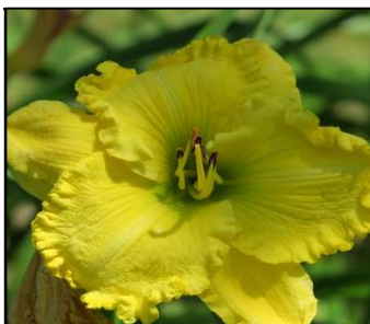
LIMA 28",Tet,7",SEv,M,Re,Ext KIRCHHOFF D 2003 $20