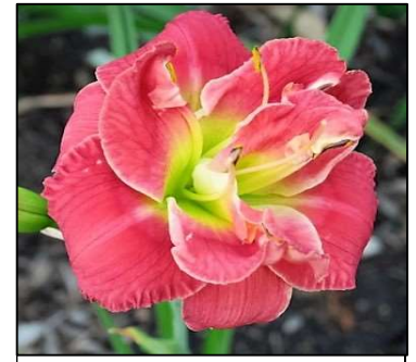
DOUBLE IMAGE 29",Tet,6",Evr,E,VFrag,Db,Re STAMILE 2002 $25