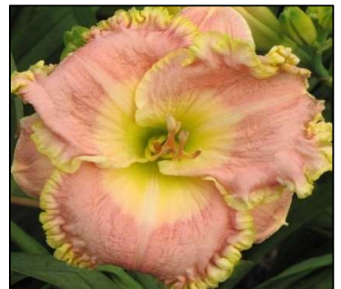
GEORGE WASHINGTON 28",Tet,6",Evr,M,Frag,Re STAMILE 2006 $20