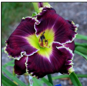
BLACK TO THE FUTURE 35",Tet,6.50",Evr,EE,Re PIERCE 2015 $40