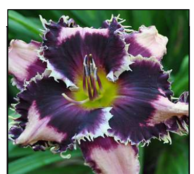
DOCTOR MAGEE 29", Tet, 5", Evr, M, Re TRIMMER 2017 $75