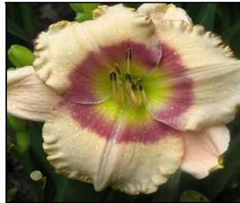
HATHAWAY COTTAGE 34",Tet,5.50",Dor,M,Re MOLDOVAN 2005 DISPLAY