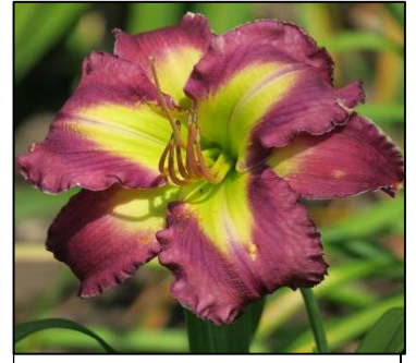
COOL COMPOURE 32",Tet,8",SEv,EE PIERCE, G. 2017 $60