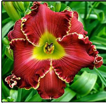
DAN'S TALL BOY 41",Tet,6.50",Evr,E,Re TRIMMER 2018 DISPLAY