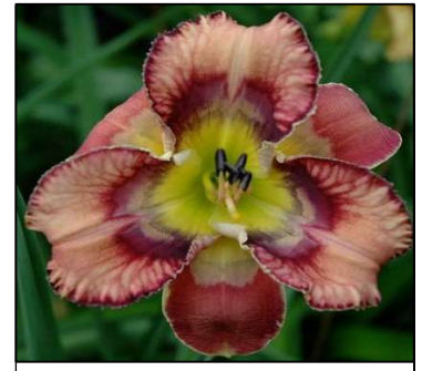
BUTTERFLY COVE 25",Tet,5.25",Evr,EM,Re STAMILE 2007 DISPLAY