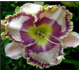
BLUEBERRY SEASON 35",Tet,7.50",Evr,EM,Re TRIMMER 2014 $35