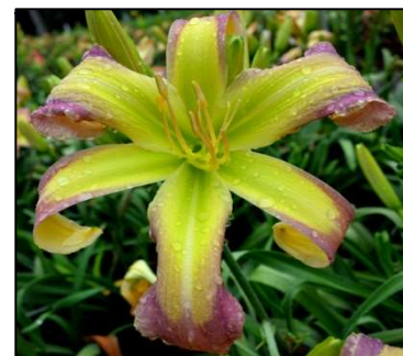
JADE PARADE 32",Tet,8",Dor,EM,UFO PIERCE-G. 2015 $60