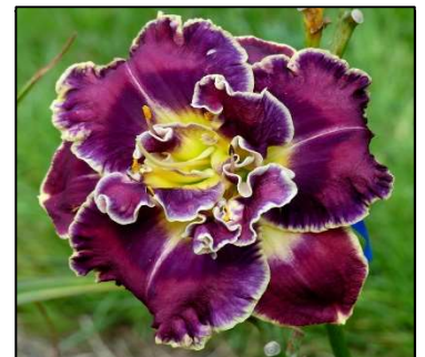
FLASH OF MISCHIEF 29",Tet,6.75",Evr,EM,Db,Re PIERCE 2016 $50