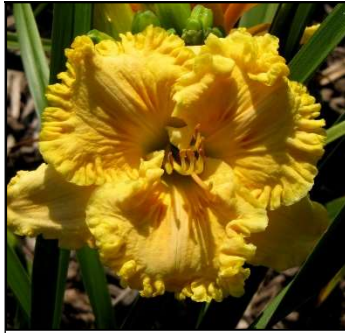
CRAZY MAN 23",Tet,6",SEv,EM,Re TOWNSEND-J. 2007 DISPLAY