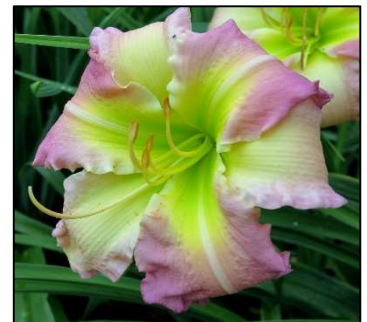
BEDOVIN PRINCESS 32",Dip,6",Dor,ML RICE-JA 2011 $30