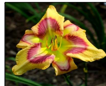
CHANGING SHADOWS 35",Tet,6.75",Evr,EE,Re TRIMMER 2015 DISPLAY