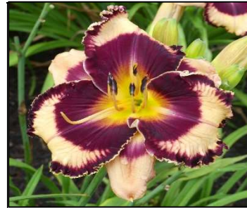
GLORIOUS GARNET 36",Tet,7",SEv,EM,Re HARRY P 2015 $35