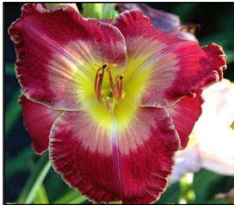
HARPER'S BAZAAR 36",Tet,6.50",Dor,M,Re MOLDOVAN-WOODHALL 2009 $20