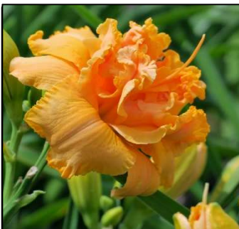
CLARK GABLE 28",Tet,6.50",Evr,EM,Frag, Db,Re,Ext KIRCHHOFF D 2004 $30