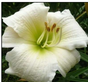
GENTLE SNOWFALL 30",Tet,5.50",SEv,EM,Re REILLY 2007 $20