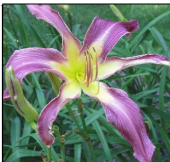
BLUE ILLUSION 45",Tet,10",Evr,E,Re,UFO STAMILE 2008 $25