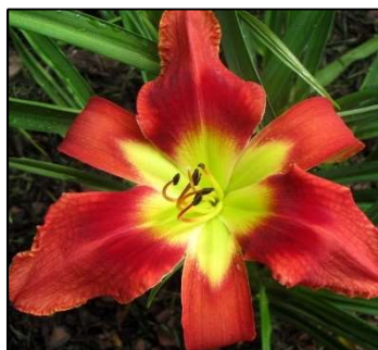
JORDAN'S JAZZ 28",Tet,8.50",SEv,M SANTA LUCIA 2011 $30