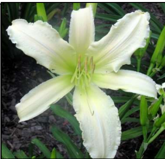
HEAVENLY ANGEL ICE 36",Dip,8",Dor,ML,Re,UFO GOSSARD 2004 $25