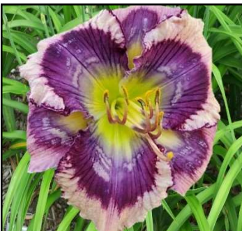
A WHOLE LOTTA RIPPLES 40",Tet,7",Evr,EM,Re PIERCE 2019 DISPLAY