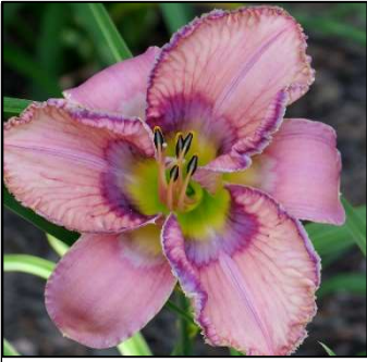
FLORIDA SCRUB-JAY 28",Tet,6",SEv,EM,Frag,Re LAMBERTSON 2006 $20