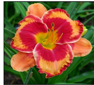
JURASSIC FIESTA 40",Tet,7.50",Evr,E,Frag,Re STAMILE-PIERCE 2011 $30