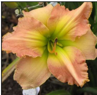
LOVE COMES QUICKLY 33",Tet,6",SEv,M HANSON-C 2009 $30