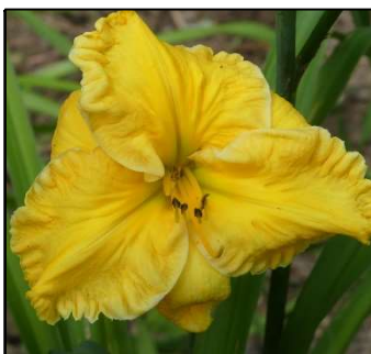
AGE OF EMPIRES 38",Tet,6.50",Dor,M MOLDOVAN 2010 $20