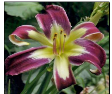
BREAK DANCE 26",Dip,6",Dor,M,UFO WARRELL 2010 $30