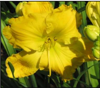
FORSYTH KLONDIKE 30",Tet,7.50",Dor,ML,Frag,Ext LEFEVER 1999 $20