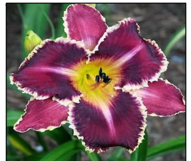
COUNT DRACULA 24",Tet,6",SEv,E,Frag PETIT 2010 $25