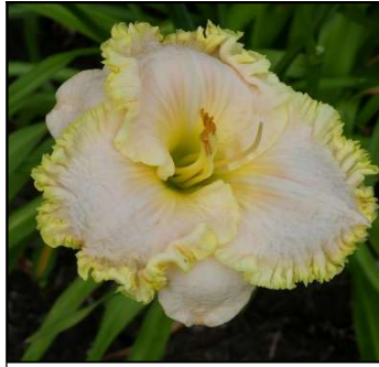
FRINGY 32",Tet,6",Evr,EM,Re STAMILE 2008 $40