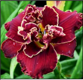
CRANBERRY CHRISTMAS 28",Tet,6",Evr,EM,Frag,Db,Re TRIMMER 2011 $40