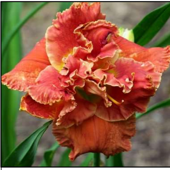
DEFYING SERENITY 30", Tet, 6", SEv, E, Frag, Db, Re ELLER-N. 2008 $40