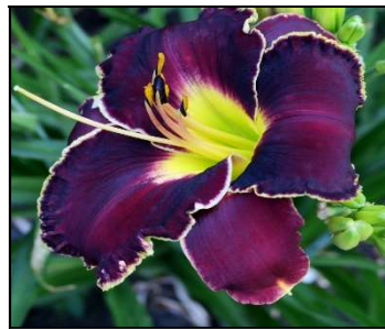
DUCK'S DARK SIDE 28",Tet,6",SEv,E,Frag,Re ELLER 2008 $35