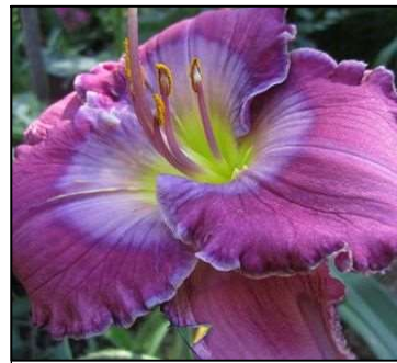
LAVENDER BLUE BABY TET 28",Tet,5.50",Dor,EM,Frag,Re CARPENTER J 1996 $30