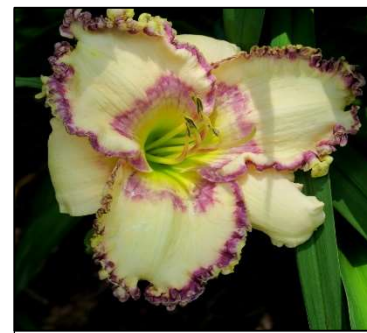
INVITING ROMANCE 29",Tet,6",SEv,M,Re PETIT 2011 $25