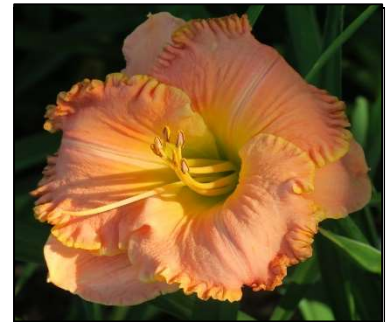
FREEDOM REIGNS 26",Tet,6",SEv,EM,Re HARRY 2008 $20