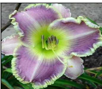
BLUE EYED ANGEL 25",Tet,6",Evr,EM,Re TRIMMER 2008 $25