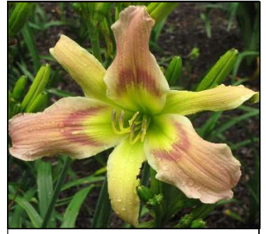
FROG'S EYE 38",Tet,8.50",Evr,EE,Re,UFO STAMILE 2004 $25