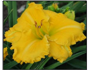
GARTH 31",Tet,8",Evr,M,Re TRIMMER 2013 $35