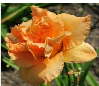
ISABEL MARAFFI 32",Tet,6",SEv,M,Frag,Db,Re TRIMMER 2001 $30