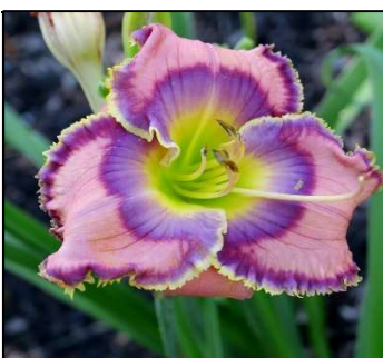
BLUE MARTINI 29",Tet,5.50",Dor,EM,Re STAMILE-PIERCE 2012 $40