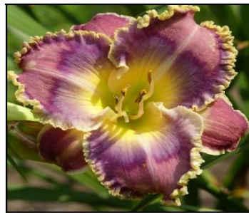
BEYOND PLUTO 32",Tet,5.75",Evr,EM,Re STAMILE-PIERCE 2012 $40