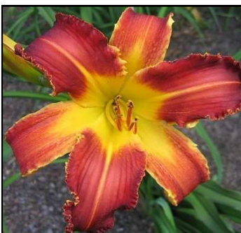
LIGHTNING STORM 40",Tet,8",Dor,M,Frag, Re,UFO BENZ J 2006 $20