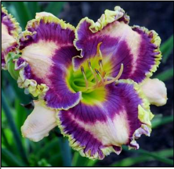
COLOR CRAZY 24",Tet,5.75",Evr,EM,Frag,Re BELL-T. 2012 $40