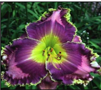
BYZANTINE SMILE 38",Tet,6.50",Evr,EM,Re PIERCE 2014 $35