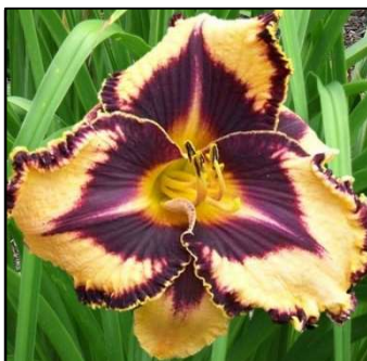
INDIAN FEATHERS 26",Tet,6",Evr,M,Frag,Re BELL, T 2008 $25