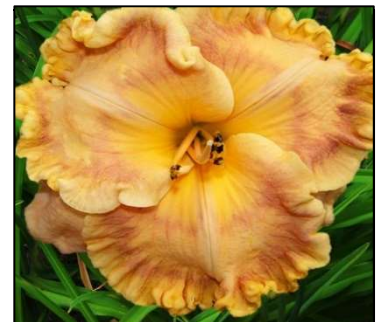
CARAMEL SUNDAE 30",Tet,5.75",SEv,EM,Re MARYOTT 2015 DISPLAY