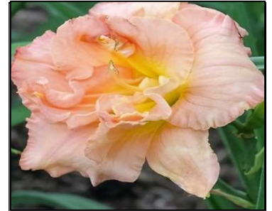
ICE PINK TRUFFLE 25",Tet,6",Evr,L,Frag,Db, Re,Ext KIRCHHOFF-D. 2011 $30