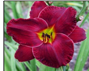
ARROGANT BASTARD 44",Tet,6.50",SEv,ML HANSON C 2005 $25