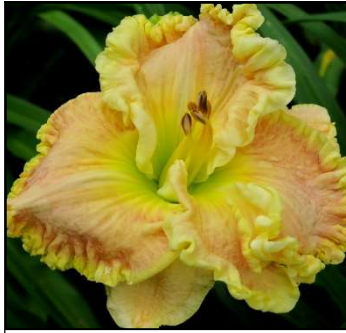
FORGIVEN 28",Tet,6.50",Evr,M,VFrag,Re BELL-T. 2012 $30