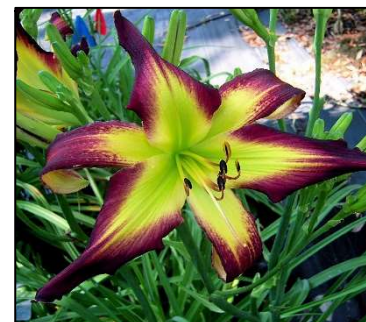
KEY LIME PIRATE 40",Tet,8.50",Evr,EM,Re TRIMMER, D 2015 $35