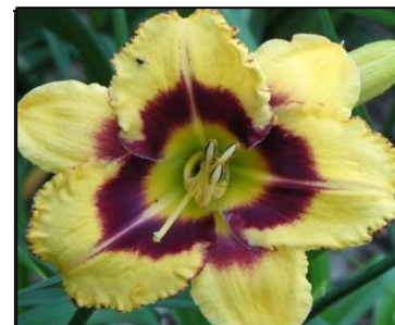
BUCKEYE BLITZ 34",Tet,6",SEv,M,Frag,Re HAEHN 2008 $20