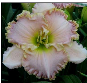
JACQUELINE KENNEDY ONASSIS 28",Tet,6",SEv,E,Re GRACE-SMITH 2004 $25