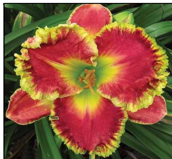
GUILTY PASSION 32",Tet,6",SEv,E,Re HARRY-P. 2013 DISPLAY