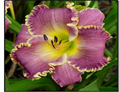
FRANK'S STAR OF BETHLEHEM 26",Tet,5.50",SEv,E,Re GRACE-SMITH 2004 $20