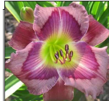
DAVEY JONES' LOCKER 30",Tet,5.50",SEv,M,Re MOLDOVAN 2006 $20