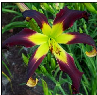
INDIGO DRAGON 36",Tet,8.50",Evr,M,Re TRIMMER, J 2014 $35