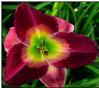
EVENING EYE SHADOW 30",Tet,6",SEv,M,Re MOLDOVAN-WOODHALL 2009 $25