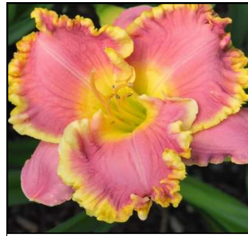
ELVIS 32",Tet,7",SEv,EM,Re SMITH-FR 2008 $30