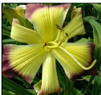
KERMIT'S SCREAM 25",Dip,6",Dor,EM NORRIS R 2006 $25