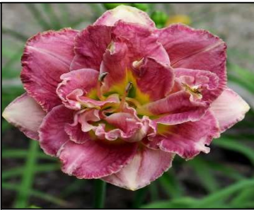
HYBRIDIZER'S TRUFFLE 35",Tet,5",Dor,E,Re KIRCHHOFF-D. 2008 $25