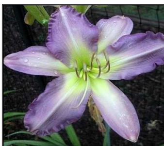
BLUE DOLPHIN 34",Dip,8",Dor,M RICE-JA 2011 $25