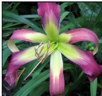
LAUGHING SKIES 38",Tet,10",Evr,EE,Frag, Re,Sp STAMILE 2003 $25