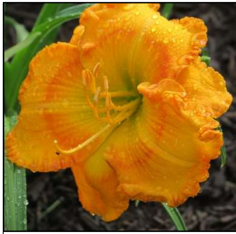
HANNE'S ELECTRIC ORANGE 32",Tet,6",Evr,EE,Frag PIERCE-G. 2015 DISPLAY