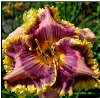
ALL IN FAVOR 46",Tet,5.50",Evr,EM,Re PIERCE-G. 2016 $40