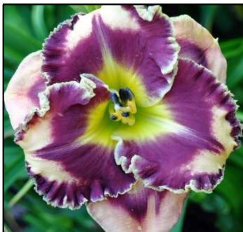
JULY MOON 28",Tet,5",Evr,EM,Re TRIMMER 2014 $40