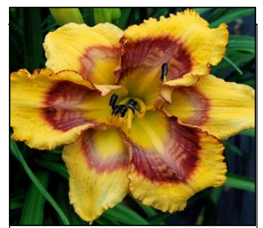
DIGITAL DIVIDE 30", Tet, 7", Evr, EM, Re TRIMMER 2014 $30