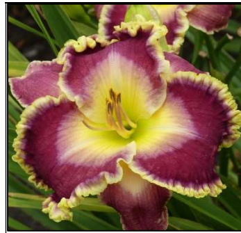
DERBY DAY 22", Tet, 5", SEv, ML, Re RICE-JA 2011 $25