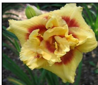
BUCKEYE BARNSTORMER 26",Dip,4.50",SEv,EM,Frag, Db,Re HAEHN 2000 $20