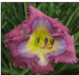
BLUE LIGHT SPECIAL 28",Tet,5",Evr,M,VFrag,Re BELL-T. 2012 $40