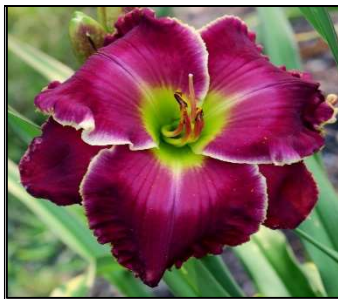
CIMARRON ROSE 28",Tet,7",SEv,M SALTER 2005 $25