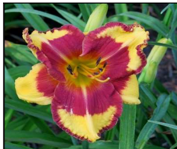
LEDGEWOOD'S FLAME OF FAITH 28",Tet,6",SEv,EM,Re ABAJIAN 2008 $25