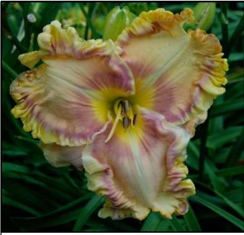
FRENCH LESSONS 34",Tet,7.50",Evr,EM,Frag,Re TRIMMER 2013 DISPLAY