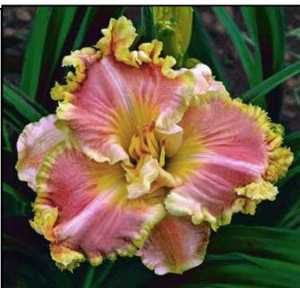
BILL ROBINSON 20",Tet,6.50",SEv,EM,Re GRACE-SMITH 2004 $25