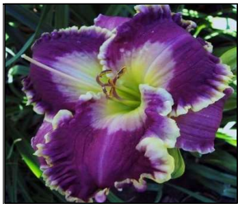
JENNIFER TRIMMER 30",Tet,6.75",Evr,EM,Frag,Re TRIMMER 2006 $25