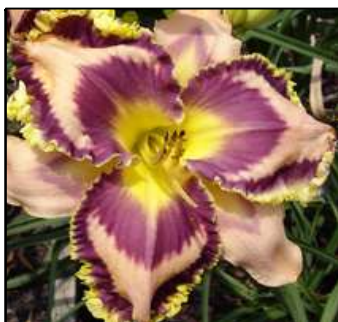
EYES RIGHT JONES 29",Tet,6.50",Evr,M,Re WILKERSON 2006 $25