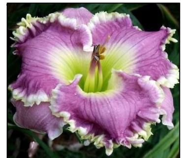
CUTTING LOOSE 32",Tet,6",Evr,E,Frag,Re PIERCE-G. 2010 $25