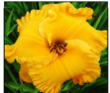
DAZZLING GOLD 34",Tet,5.75",Evr,EM,Re MARYOTT 2014 $25