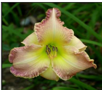
ADMIRAL BROWN 36",Tet,6.50",SEv,M,Frag HAEHN 2004 $15