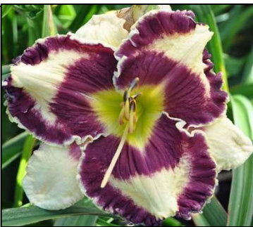
I'M NO ANGEL 27",Tet,6.50",SEv,EM,Re HARRY 2012 $30