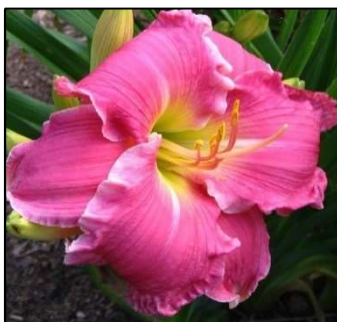
CAN'T TAKE MY EYES OFF YOU 22",Dip,6.25",Dor,M WINTER 2014 $25