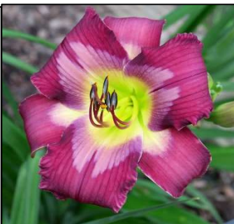
FIXED INCOME 33",Tet,6",SEv,EM HANSON-C. 2010 $15