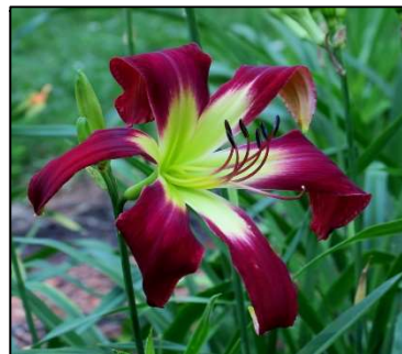
ALL I WANT FOR CHRISTMAS 34",Tet,9.50",Evr,EM,Re,UFO WILKERSON 2010 $35