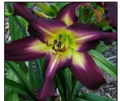
BLACK FALCON RITUAL 38",Tet,8",SEv,EM,UFO HANSON C 2005 $25