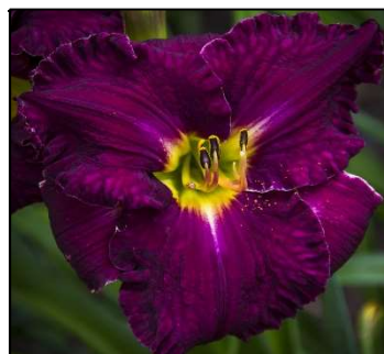
BLACK BIRD SINGS 34",Tet,6",SEv,M,Re HANSON-C. 2009 $35