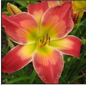
FLYING TRAPEZE 36",Tet,6.50",Dor,M,Re,UFO MOLDOVAN 2005 $15