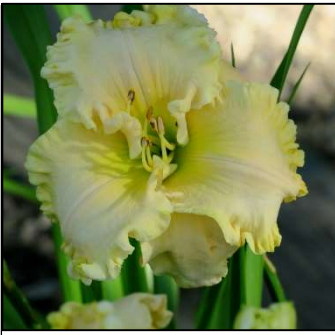
BELIEVE IN MAGIC 34",Tet,6",SEv,EM,Frag,Re GRACE-SMITH 2005 $25