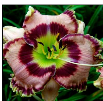
DOCTOR LOPEZ 34", Tet, 7.50", Evr, EM, Re TRIMMER 2014 $30