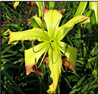
FREAKAZOID 44",Tet,10",Evr,M,Re,Sp STAMILE 2009 $40