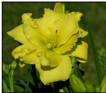
DOUBLE MY SUNSHINE 36",Tet,8.75",Dor,M,VFrag, Db,Re GOSSARD-D. 2012 $25