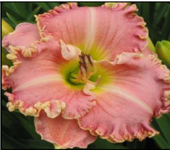
GRANDMA'S SMILE 30",Tet,6",SEv,E,Re GRACE-SMITH 2004 $20