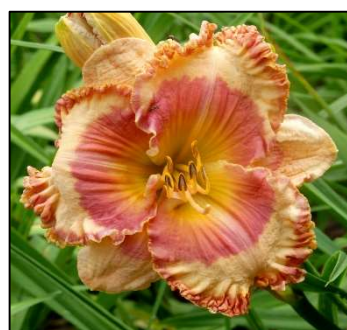
DEDICATED FOLLOWER OF FASHION 26",Tet,5.50",SEv,M DICKENS, R 2020 $50