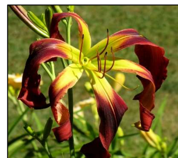
CHERRY SWIZZLER 42",Tet,12",Evr,EE,Re,Sp,UFO STAMILE 2008 $30