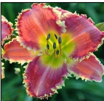
INTENT TO BITE 33",Tet,6.50",Evr,EM,Re DEVITO 2012 $30