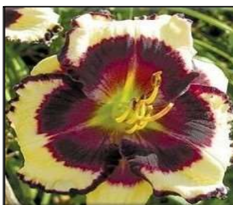
BUBBLING UP 40",Tet,6",SEv,EM,Re SMITH-FR 2007 $30