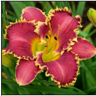
CHOMP 30",Tet,5.50",SEv,M,Re LAMBERTSON 2011 $25