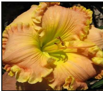
FINE FRENCH PORCELAIN 25",Tet,8",SEv,M,Frag,Re PETIT 2008 $30