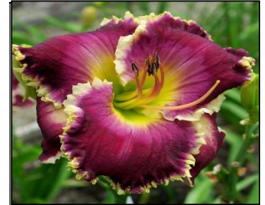
GNASHING OF TEETH 29",Tet,6.50",Evr,M, Frag,Re EMMERICH 2010 $35