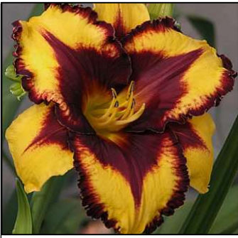
GOLDENZELLE 32",Tet,5",SEv,M,Re,Ext SMITH FR 2006 $20