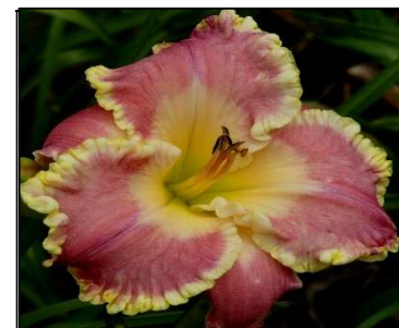
KATHERINE MARIN 33",Tet,6",SEv,ML,Frag RICE-JA 2007 $25