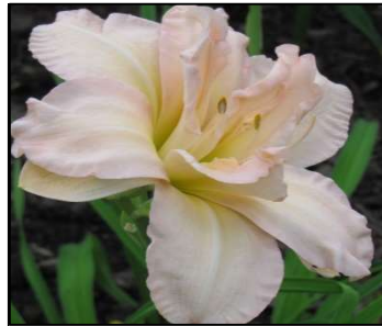
ICE CREAM DREAM 22",Dip,7",SEv,M,Db,Re JOINER J 1999 $25