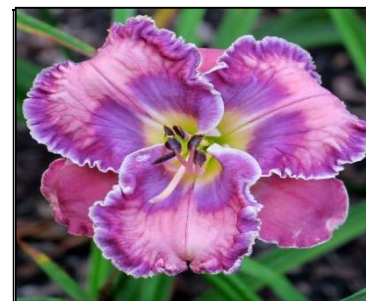
BLUE FANDANGO 28",Tet,6.25",SEv,EM,Frag,Re HARRY P 2015 DISPLAY