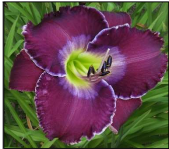
I REMEMBER YOU 35",Tet,6",SEv,EM,Re SMITH FR 2005 $20