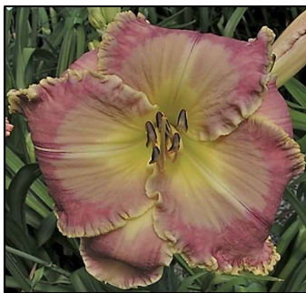
GRETA GARBO 28",Tet,6",SEv,M RICE, JA. 2009 $25