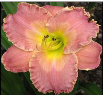
CROWNING ACHIEVEMENT 44",Tet,5.50",Dor,ML RICE-JA 2011 $25