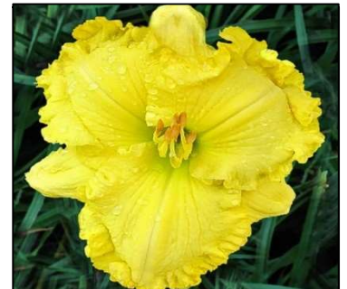
GOLDEN DESIRE 33",Tet,7.75",SEv,EM,Re SMITH-HARRY-P. 2012 $30