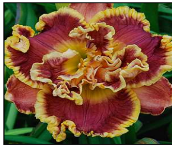
DOUBLE WIDE 22",Tet,6",Evr,M,Frag,Db,Re TRIMMER 2012 DISPLAY