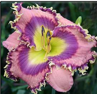
GOD SAVE THE QUEEN 30",Tet,7",Evr,E,Re,Ext MORSS 2005 $30