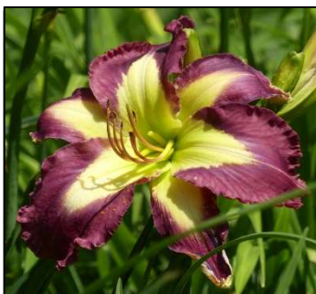
KELLY'S STAR 40",Tet,10",Dor,EM,Re PIERCE 2018 DISPLAY