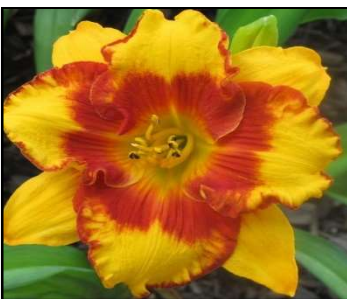
ADORABLE TIGER 26",Tet,5",Dor,M,Frag RASMUSSEN 1998 $20