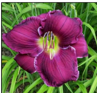
CLOUDS BEFORE THE STORM 22",Dip,4.25",Dor,M, Frag,Re BEGNAUD K 2003 $20