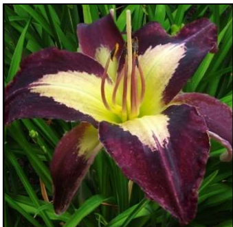
JUMPING JACK 37",Tet,6.25",SEv,M,Re,UFO MARYOTT 2013 $35