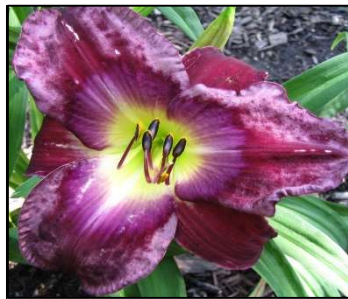
JERRY HYATT 27",Tet,6",SEv,EM,Frag HANSON C 2004 $30