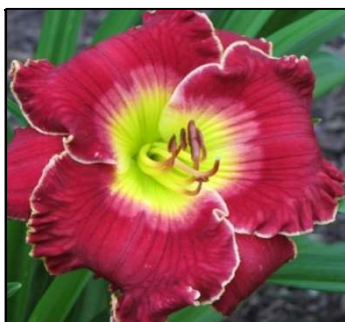
CROWNING FIRE 40",Tet,5.75",Evr,EM,Frag,Re STAMILE-PIERCE 2011 $25