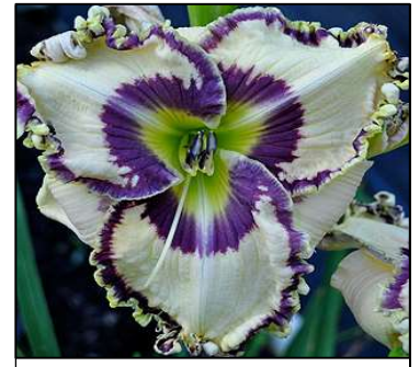
BLUEBERRY KING 34",Tet,6.25",Evr,M TRIMMER 2015 DISPLAY