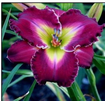
BING CROSBY 34",Tet,7",Dor,EM,Frag,Re PIERCE 2019 DISPLAY