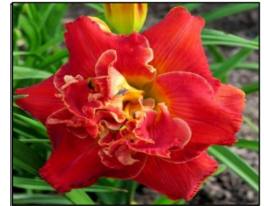
DOUBLY HOT 30",Tet,6",Evr,M,Db,Re MARYOTT 2008 DISPLAY