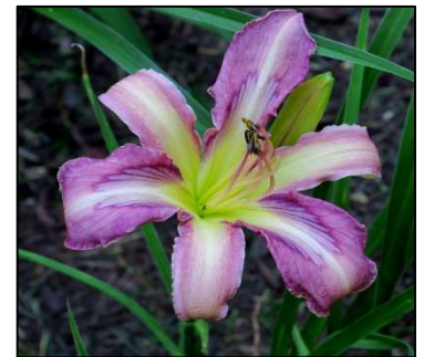
DRAGONFLY TATTOO 29",Tet,8",Evr,E,Frag,Re TRIMMER-J. 2012 $30