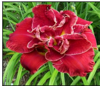
FIRE AGATE 23",Tet,6",Evr,M,Db,Re STAMILE 2005 $30