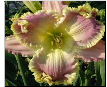
CROWN OF SPLENDOR 28",Tet,6.50",Dor,M,Frag,Re EMMERICH 2011 $25