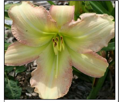
FORSYTH FLAMING SNOW 32",Dip,6",Dor,ML,Frag,Noc,Ext LEFEVER 1994 $20