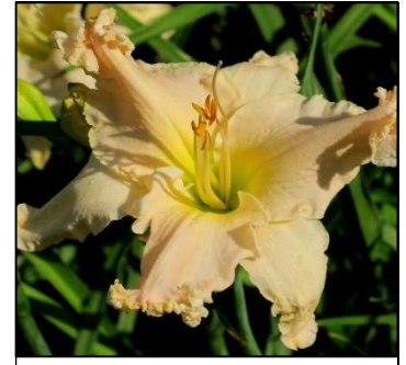
CRIMPY 27",Tet,7.50",SEv,M,Re TOWNSEND-J. 2010 $25