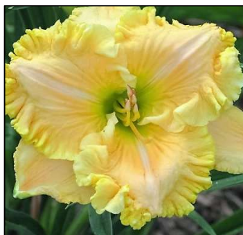
DIVINE SEDUCTION 38", Tet, 7", SEv, EM, Re HARRY-P. 2013 $25