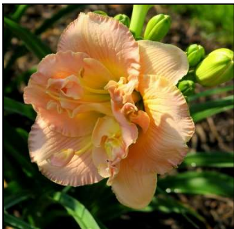
A GIFT FOR TREVA 26",Tet,6",SEv,E,Frag,Db,Re ELLER-N. 2008 $20