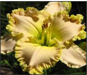
FULL OF TREASURE 30",Tet,5.87",Evr,E,Frag,Re GRACE-L. 2010 $20