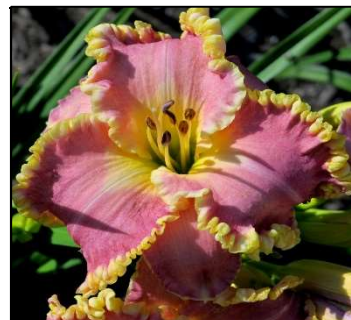
GOLD MINER'S DAUGHTER 26",Tet,6.50",SEv,M,Re PETIT 2005 $25