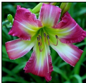
BRIDGET BEDAZZLED 45",Tet,6",SEv,M,UFO DICKENS, R 2021 $40