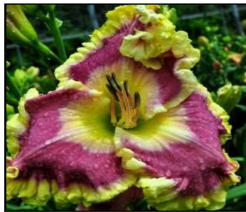
BAREFOOT BAY 41",Tet,6.25",Evr,EM,Frag,Re STAMILE-PIERCE 2010 $30