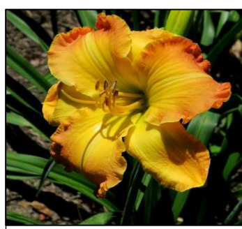
DIFFERENT DIRECTION 33", Tet, 8.50", SEv, EM, Frag SMITH-HARRY-P. 2011 DISPLAY