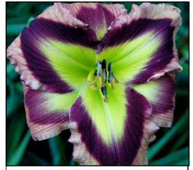
JANE'S PRISM 28",Tet,7",Evr,M,Frag,Re TRIMMER-J. 2013 $35