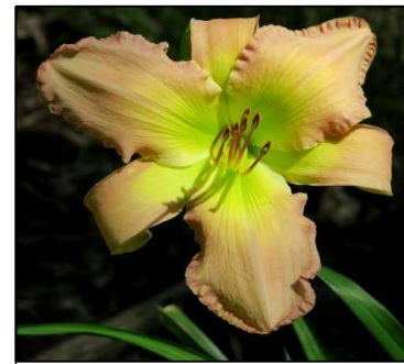
ANGEL'S VIEW 32",Tet,9",SEv,EE,Re PIERCE-G. 2017 $40