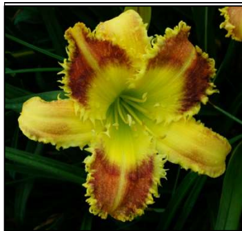
DENTIST THE MENACE 36", Tet, 5.50", Dor, ML, Frag, Re GOSSARD 2013 $30