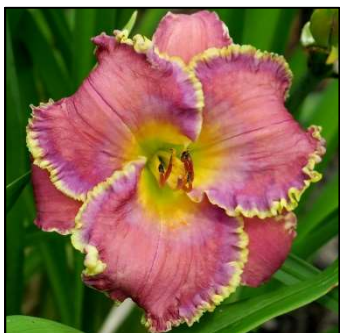
BRIDEY GREESON 26",Tet,5.50",SEv,EM,Frag,Re GRACE-SMITH 2003 $25