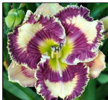
BEAUTY MARKED 28",Tet,6.50",Evr,EM,Re HARRY 2010 $30