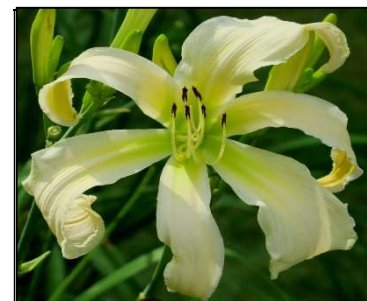
ISABELLE ROSE 59",Dip,7",Dor,E,Frag,UFO LAPRISE 2009 $35