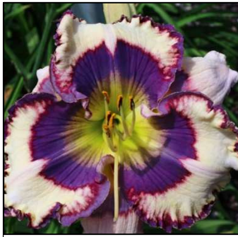
BLUE VIBRATIONS 47",Tet,6",Evr,EM,Re PIERCE 2015 $40