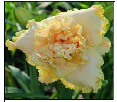
CHRISTMAS COTTON 26",Tet,6",Evr,EM,Frag,Db,Re GASKINS 2004 $25