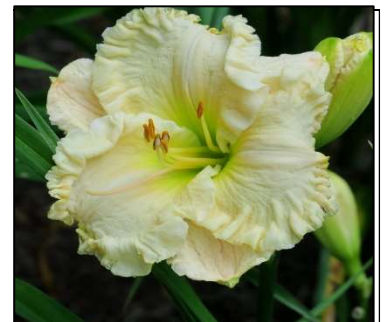
COCONUT GROVE 30",Tet,5.50",Evr,EM, Frag,Re TRIMMER 2011 $35