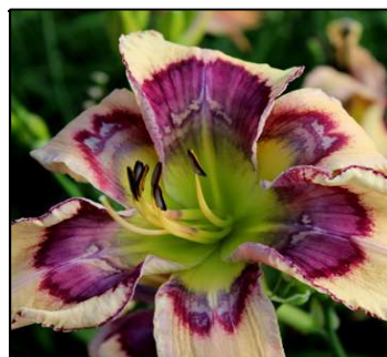
BOWTIE AFFAIR 42",Tet,9",SEv,EE,Frag,Re PIERCE-G. 2013 DISPLAY