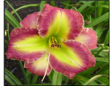
GREEN VOLCANO 34",Tet,7.50",SEv,EE,Frag PIERCE, G. 2017 DISPLAY