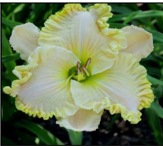
FINDERS KEEPERS 26",Tet,7",Evr,EM ROGERS C 2006 $25