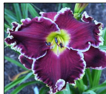
BUFFALO THUNDER 42",Tet,7.75",Evr,EM,Re STAMILE-PIERCE 2012 $40