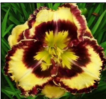
BACH CANTANA 42",Tet,6.25",Evr,EM MARYOTT 2014 DISPLAY