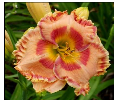
BAJA CALIFORNIA 36",Tet,7",Evr,EM,Frag,Re TRIMMER 2011 $25