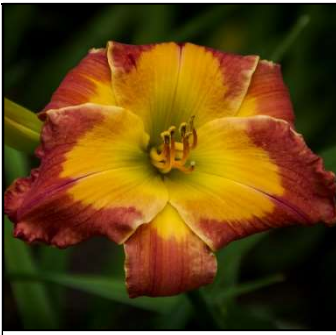
CHESTNUT RIDGE 36",Tet,6",Dor,M,Re MOORE, E. D. 2009 $25