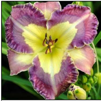
BELIGHTFUL 29",Tet,6",SEv,EM DEVITO 2011 $30