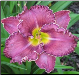
D'ARTAGNAN 30",Tet,6",SEv,M,Re MOLDOVAN 2006 $20