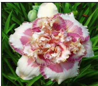
LOVELY CONFECTION 26",Tet,6",SEv,M,Frag,Re PETIT 2013 $35