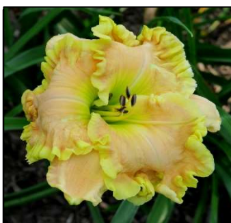
CHARTREUSE WONDER 28",Tet,6",SEv,M,Re PETIT 2009 $25