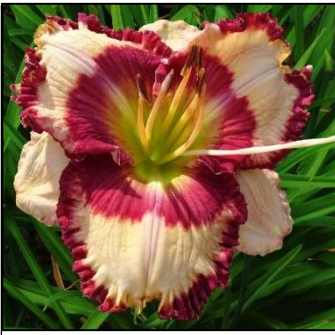
BULLFROG SMOOCH 34",Tet,7",SEv,EM,Re HARRY-P. 2012 $40