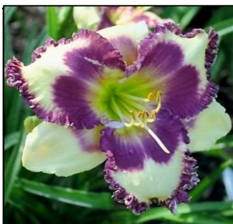
ISLA MORADA 25",Tet,5.50",Dor,M,Re PETIT 2013 $25