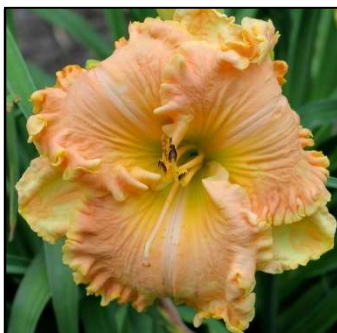
BREATH OF FRESH AIR 34",Tet,7",SEv,EM,Re SMITH-FR 2007 $25