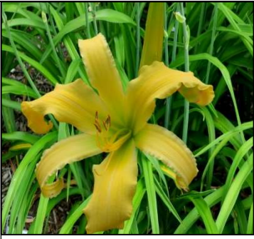
BANANA BREEZE 48",Tet,10.50",Evr,EM,Frag,Re TRIMMER 2013 $30