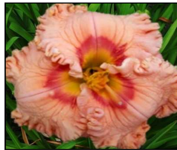
EVER SO SOFTLY 28",Tet,5",Evr,M,Re MARYOTT 2011 $20