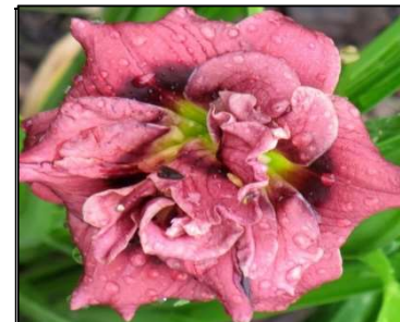
LITTLE NIGHT JEWEL 18",Dip,2.50",SEv,M, Db,Re,Mini STAMILE-G.-PIERCE 2012 $20