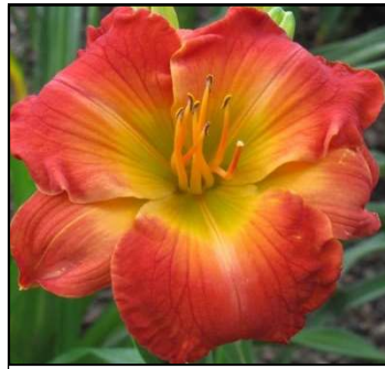
GRAND OLD FLAG 28",Tet,6",Evr,ML,Re KASKEL 1999 $20