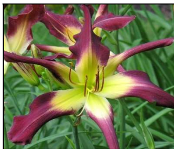
LULLABY OF BIRDLAND 48",Tet,8",SEv,M,Sp,UFO MOLDOVAN-WOODHALL 2009 $25