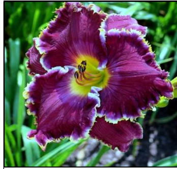
COLOSSUS 40",Tet,7",Evr,EM,Re PIERCE 2015 $40