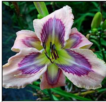
JANE'S PINK AND BLUE 30",Tet,7.50",Evr,E,Re TRIMMER, J 2014 $30