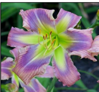
ALIEN INVADER 28",Dip,4.50",SEv,EM,Re,UFO ABAJIAN 2005 $25