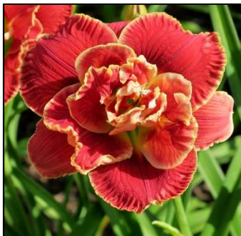
AMANDA'S LITTLE RED SHOES 24",Dip,6",SEv,E,Frag,Db,Re ELLER N 2004 $30