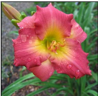
LOVE ME DO 21",Dip,3",SEv,M,Frag,Ext JAMES L 2001 $20