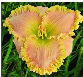
BEAUTIFUL REGINA 30",Tet,6.50",SEv,EM,Re SMITH-HARRY-P. 2012 DISPLAY