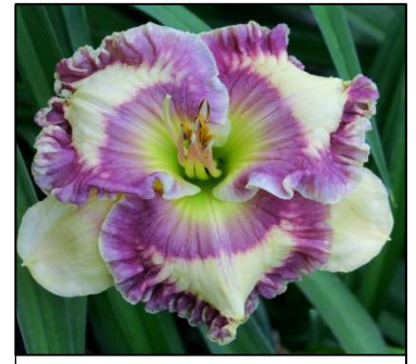
HAPPY HAPPY 26",Tet,6",SEv,EM,Re SMITH-FR 2008 $30