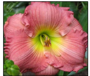
ELEGANT PINK BEAUTY 30",Tet,6",Dor,M,VFrag,Re BENZ J 2005 $25