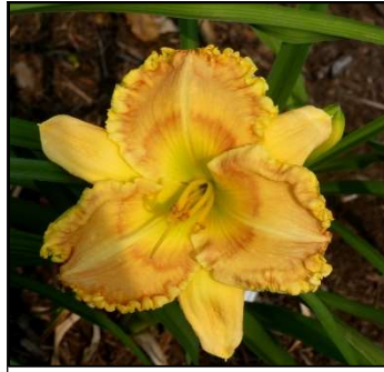
BANANA PANCAKES 34",Tet,7.25",Evr,EM,Re TRIMMER 2017 DISPLAY