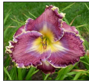
LILAC QUEEN 32",Tet,6.50",Dor,EM,Re MITCHELL, K 2008 $25