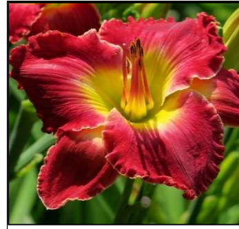
DANTE'S INFERNO 32",Tet,6.50",Dor,M,Frag, Re,Noc WOODHALL 2005 $20