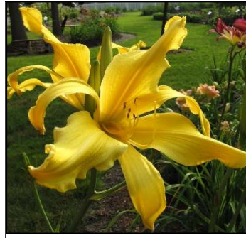
BANANA SMOOTHIE 64",Tet,10",SEv,EM,Re,UFO GEORGE T 2006 $30