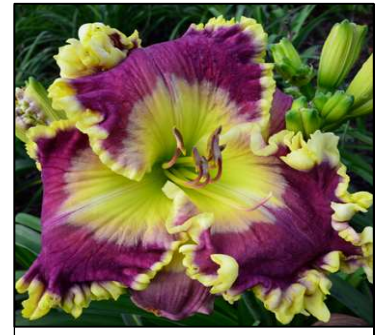
BERRY AMBITIOUS 27",Tet,7.25",Dor,EM,Re PIERCE 2018 DISPLAY