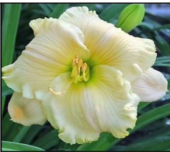
DUCK SHADES 29",Tet,6",Evr,E,Re ELLER 2007 $25