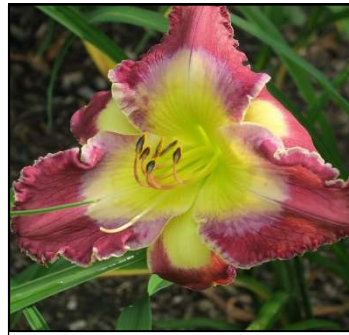
DREAMS COME TRUE 30",Tet,7",Dor,M,Re CARPENTER, M 2015 $50