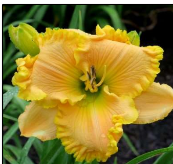
ATOMIC GLOW 36",Tet,6.50",SEv,M,Re SMITH-FR 2007 $25