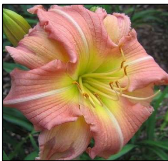
EIGHT DAYS A WEEK 30",Dip,7",SEv,ML,Db,Re SAYERS 2004 DISPLAY