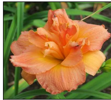
LOVELY ANNALISA 26",Tet,5.50",SEv,ML,VFrag,Db KIRCHHOFF-D. 2010 $35