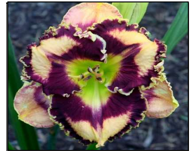
EXPLODING GALAXY 26",Tet,6.50",SEv,EM,Re SMITH-HARRY-P. 2012 DISPLAY