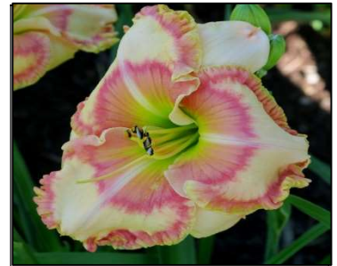
JESSICA LYNN BELL 27",Tet,6",Evr,EM,Frag,Re BELL-T 2010 $30