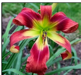
BUDDY'S WILD AND WONDERFUL 32",Tet,7",Evr,EM,Re,UFO HALL-J. 2008 $25