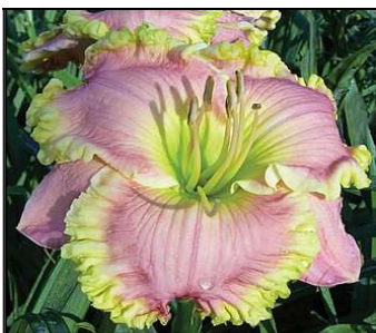
LUCK BE A LADY 36",Tet,6.50",SEv,EM,Re SMITH-FR 2009 DISPLAY