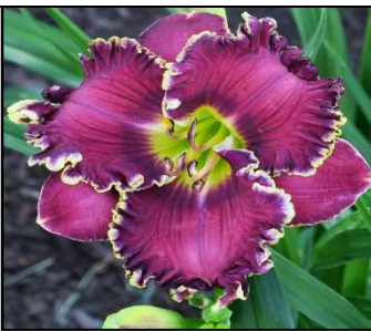
BERRY DELICIOUS 27",Tet,5.50",Evr,M,Re MARYOTT 2010 $30