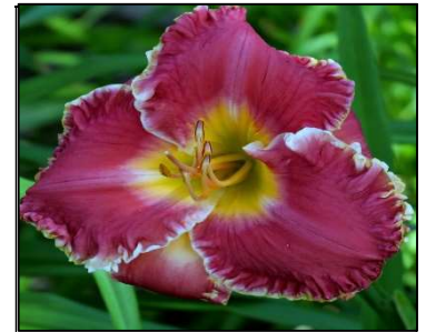
FIREWALL 35",Tet,6.75",Evr,L,Frag,Re STAMILE 2006 $30