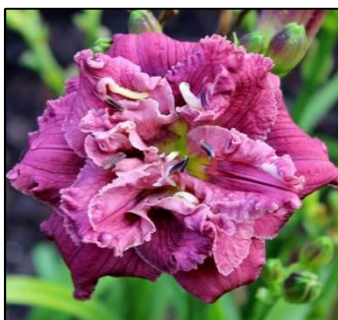
LITTLE SWEET CHEEKS 17",Dip,2.50",Dor,EM,Db, Re,Mini STAMILE-PIERCE 2014 $20