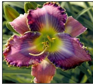
ABRAHAM LINCOLN 32",Tet,6",SEv,M,Re RICE-JA 2008 $25