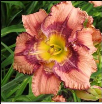
GET JIGGY 37",Tet,5",Evr,E,Re STAMILE 2008 $20