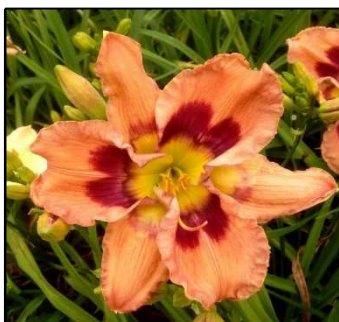
COSMIC WEB 28",Dip,6",SEv,EM,Re POLSTON 2015 $30