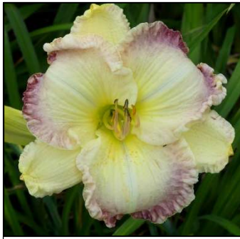
FANCY BORDER 30",Tet,5.50",Evr,M STAMILE 2007 $25