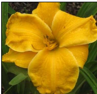
GOLD CARD 26",Tet,7",Dor,M,Re SANTA LUCIA 2000 $25