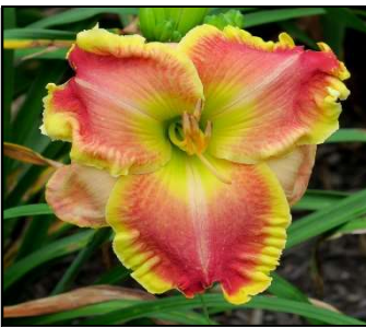
EVEN HEROES BLEED 27",Tet,7",SEv,M,Re PETIT 2009 $30