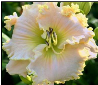
APPLE BLOSSOM WHITE 33",Tet,6.25",Evr,E,Frag,Re TRIMMER 2012 DISPLAY