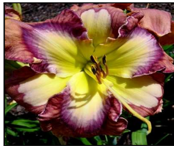
CROSS BONES 32",Tet,7",SEv,EM,Re PIERCE, G 2017 DISPLAY