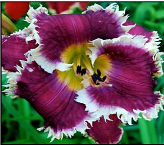
HAPPY TEETH 36",Tet,5.50",Evr,E,Re TRIMMER 2014 $35