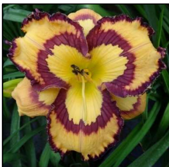
LIFT YOUR SPIRITS 24",Tet,6",SEv,M GOFF 2019 $50