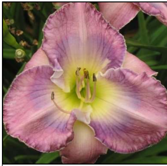
GOOD MORNING STARSHINE 25",Tet,5",SEv,M DICKENS 2012 DISPLAY