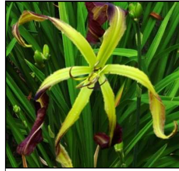
GIANT SPIDER 35",Dip,10",Dor,M,Frag, Re,UFO GOSSARD 2011 $50