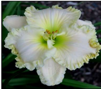
GREAT WHITE DOVE 38",Tet,6.50",Evr,EE,Frag,Re PIERCE-G. 2012 DISPLAY