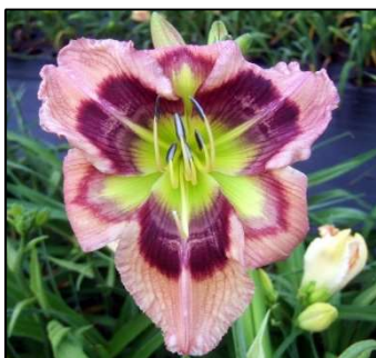
GENETIC VARIATION 36",Dip,6",SEv,EM,Frag POLSTON 2015 $25