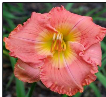
FLAMINGO PARADE 36",Tet,6",SEv,EM,Re STAMILE 2005 DISPLAY