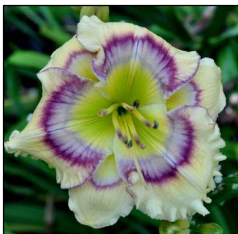
LIGHT WAVES 29",Dip,5.50",Evr,E,Re TRIMMER 2017 $50