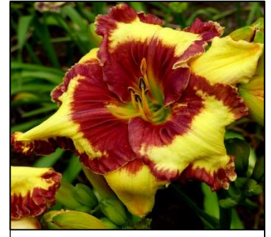
GIRLS WHO LOVE HORSES 26",Tet,6.25",SEv,EM DICKENS, D. 2021 $75