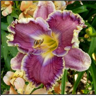
DAN MACK MITCHELL 28",Tet,7",Evr,EM,Frag,Re MITCHELL-K. 2008 $20