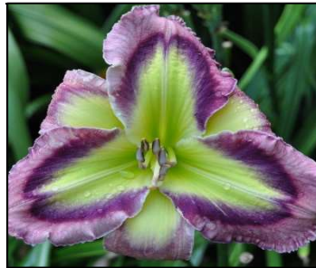
GREEN EMPEROR 32",Tet,6.50",Evr,EE,Re TRIMMER, D 2017 $40