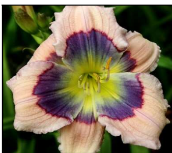
BLUE DARLING 17",Dip,2.50",SEv,EM,Re, Mini STAMILE, G-PIERCE 2014 $25