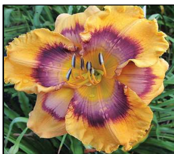
KALEIDOSCOPE DREAMSICLE 32",Tet,7",SEv,EM,Re HARRY-P. 2013 DISPLAY