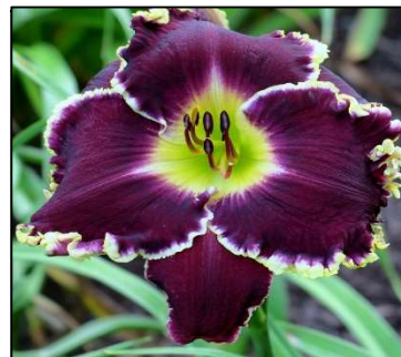
LICIA BABB 38",Tet,6.50",Evr,EM,Re PIERCE 2015 $30