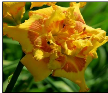
BARRY GOLDWATER 34",Tet,6",Evr,M,Db,Re,Ext KIRCHHOFF-D. 2008 30