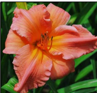
BOILED SHRIMP 35",Tet,5",SEv,ML HANSON-C. 2010 $30