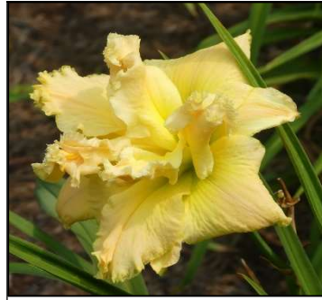
CREAM AND SUGAR 30",Tet,7",Evr,E,VFrag,Db,Re TRIMMER 2015 $50