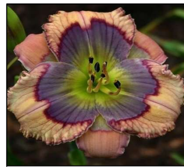
BLUE BEETLE 28",Tet,5.50",SEv,M,Frag,Re GOSSARD 2010 $30