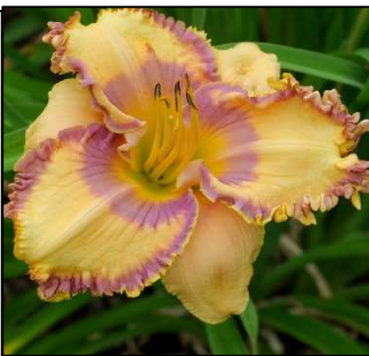
EASTER EGG 30",Tet,6.50",SEv,M,Frag PETIT 2010 $25