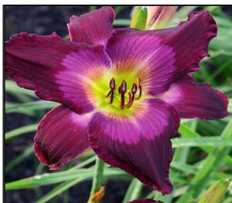
LINES OF WISDOM 34",Tet,6",Dor,EM RICE-JA 2012 $25