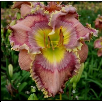
JAG 35",Tet,6.50",Evr,EM,Re PIERCE 2016 DISPLAY