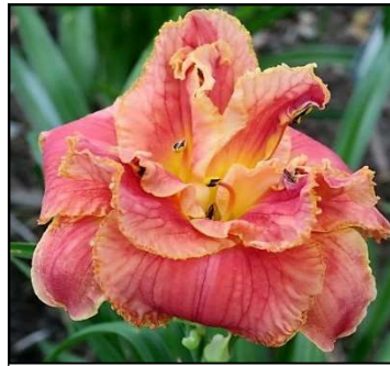
DOROTHY AND TOTO 30",Tet,6",SEv,M,Frag,Db,Re HERRINGTON K 2003 $30