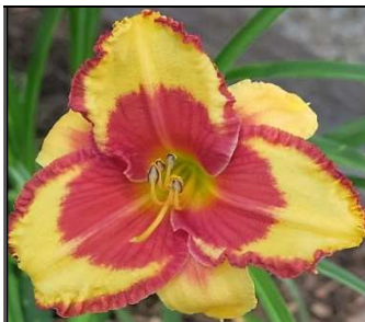
LEDGEWOOD'S FIRECRACKER 26",Tet,7",SEv,EM,Re ABAJIAN 2004 $20