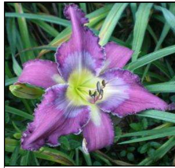
FAT TUESDAY 29",Tet,6.50",Evr,EM,Re,UFO WILKERSON 2011 DISPLAY