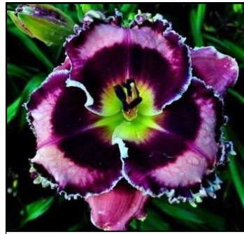
BLUEBERRY DREAM 28",Tet,5.50",Evr,E,Frag,Re STAMILE-PIERCE 2010 $35