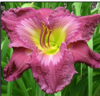
EYES ARE MOSAICS 33",Tet,5.50",SEv,EM HANSON-C 2011 $25