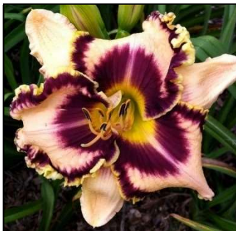
A FEW GOOD MEN 34",Tet,5",Evr,EM,Frag,Re BELL-T. 2009 DISPLAY