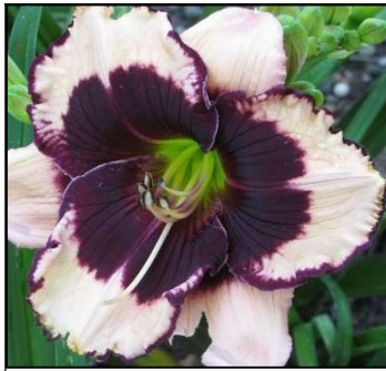
JANE TRIMMER 25",Tet,5",Evr,EM,Re TRIMMER 2002 $25