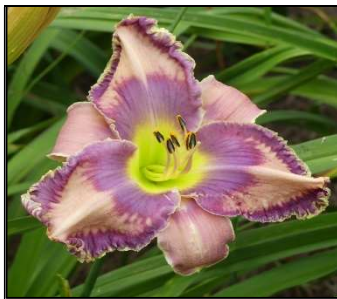
BLUE-BREASTED BEE-EATER 25",Tet,6",SEv,EM,Re LAMBERTSON 2011 $30