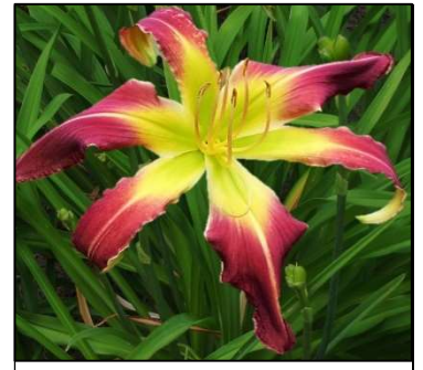
EMERALD TARANTULA 36",Tet,11.50",SEv,EM,Re,UFO PIERCE 2015 $50