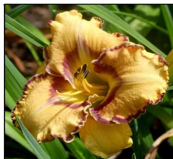
CAPTAIN PICARD 24",Tet,6.25",SEv,M,Frag,Re PEAT 2006 $30