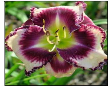
DYNAMIC GLOW 40",Tet,6.75",Evr,EM,Re PIERCE 2015 $30