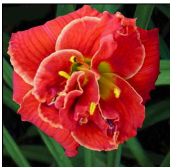
BLAZING KISSES 26",Tet,5.50",SEv,E,Db ELLER-N. 2014 $35