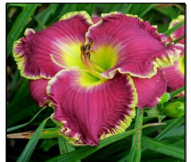
JULES LOUIS PETIT 25",Tet,6",SEv,M,Frag,Re PETIT 2010 $30