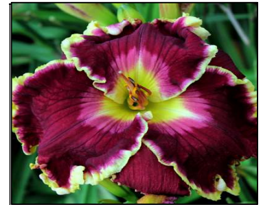
BIG 8 34",Tet,8",Evr,EE,Frag PIERCE-G. 2015 DISPLAY