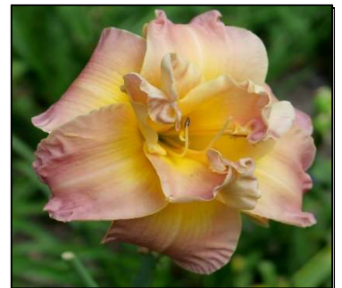
INCREDIBLE PEDESTAL 40",Tet,5.50",SEv,E,Frag,Db,Re ELLER-N. 2011 $30