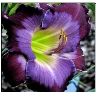
BUCKEYE BLUES SINGER 25",Tet,5.50",SEv,M,Frag HAEHN 2010 DISPLAY