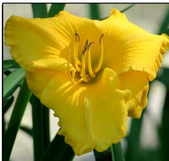
AFTER THE GOLDRUSH 33",Tet,6",Dor,ML,Frag,Re HANSON-C. 2012 $25