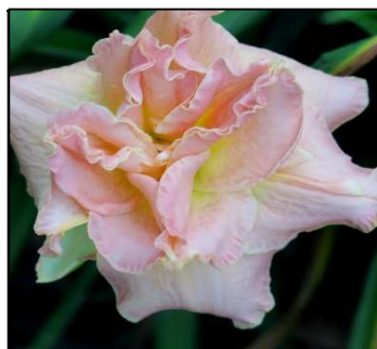
COSMOPOLITAN TRUFFLE 24",Tet,5",SEv,E,Db,Re,Ext KIRCHHOFF-D. 2008 $25