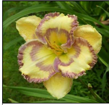
HONEY IN THE ROCK 26",Tet,Sev,M,Re DICKENS, R 2024 $75