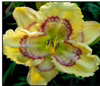
CIRCLE IN THE STORM 35",Tet,6",Evr,E,Re TRIMMER 2015 $25