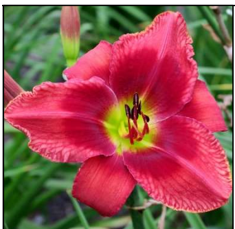
CAROLINA DALE 32",Tet,7",Dor,ML,Re SANTA LUCIA 2008 $25