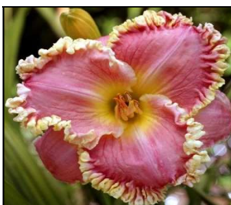
BUBBLEGUM DELECIOUS 28",Tet,6",Evr,EM,Re MITCHELL 2009 $25