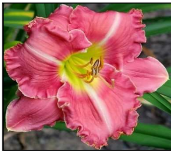
GALAXY QUEST 24",Tet,6",Evr,M,VFrag,Re BENZ J 2005 $10