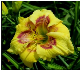
FOUR BEASTS IN ONE 32",Tet,5.50",SEv,EM,Frag DECAIRE 2009 $35