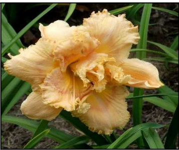
BARBARA WATTS 28",Tet,6",Evr,EM,Db,Re,Ext KIRCHHOFF-D. 2008 $25