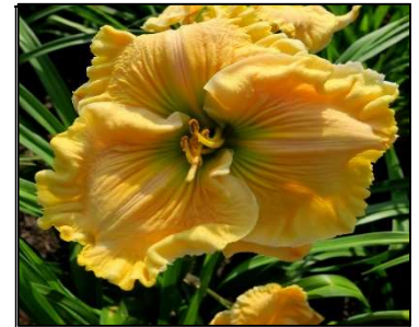
BOCA GRANDE 29",Tet,7",SEv,M,Frag,Re PETIT 2013 $40