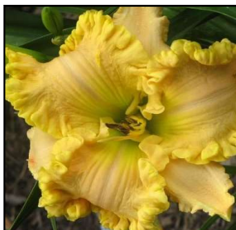
CARVED COMPLEXITY 30",Tet,7",SEv,M,Re PETIT 2008 $25