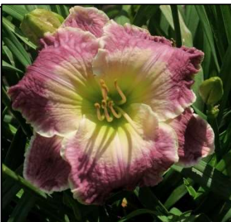
JEWEL OF TAVARES 27",Tet,7.50",SEv,EM,Re HARRY 2015 $30