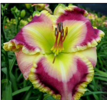
JADE OVATION 34",Tet,8",SEv,E,Frag,Re PIERCE 2015 $60