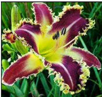
LARRY'S TWILIGHT BITE 31",Tet,8.50",Dor,ML,Frag,Re GOSSARD 2012 $30