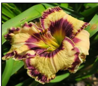
CAT'S EYE 28",Tet,6.50",SEv,EM,Re TOWNSEND-J 2011 $30