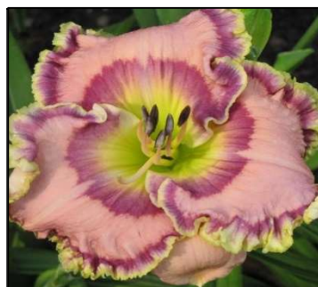
CURB APPEAL 32",Tet,6.25",Evr,EM,VFrag,Re PIERCE-G. 2012 $25