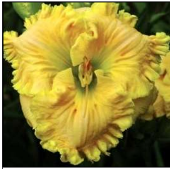
ELOQUENT CAY 37",Tet,6",Evr,M,Frag,Re STAMILE 2006 $25