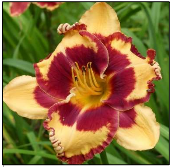
DON'T THINK TWICE 42",Tet,7",SEv,M,Re DICKENS, D 2024 $75