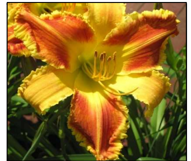
HEMAN 35",Tet,9",Dor,ML,Re,UFO GOSSARD, 2007 $30