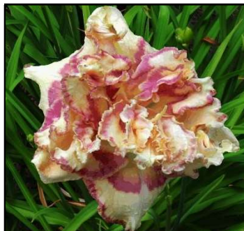
LOVELY AND AMAZING 31",Tet,6",SEv,M,Db,Re PETIT 2011 $35