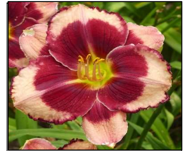
BART ROBERTS 27",Tet,7",SEv,M,Re STAMILE 2008 $25