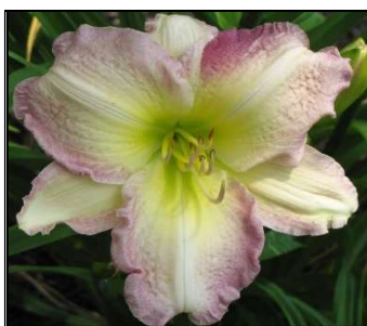
JUST MY IMAGINATION 25",Dip,5.25",Dor,L WINTER 2013 $20