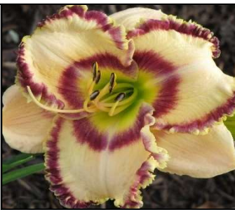
JELLY MAKER 32",Tet,6.50",SEv,M,Frag,Re SHOOTER 2004 $25