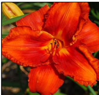
ASHWOOD INFERNO 28",Tet,6",SEv,ML,Re NORRIS-R. 2010 $25