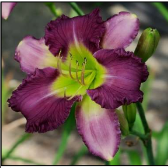
DREAM SEQUENCE 33",Dip,8",Dor,M RICE-JA 2007 $25