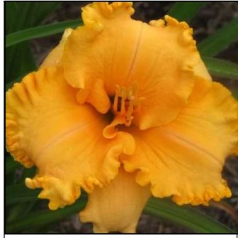
HOG HEAVEN 28",Tet,6",SEv,EM,Re,UFO SMITH-FR 2007 $25