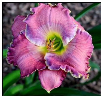
DOYLE PIERCE 34",Tet,6",SEv,EM,Frag,Re GRACE-SMITH 2004 $25