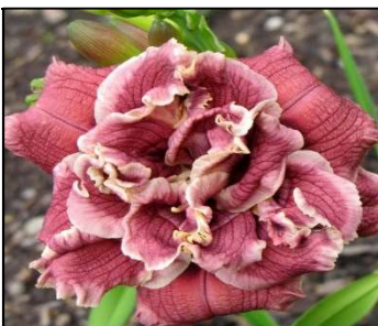
LITTLE DUNKIN 17",Dip,2.50",SEv,EM,Db,Re, Mini STAMILE-G.-PIERCE 2012 $20