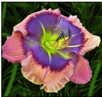
FREAKY GOOD 30",Tet,6.50",SEv,EM,Re SMITH-HARRY-P. 2012 DISPLAY