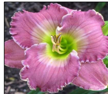
LIVING WATER 28",Tet,4.50",SEv,ML,Frag EMMERICH 2011 $20