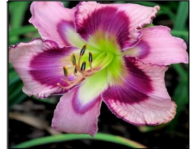
HAUTE COUTURE 34",Tet,6",Dor,M MOLDOVAN-WOODHALL 2011 $25