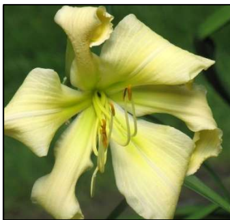
HEAVENLY CURLS 27",Dip,7",Dor,M,UFO GOSSARD 2000 $20