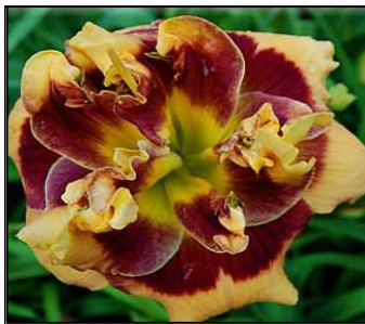
CACTUS JACK 32",Tet,5.50",Evr,M,Db,Re TRIMMER 2007 $25