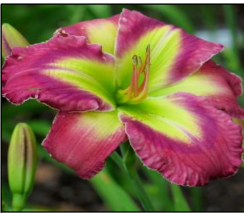
COOL CRYSTALS 32",Tet,7.25",Evr,EM,Frag,Re PIERCE 2019 $70