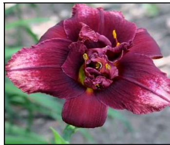
CALICO PRINT 30",Dip,5.50",Dor,M,Db KROPF 1992 $20