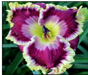
BLUEGRASS SHADOWS 37",Tet,6.50",SEv,EM PIERCE-G. 2014 $40