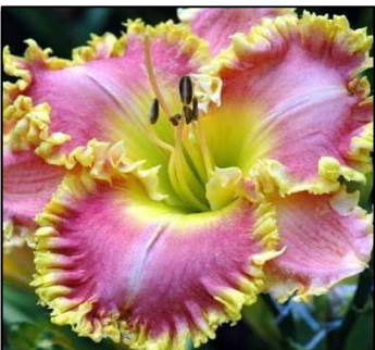
GAUDEAMUS 38",Tet,6",Dor,M MOLDOVAN 2010 $30