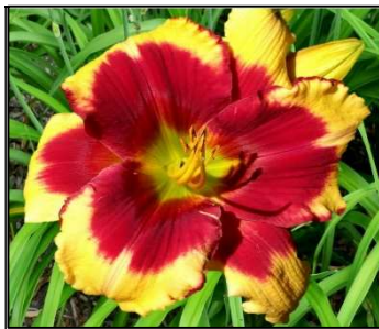
CRIMSON SUN 40",Tet,6.25",Evr,EM,Re PIERCE 2016 $70