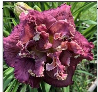
DATE WITH DESTINY 30",Tet,6",Dor,M,Db,Re STRADLER 2007 $40