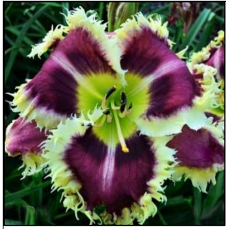
GET SPIKED 30",Tet,5.75",SEv,EE PIERCE, G. 2019 DISPLAY