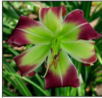
CHRISTMAS COMING 36",Dip,7",Dor,L REINKE B 2006 $25