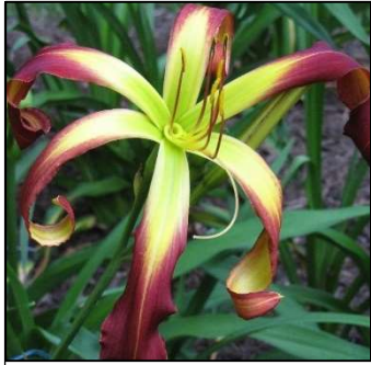
FRENCH TWIST 38",Tet,9",Evr,EE,Frag,Re,Sp STAMILE 2003 $25