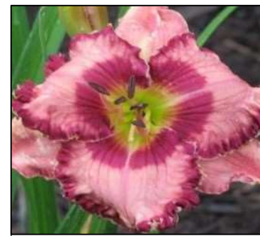
CASA DES JUAN 26",Tet,7",SEv,M,Re PEAT 2006 $25