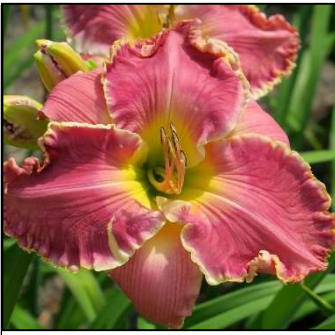
HANNAH MARIE 30",Tet,7",Evr,L,Frag,Re BELL-T. 2008 $30