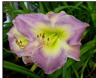
AEGEAN WIND 36",Tet,7",SEv,ML,UFO HANSON C 2006 $20