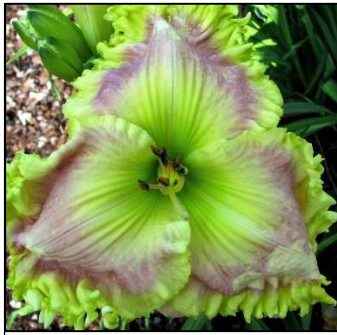
BURMESE JADE 35",Tet,7",SEv,EM,Re PIERCE-G. 2012 $35