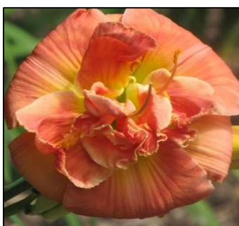
BUDDY'S GLORIA 26",Tet,7",Evr,EM,Db,Re HALL-J 2008 $25