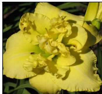
HEAVENLY MELLOW YELLOW 34",Tet,7",Dor,M,Frag,Re GOSSARD-D. 2008 $30