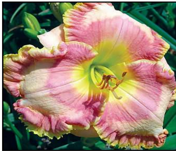
FRANK'S ADORABLE CANDY 28",Tet,6",Evr,EM,Re SMITH-FR 2007 $25