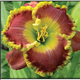
FAME 26",Tet,6",Dor,EM,Frag,Re GRACE-SMITH 2005 $25