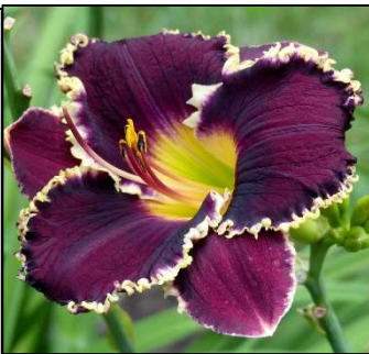
GREG TROTTER 30",Tet,4.75",SEv,M,Re RICE-JA 2013 $25