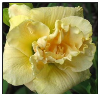
DEBUTANTE DOUBLE 32",Tet,6",Evr,E,Db,Re,Ext KIRCHHOFF D 2002 $20