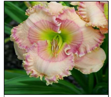
DUCK CANDY 26",Tet,6",SEv,E,Frag,Re ELLER 2010 $30