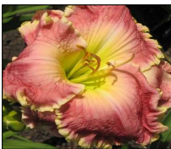
JURASSIC PINK 45",Tet,7.50",Evr,EM,Frag,Re STAMILE-PIERCE 2012 $35