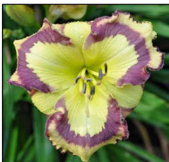
FLAMINGO CROSSING 33",Tet,6.25",Evr,EM,Re TRIMMER 2015 $30