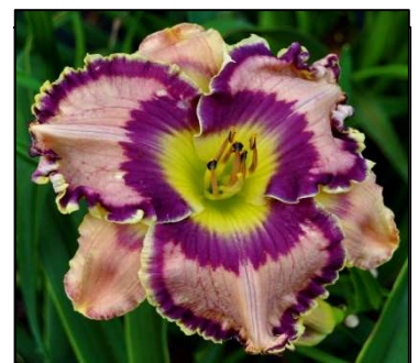
DEEP DESIGN 30",Tet,6.75",Evr,M,Re TRIMMER, D 2017 $40