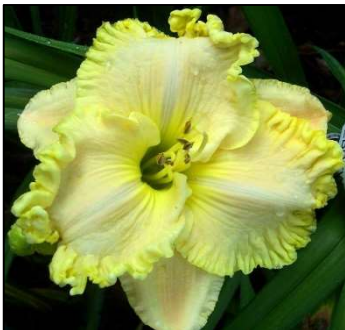
DEBBIE NICCOLE COX 28",Tet,6",Evr,EM,Re BELL-T. 2012 $25