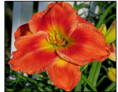
CAMINO REAL 24",Tet,5.75",SEv,L,Re SELLERS 2006 $25