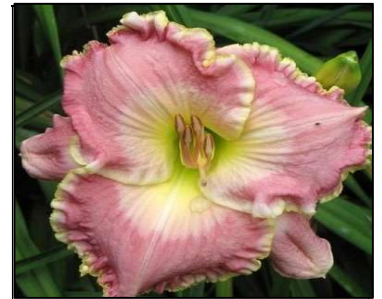
COSENZA 28",Tet,6",Evr,EM,Re STAMILE 2007 $35