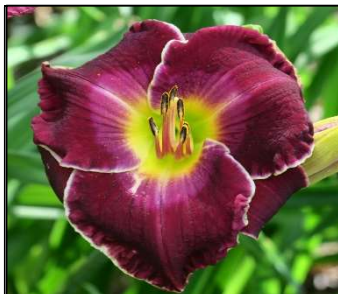
APPROACHING STORM 36",Tet,5.50",Dor,M NORRIS-R. 2013 $20