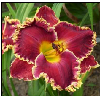
BOLD PAINT 30",Tet,6",SEv,M,Frag,Re STAMILE 2009 $30