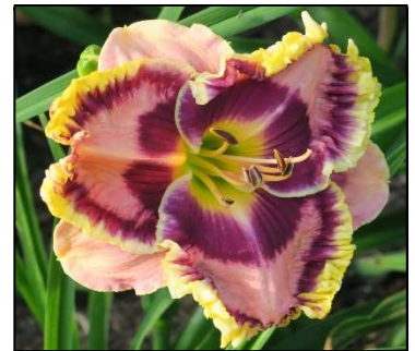
HALLOWEEN EFFECT 38",Tet,5.75",Evr,EM,Re PIERCE 2014 $40