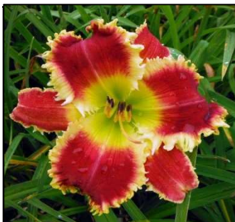
LITTLE RED AND THE WOLF 29",Tet,5.50",SEv,M POLSTON 2015 $30