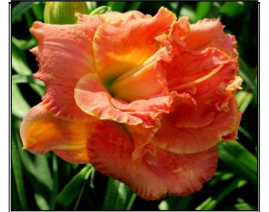
TRUFFLE A LA MODE 24",Tet,5.50",Evr,ML, Db,Re KIRCHHOFF-D 2008 $25