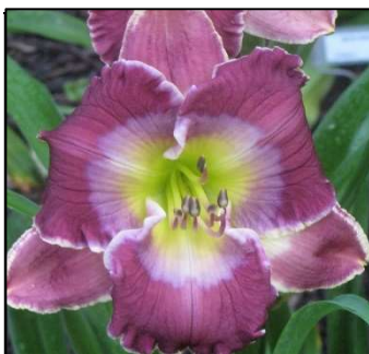
SUMMER SNOWBALL 24",Tet,6",Dor,VL,Re CARPENTER-CARPENTER 2011 $20