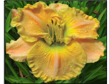
THE ANOINTED ONE 28",Tet,7.50",SEv,M,Re PETIT 2008 $25