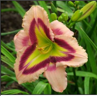
PIKES PEAK 45",Tet,7",Evr,EM,Frag STAMILE-PIERCE 2010 $25