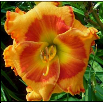
SANTA CLARA 31",Tet,6",Evr,EM,Re TRIMMER 2014 $30