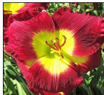
RUBY AND EMERALD 34",Tet,6.50",SEv,VL,Re HARRY-P. 2012 DISPLAY