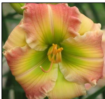
PAUL SAIN'S PRIZE 26",Tet,6",Evr,M,Re BARNABY 1999 $20