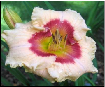
SOPHIA'S LIPS 22",Dip,5.25",Dor,EM,Frag,Re, Noc,Ext WILSON T 1994 DISPLAY