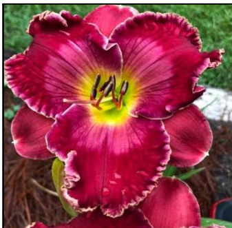
RUBY SUNRISE 38",Tet,6.50",Evr,EM,Re TRIMMER, D 2017 $40