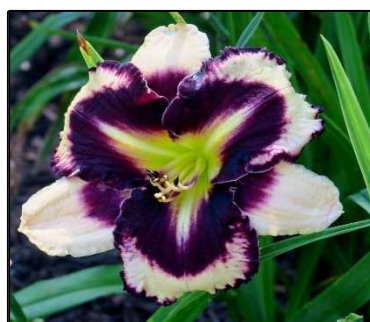
PICOTEE PRISM 27",Tet,5.50",Dor,EM,Frag,Re STAMILE-PIERCE 2010 $30