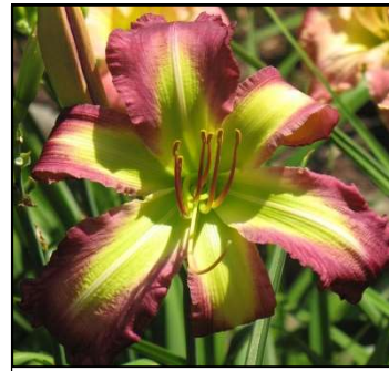
ROSE F. KENNEDY 29",Dip,7.50",Dor,M DOORAKIAN 2007 $35