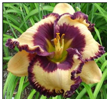
THE GIFT OF PIZAZZ 40",Tet,5.55",SEv,EM PIERCE 2017 DISPLAY