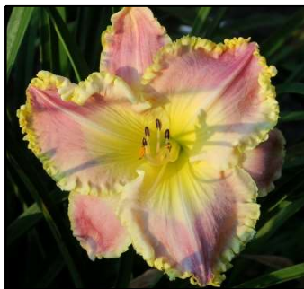
ROARING LIONS 37",Tet,6.50",Evr,EM,Re PIERCE 2016 $50