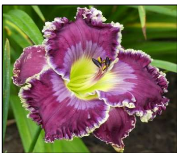
RULER OF NATIONS 32",Tet,6",SEv,ML,Re EMMERICH 2021 DISPLAY