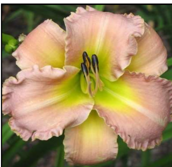
STILL MORNINGS MIST 33",Tet,5",SEv,M HANSON-C. 2007 $25