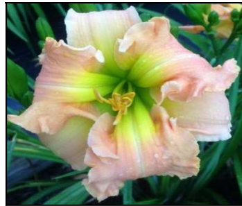
THE ANDROMEDA STRAIN 35",Tet,5",SEv,M,Frag,Re POLSTON 2015 $100