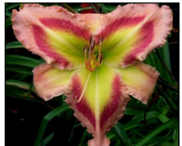
QUEEN OF GREEN 40",Tet,9",Evr,EM TRIMMER 2014 $35