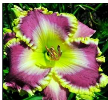
OCEAN RAINBOW 33",Tet,6.50",Evr,EM,Frag,Re PIERCE-G. 2011 $35