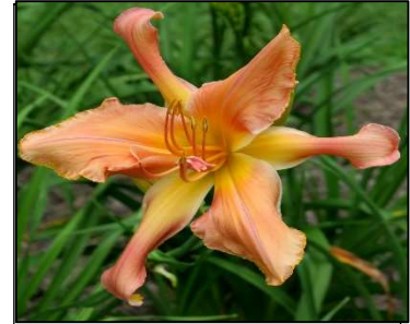
SPACE FORCE 45",Tet,7",SEv,M DICKENS, R. 2020 $60