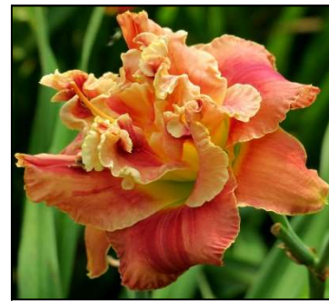
WELCOME TO DREAMLAND 35",Tet,5.75",SEv,E,Frag, Db,Re ELLER-N 2010 $30