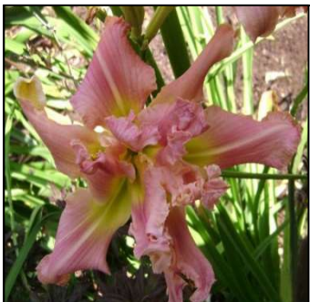
WORLD GONE WILD 37",Tet,7",SEv,E,Frag,Db, Re,UFO ELLER-N. 2015 DISPLAY