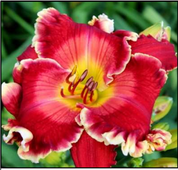
RED EDITION 40",Tet,6.25",Evr,EM,Re PIERCE-G. 2013 $30