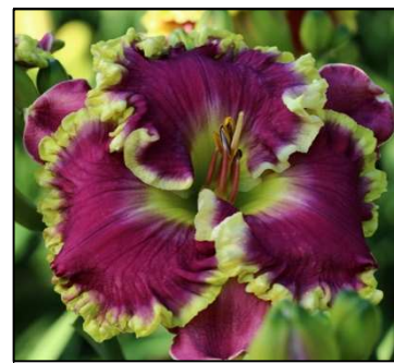
MEAN JOE GREEN 40",Tet,6.75",Evr,M,Re PIERCE-G. 2012 $50