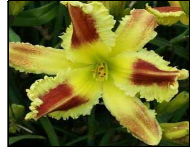
OUTER LIMITS 32",Tet,6.50",Dor,ML,Frag,UFO GOSSARD 2008 $40