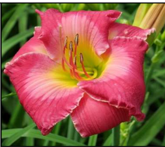
ROSY COMPLEXION 32",Tet,5.50",SEv,M RICE-JA 2010 $25