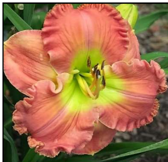
WORTH IT ALL 22",Tet,6.50",Evr,M,Frag,Re CARPENTER J 2003 $30