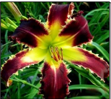
SPACECOAST CHOMP! CHOMP! 36",Tet,10",SEv,E KINNEBREW-J. 2011 $35