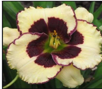
TRUE NORTH 30",Tet,4.25",Evr,EM,Re TRIMMER 2007 $15