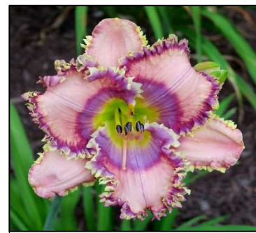
MALIBU MORNING 32",Tet,5.75",Evr,EM,Re TRIMMER, D 2017 $35