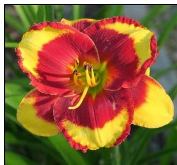
PACO BELL 22",Tet,4.75",Dor,E,Re SALTER 2008 $20