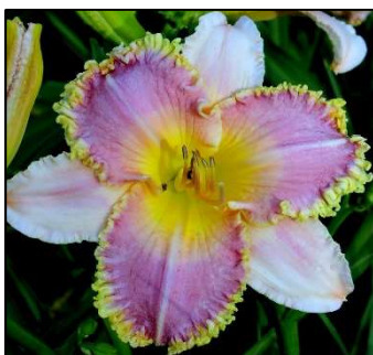
MARTHA CHAMBERLAIN 30",Tet,5.50",Dor,ML RICE-JA 2010 DISPLAY