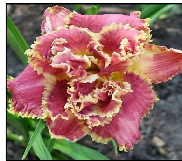
VENETIAN FRINGE 25",Tet,7.50",SEv,M,Frag,Db,Re PETIT 2008 DISPLAY