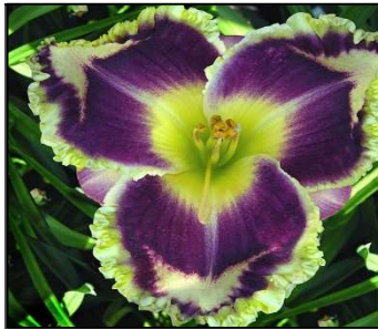
SOUTHERN DAZZLE 28",Tet,6.50",SEv,EM,Re HARRY-GASKINS 2008 $40