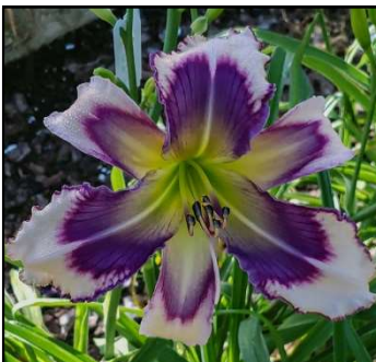
SPACECOAST NARROW ESCAPE 34",Tet,8",SEv,E,Re GOSSARD, J-KENNEBREW J 2022 DISPLAY