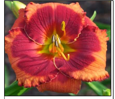
ORANGE CITY 29",Tet,4.75",Evr,EM,Re TRIMMER 2006 $25