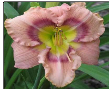
MYSTICAL RAINBOW 25",Tet,5.50",Dor,EM,VFrag, Re,Ext STAMILE 1996 $15