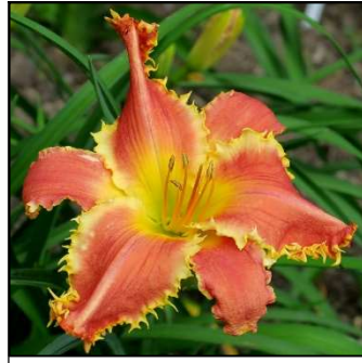
SHAMELESS BEAUTY 24",Tet,5.50",Dor,EM DICKENS, R 2020 $40