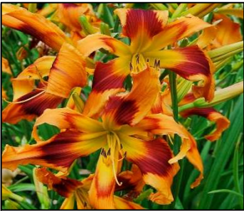
ORANGE SPICE 40",Dip,8",Evr,EM,Re TRIMMER, D 2012 $60