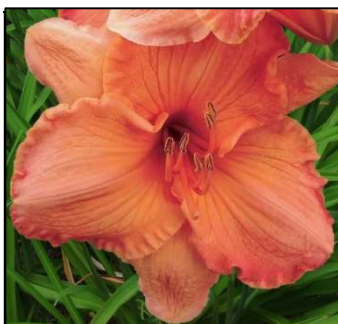
THIRTY SECONDS OVER TOKYO 36",Tet,6",SEv,ML HANSON C 2009 $15