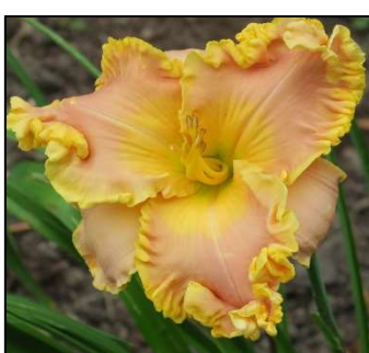
STARDUST MEMORIES 28",Tet,6.50",SEv,M,Re PETIT 2009 $25