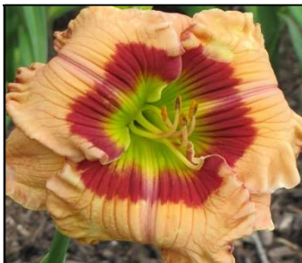
SPACECOAST RIO VERDE 24",Tet,6.50",SEv,EM,Re KINNEBREW-J. 2010 $25