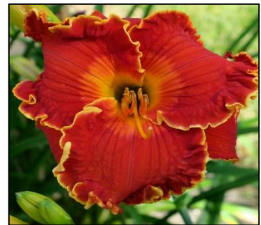
SPACECOAST FRANCIS BUSBY 28",Tet,6",Evr,EM,Re KINNEBREW-J. 2010 $25