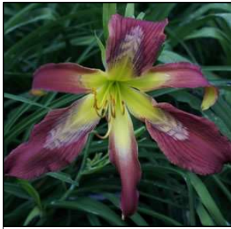
RAINBOW DRAGON 32",Dip,9",SEv,EM,Frag, Re,UFO GOSSARD 2013 $30