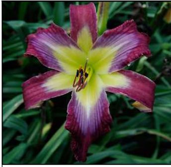
VIOLET SPRING 26",Tet,8.50",Evr,M,Frag,Re TRIMMER-J. 2013 $30