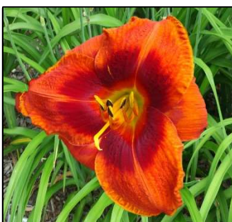
MOTOR CITY'S BURNING 30",Tet,5.50",Dor,M,Frag ADAMS-R. 2011 $20