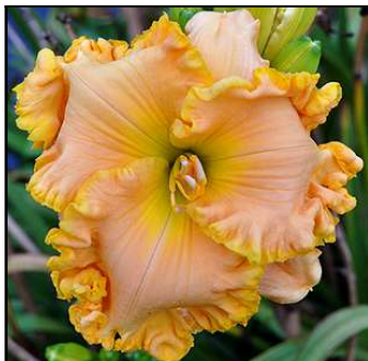
PEACH SENSATION 33",Tet,6",Evr,M,Frag,Re TRIMMER 2014 $30