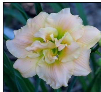
PEACE ON EARTH 30",Dip,4.25",Dor,EM,Frag, Db,Noc,Ext APPLEGATE 1994 $20