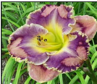
XYLOPHONE JAZZ 30",Tet,5.75",SEv,EM,Frag,Re STAMILE-PIERCE 2011 DISPLAY