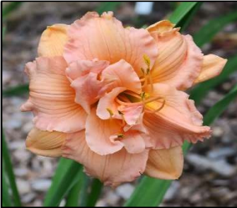
SING PSALMS 25",Dip,4",SEv,ML,Frag,Db APPLEGATE 2001 $20