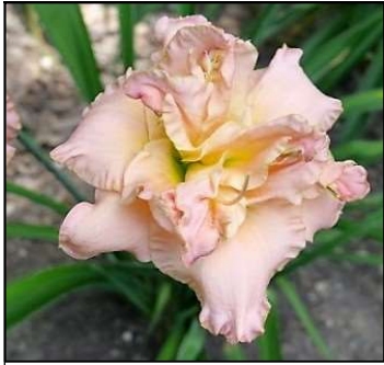
PINK EMBROIDERY 24",Tet,6",Evr,EM,Frag,Db,Re STAMILE 2003 $25