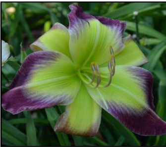
PIRATE QUEEN 35",Dip,7",Dor,M,Re HUGHES-TRIMMER 2017 $50