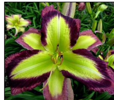
SPARKLING GIANTS 44",Tet,10.50",SEv,EM,Re PIERCE-G. 2017 DISPLAY