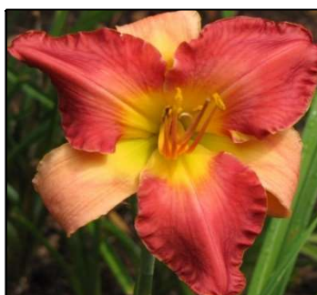
SAMURAI SWORD 30",Tet,5.50",Dor,ML,Re,UFO MOLDOVAN 2002 $25