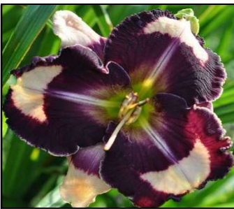
NICOLE'S THE ONE AND ONLY 27",Tet,6.50",SEv,EM,Re HARRY 2010 $30