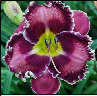
SILVER MOON SPARKLE 30",Tet,6",Evr,EM,Re TRIMMER 2009 $35