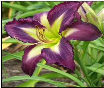
PIRATE'S ISLAND 30",Tet,8.75",SEv,EE,Frag,Re PIERCE G. 2015 $50