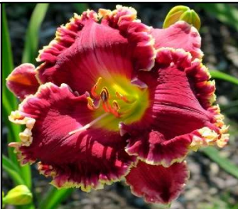
RAMBLING RED 30",Tet,6.50",Evr,EM,Re PIERCE-G. 2015 DISPLAY