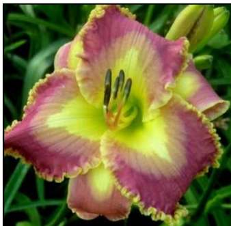
SPACECOAST MULTILEVEL DEAL 28",Tet,6",Evr,EM,Re KINNEBREW-J. 2010 $25