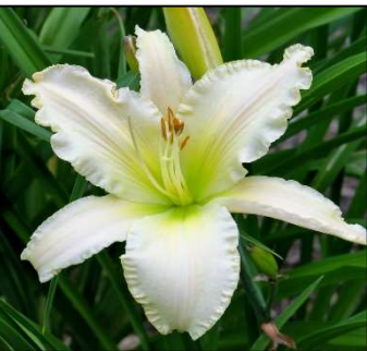
STARDUST DRAGON 33",Tet,8.50",Dor,M,Frag, Re,UFO GOSSARD 2011 $25