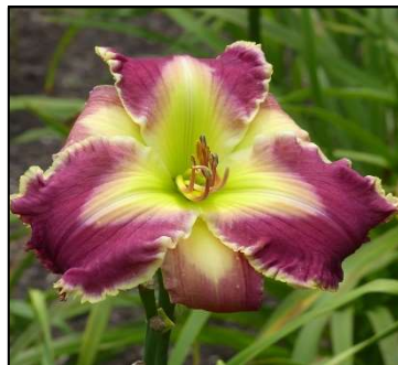
PURPLE NINJA 38",Tet,11.75",SEv,EM,Frag,Re PIERCE-G. 2017 $70