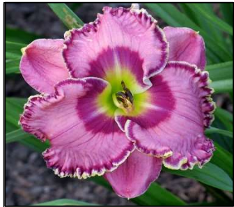
OSCAR'S CHOICE 30",Tet,7.50",SEv,E,Re HARRY-P. 2013 $25