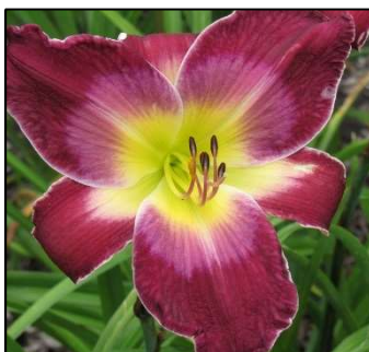
ROYAL SUITE 32",Tet,7",Dor,M,Frag HAEHN 2011 $30