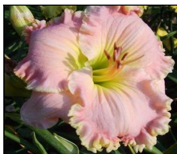
MEMPHIS TRIMMER 29",Tet,6",SEv,EM,Re TRIMMER 2006 $25