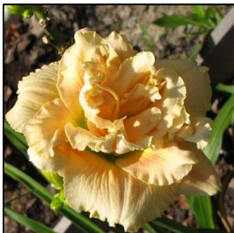
PEACEFUL SERENITY 30",Tet,6",Dor,E,Db,Re ELLER-N. 2007 $35