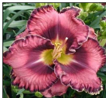
SET FREE 28",Tet,5",Dor,M,Frag,Re EMMERICH 2009 $20