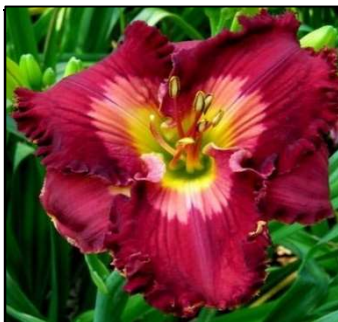
SPACECOAST VELVET VALENTINE 26",Tet,6",SEv,E,Re KINNEBREW-J. 2010 $25