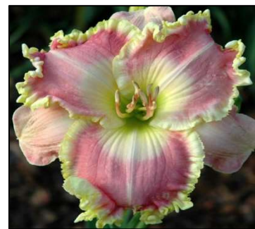
WHITE BASE 36",Tet,7",Evr,ML,VFrag,Re STAMILE 2008 $25