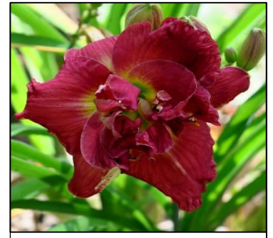
ROSE STORM 22",Dip,4.50",Dor,EM,Db,Re SANTA LUCIA 1999 $25