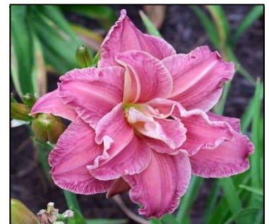
PEACEFUL EASY FEELING 39",Tet,6.50",SEv,E,Frag, Db,Re ELLER-N. 2011 $25