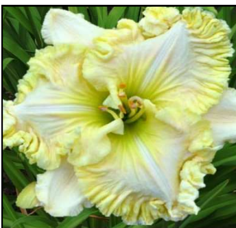
WHITE WIZARD 28",Tet,6",SEv,EM,Re HARRY 2010 $30