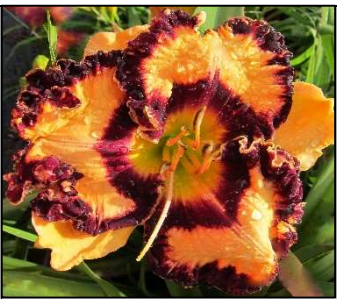
SPOOKTASTIC 29",Tet,7",SEv,EM,Frag,Re HARRY-P. 2017 $40