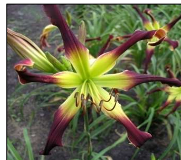
TOPSPIN 38",Tet,11",Evr,EM,Re,Sp STAMILE 2006 $30