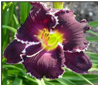
SPACECOAST TASMANIAN DEVIL 26",Tet,6",Evr,EM,Frag,Re KINNEBREW-GOSSARD 2015 DISPLAY