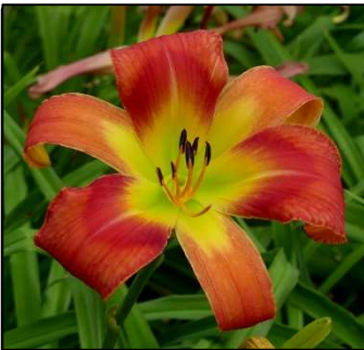
PLEDGE A GRIEVANCE 34",Tet,7",Dor,M,Frag,UFO BREMER 2012 $20