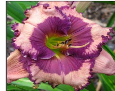
ZAHADOOM 28",Tet,5.50",Dor,EM,VFrag,Re STAMILE 2002 $30