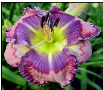
MALIBU TWILIGHT 44",Tet,5.50",Evr,M PIERCE-G. 2015 $40