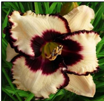
THE HEAVENS DECLARE 25",Tet,6.50",Dor,M,Frag,Re BELL-T. 2012 DISPLAY