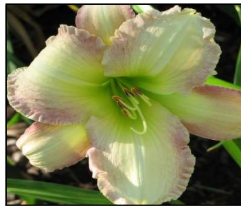
NOE CLAIRE 35",Dip,6.75",Dor,M,Frag WINTER 2010 DISPLAY