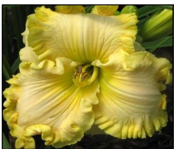
MOMENT IN THE SUN 28",Tet,6.50",SEv,EM,Frag,Re GRACE-SMITH 2004 $25