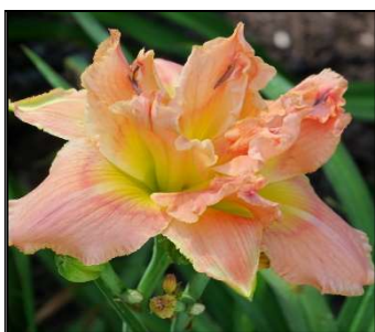
MEMORIES OF TREVA 29",Tet,6.75",SEv,E,Db,Re ELLER-N. 2010 $25