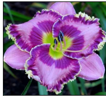
MY FRIEND PHIL 48",Tet,6.50",Evr,EM,Re PIERCE 2015 $30