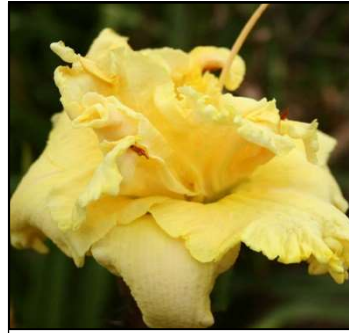
TAY TAY'S PAPA 25",Tet,7",Evr,M,Frag,Db KIRCHHOFF - D 2010 $25