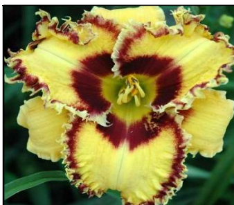
WICKEDLY WILD AND WONDERFUL 28",Tet,6",SEv,EM,Re SALTER 2010 $35