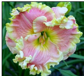
POLAR DUSK 30",Tet,7",SEv,EM,Re STAMILE 2010 $30