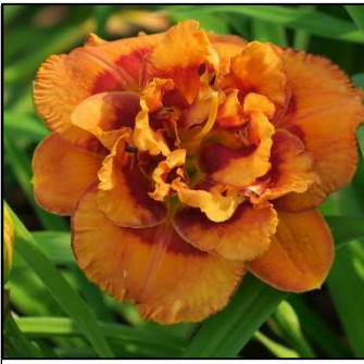
RAE'S TANGERINE DREAMS 27",Tet,5.50",SEv,M,Db DICKENS, R 2021 $40