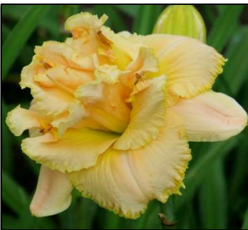
TRUFFLICIOUS 27",Tet,5.50",Evr,E,Db,Re,Ext KIRCHHOFF D 2005 $25