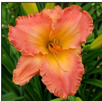
MAI TAI 31",Tet,6",SEv,M RICE-J 2010 $35