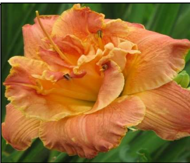
SIESTA KEY SUNSET 27",Tet,5.50",Dor,M,Frag,Db,Re PETIT 2010 $30