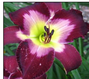
SUPERMODEL 32",Tet,7",Dor,M,Frag GOSSARD 2008 $25