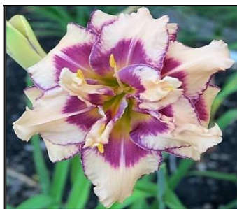
TWICE AS NICE 26",Dip,5",Dor,EM,Frag,Db, Re,Noc HERRINGTON T 1999 $15