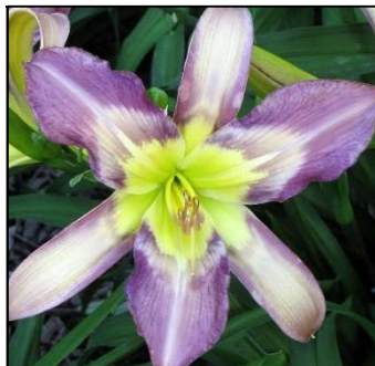
TURQUOISE TEMPLE 34",Tet,9",SEv,E,Re,UFO LAMBERTSON 2004 $15