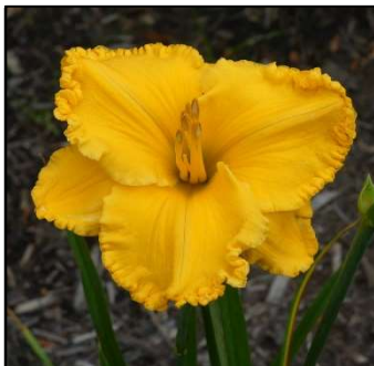
SPACECOAST GOLD DOUBLOON 28",Tet,6.50",EM,Re GOSSARD, J-KENNEBREW J 2022 DISPLAY