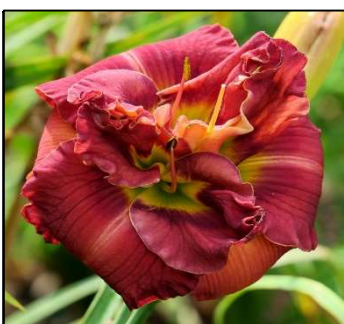
TOO PRETTY TO PASS BY 37",Tet,6.75",Dor,M,VFrag, Db,Re GOSSARD-D. 2013 $30