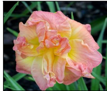
PAT NEUMANN 28",Dip,6",Dor,EM,Frag,Db TRIMMER 1998 $25