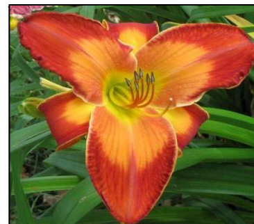
MATCHLESS FIRE 29",Tet,6.25",SEv,M,Frag SCHINDLER 2004 $20