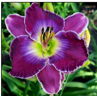
STEVE MOLDOVAN 36",Tet,6.50",SEv,M,Re MOLDOVAN-WOODHALL 2008 $50