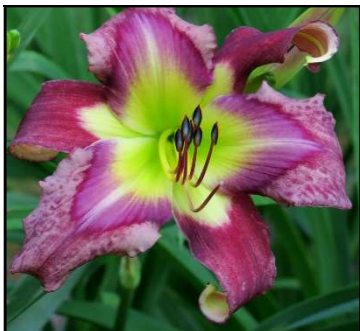
PURPLE CHEETAH 32",Tet,7.50",Dor,M,Frag, Re,UFO GOSSARD 2006 DISPLAY