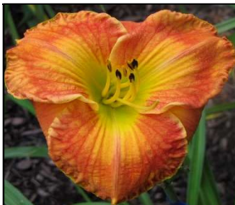
XOCHIPILLI 28",Tet,5.50",Evr,M,Re KIRCHHOFF-D 2010 $20