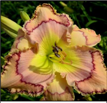
TRANQUIL TIGER 37",Tet,6.50",Evr,EM,Re PIERCE 2016 DISPLAY