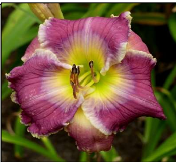
RING THE BELLS OF HEAVEN 24",Tet,5.75",Dor,EM,Frag,Re CARPENTER J 2006 $25