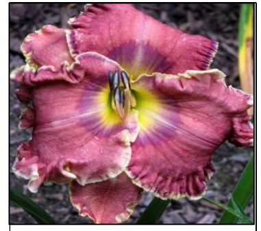
SPLENDIDA 36",Tet,6",Evr,M,Re MARYOTT 2013 $30