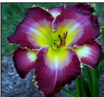
WOLF IN SHEEP'S CLOTHING 29",Tet,5.50",Dor,M,Frag,Re GOSSARD 2011 $25