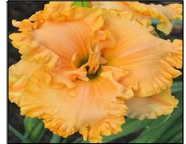
PATSY CLINE 36",Tet,7",SEv,EM,Re SMITH, F R 2008 $25