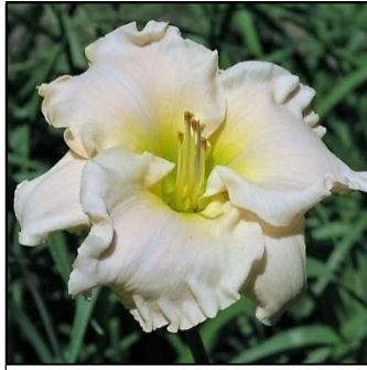
SNOWFLAKE EMPRESS TET 28",Tet,7",Dor,M,Frag DOUGHERTY 1995 $20