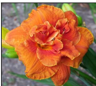
PENNY LANE 24",Tet,5.50",SEv,EM,Db HERR D 2000 $20