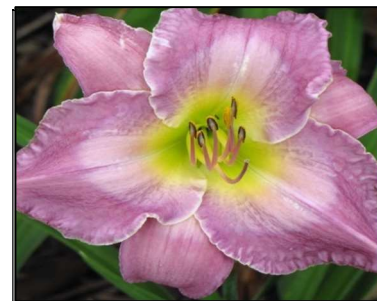
VERONICA'S VEIL 32",Tet,6",Dor,M,Re MOORE ED 2009 $20