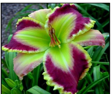
VERDANT GLOW 28",Tet,6.50",SEv,EM,Frag,Re PIERCE 2015 $50