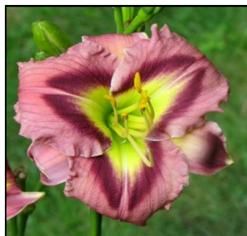
MALACHITE PRISM 36",Dip,4.25",SEv,M,Re DOORAKIAN 1999 $20