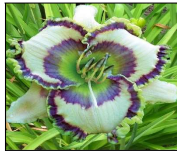
ROYAL CYPHER 32",Tet,6",SEv,M,Frag,Re PETIT 2010 $30