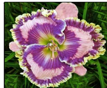
PETE'S PASSION 30",Tet,6.75",SEv,EM,Re SMITH-HARRY-P. 2012 $30