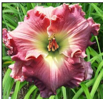
NANCY THOMAS 30",Tet,6",Dor,M,Re BENZ-J. 2010 DISPLAY