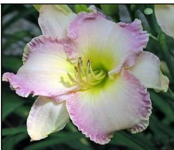
WILLOW DEAN SMITH 36",Tet,6",Dor,ML,Re RICE-J. 2007 $25