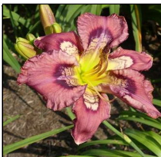
PHARAOH'S ARROWS 40",Tet,7.50",Evr,EM,Re PIERCE-G. 2017 DISPLAY