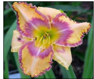
PAINTED EXPRESSIONS 27",Tet,6",Evr,EM,Re HARRY 2010 $25