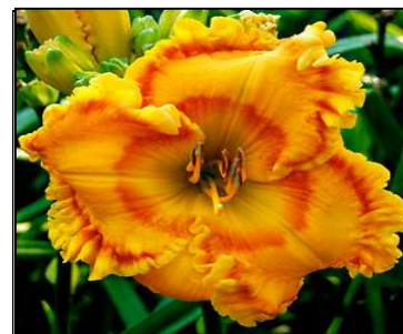
SACHA 32",Tet,6.50",Evr,EM,Frag,Re TRIMMER 2013 $30