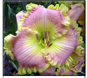
SHAMROCK DELIGHT 26",Tet,5.50",Evr,EE,Re TRIMMER 2007 DISPLAY