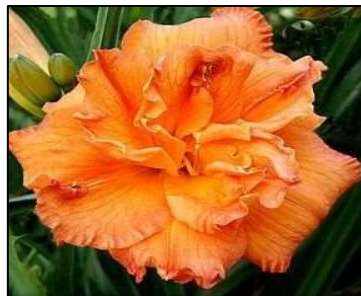
PURSUIT OF PLEASURE 28",Tet,6",Evr,ML,Db,Re KIRCHOFF, D 2008 $30