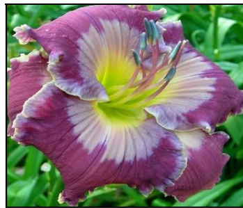
SEAGULL'S HEAVEN 34",Tet,6",SEv,M,Re,Ext SMITH FR 2006 $25