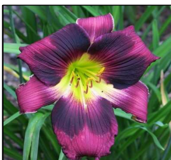
MOUNT HERMAN INTRIGUE 26",Dip,5.50",Dor,E,Frag,Re CARPENTER J 2006 DISPLAY