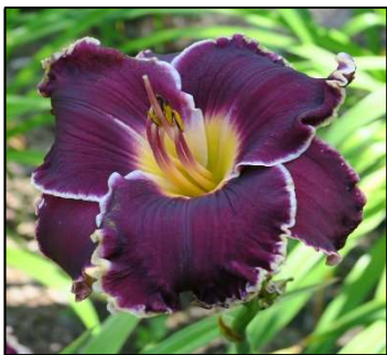
POD KING 36",Tet,6.50",Evr,EM,Frag,Re PIERCE 2015 $40