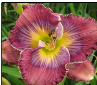
WHAT A RELIEF 32",Tet,4.50",Dor,M,Re RICE-JA 2012 $25