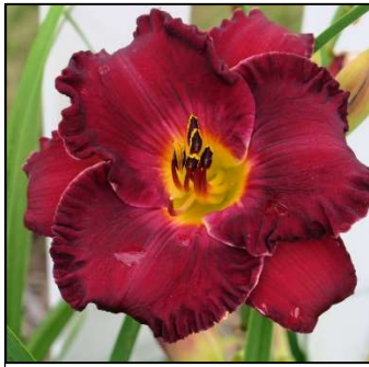
ROSA PARKS 33",Tet,6",SEv,M HANSON C 2006 $25