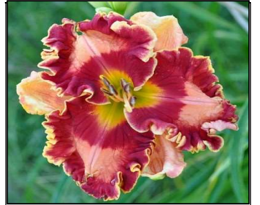
PLAY IT LOUD 26",Tet,6",SEv,EM,Frag DEVITO 2013 DISPLAY