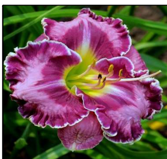
PICASSO'S INTRIGUE 34",Tet,6.25",Evr,E,Frag,Re PIERCE-G. 2013 $35