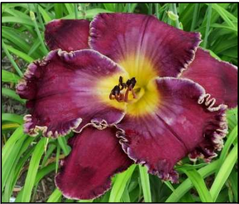
TRIUMPHAL PROCESSION 24",Tet,5",SEv,M,Frag,Re EMMERICH 2009 $30