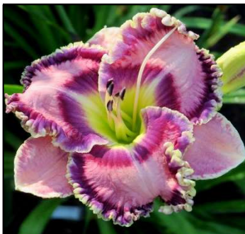
MOVING PICTURES 36",Tet,5.75",Evr,EM,Frag,Re PIERCE-G. 2012 $30