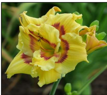
WHIMSICAL WHIRLWIND 27",Tet,3.75",SEv,E,Frag,Db,Re ELLER-N. 2012 $30