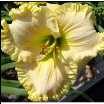
SPECTRAL ELEGANCE 23",Tet,6.50",Evr,EM,Re STAMILE 2002 $20