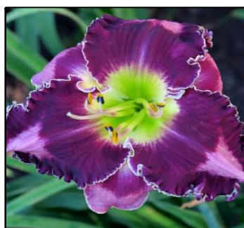
MIDNIGHT AT TIFFANY'S 36",Tet,6.25",Evr,EE,Frag,Re PIERCE-G. 2013 $35