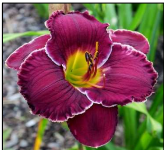
PURPLE SEDUCTION 30",Tet,7",SEv,EM,Re HARRY-P. 2013 $30