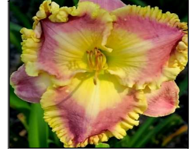
RHONDA FLEMING 29",Tet,7",SEv,M,Re PETIT 2010 $30