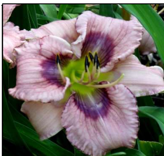
VERTICAL HORIZON 36",Tet,6",Dor,EM,Re MOLDOVAN 2005 $25