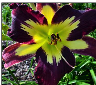
PERPLEXING PLUM 42",Tet,7.50",SEv,EM,Re PIERCE 2019 $75