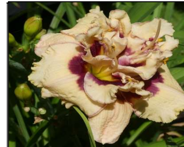
SPACECOAST TWO EYED JACK 24",Tet,6",SEv,EM,Re KINNEBREW J 2006 $25