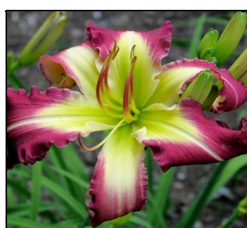
STARRING ATTRACTION 35",Dip,6.50",Dor,M,UFO RICE-JA 2010 $40