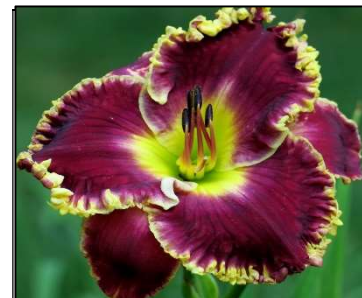
WHEN ROYALS DREAM 37",Tet,6.25",Evr,EM,Re STAMILE-PIERCE 2011 $40