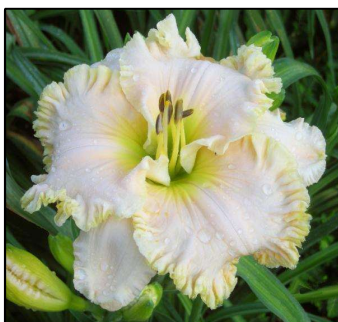
SPACECOAST WHITE CHRISTMAS 32",Tet,7",Evr,E,Frag,Re KENNEBREW-GOSSARD 2015 $35