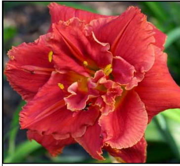
TREVA'S RED LIPSTICK 26",Tet,5.75",SEv,E,Frag,Db,Re ELLER-N 2011 $35