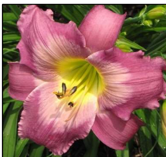
WIZARD'S WAND 34",Tet,6",Dor,M,Re MOLDOVAN-WOODHALL 2011 $20