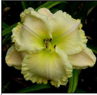
SOLAR SWEET 32",Tet,7.25",Evr,EE,Re PIERCE 2015 $25