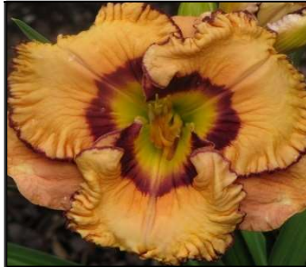
SINGING WITH ANGELS 30",Tet,6",SEv,EM,Re SMITH-FR 2007 $25