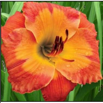
NAVAJO WARRIOR 36",Tet,5",SEv,EM,Frag,Re HANSON-C. 2012 $25