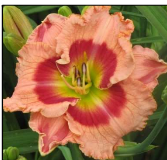
TIL WE MEET AGAIN 32",Tet,6",Dor,M,Re MOLDOVAN-WOODHALL 2011 $20