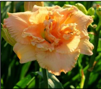
PASSION FRUIT TRUFFLE 28",Tet,6",Evr,M,VFrag, Re,Ext KIRCHHOFF D 2003 $25