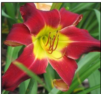
SAILORS TAKE WARNING 34",Tet,7",Dor,M,UFO HOLMES S 2009 $25