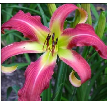
SUPERGIRL 46",Tet,10",Dor,M,Frag,Re, Sp,UFO GOSSARD 2011 DISPLAY