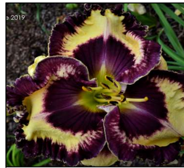
RUGGED RAVEN 35",Tet,7",SEv,EM,Re PIERCE 2018 $80