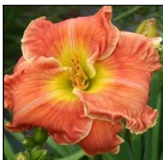
WHISKEY FIRE 40",Tet,7",SEv,ML,Re KIRCHHOFF-D 2010 $30