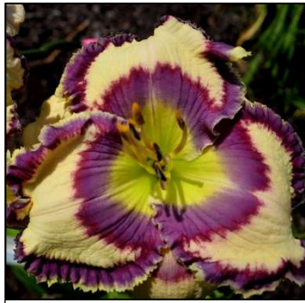
PANDORA'S CHARM 40",Tet,5.75",Evr, EM,Re PIERCE 2016 $70