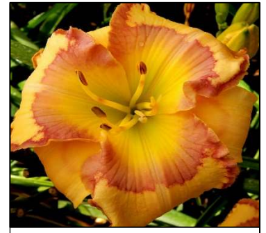
SAVING PARROT RYAN 27",Tet,5.50",Evr,EM,Re TRIMMER 2010 $25