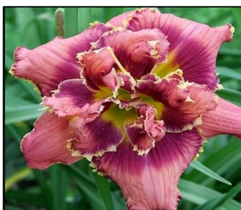
MONTVILLE SWEETIE 18",Tet,6",SEv,M,Db DICKENS, D 2018 $35