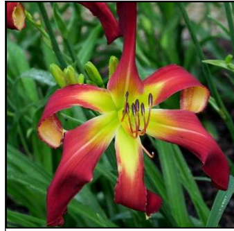
RED WINE ROMANCE 30",Tet,10",Evr,E,UFO KINNEBREW-J. 2008 $25