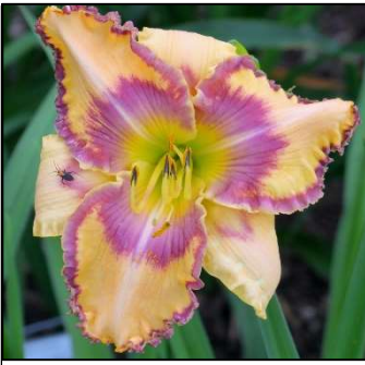
PAINTED PETROGLYPH 30",Tet,6.25",SEv,EM,Re LAMBERTSON 2007 $20