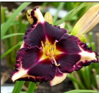
VOODOO MAGIC 32",Tet,6",SEv,EM,Re GRACE-SMITH 2005 $25