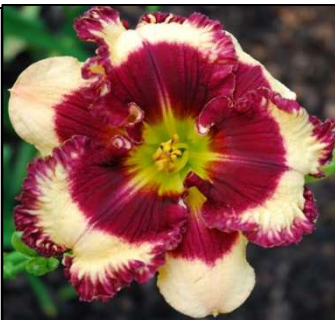
RASPBERRY STITCHING 29",Tet,5",Evr,M,Re STAMILE 2007 $40