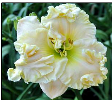
QUEEN'S ENGLISH 32",Tet,6",Evr,E,Re TRIMMER, D 2017 $80