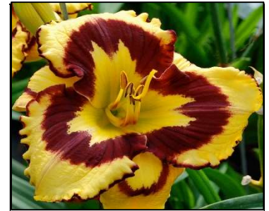
STARBURST FANTASY 26",Tet,5.75",Evr,E,Frag,Re TRIMMER 2012 $40