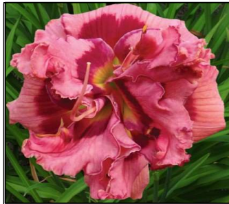
SOUL SEARCHING 34",Tet,6",SEv,M,Db,Re PETIT-GOFF 2014 $50