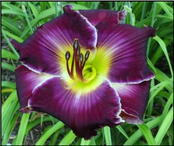
REIGN IN ME 33",Tet,6",Dor,M,Frag,Re KORTH-P.-KORTH-L. 2016 $40