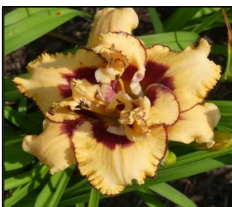
MOMENT OF BREATHLESSNESS 25",Tet,4.50",SEv,EM,Db,Re Hatfield, K. 2020 $50