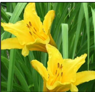
NOTIFY GROUND CREW 72",Tet,5",Dor,M,Frag,Noc HANSON C 2000 $10