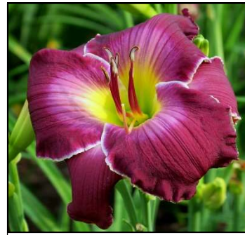
PANGEA 38",Tet,7",Dor,M RICE-JA 2011 $30