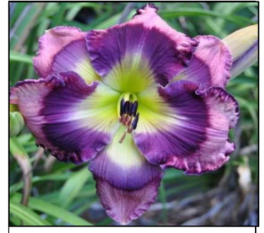
VIOLET VALENTINE 30",Tet,6.50",Evr,EE,Re TRIMMER, D 2015 DISPLAY