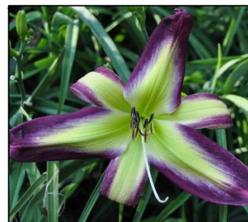
MIDNIGHT HOUR 36",Dip,8.50",Dor,ML,Re HUGHES-TRIMMER 2017 $50