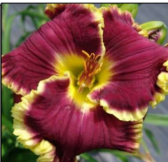
ROYAL NOBILITY 31",Tet,6",SEv,M,Re PETIT 2011 $35