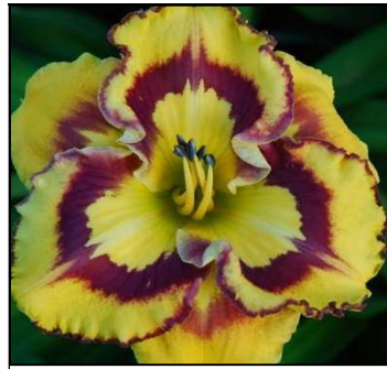
NEW PARADIGM 28",Tet,6.50",SEv,EE,VFrag,Re STAMILE 2008 $35