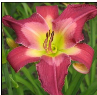
WHITE EYES PINK DRAGON 38",Tet,8.50",Dor,M,Frag, Re,UFO GOSSARD 2006 $20