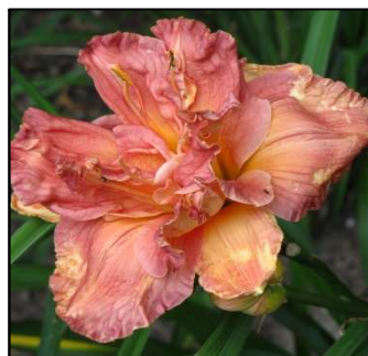
SILOAM DOUBLE CORAL 26",Dip,5.50",Dor,M, Db,Ext HENRY P 1983 $20