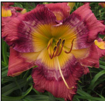
THE POTTER'S TOUCH 30",Tet,6.50",Evr,E,Frag,Re GRACE 2015 $40