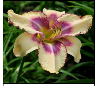
SOME ARE SEEN 32",Tet,5.75",SEv,M,Frag HAEHN 2011 $20