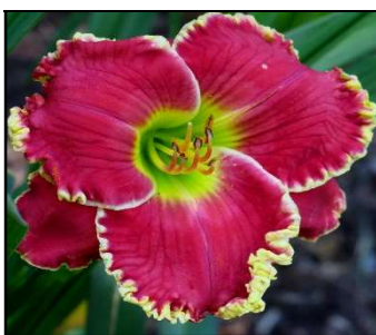
STOP AND STARE 27",Tet,6.50",SEv,EM,Re SMITH-HARRY-P. 2012 $30