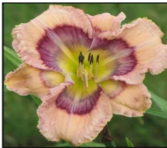
SCREEN PATTERN 26",Tet,5.50",Dor,M STAMILE 2005 $20