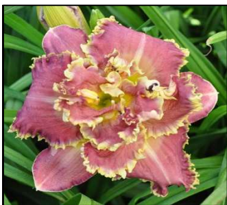
TWICE THE BITE 28",Tet,6",SEv,EM,Db,Re HARRY 2008 $30