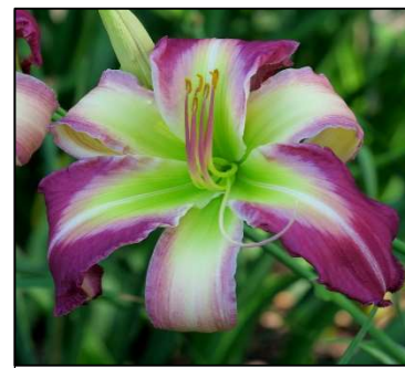
WICKED SUGAR 45",Dip,8",SEv,M,UFO DICKENS, R 2018 $50