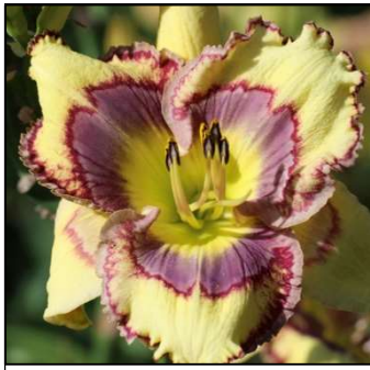
SPELL CATCHER 33",Tet,6",SEv,EM,Frag,Re STAMILE-PIERCE 2012 $30