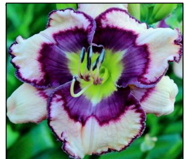
WAVE EFFECT 40",Tet,5.75",Evr,EM,Re PIERCE 2015 $35