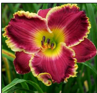
SUNSET STRIP 36",Tet,7.25",Evr,E,Re PIERCE-G. 2012 $30