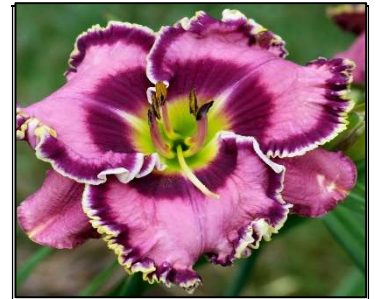
VOLARIS 37",Tet,5.50",Evr,EM,Frag,Re PIERCE-G. 2012 $25