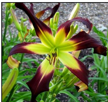
VELVET RIBBONS 44",Tet,11",Evr,EM,Frag,Re,Sp STAMILE 2002 $25