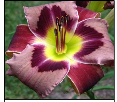
TEDDY BEARS PICNIC 40",Tet,6",SEv,M MOLDOVAN 2005 DISPLAY