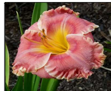
SUGAR LIPS 27",Tet,7",Evr,EM,Re TRIMMER 2017 $35