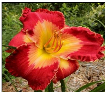
MY SUNNY VALENTINE 28",Tet,6",SEv,M,Re SALTER 2007 $30