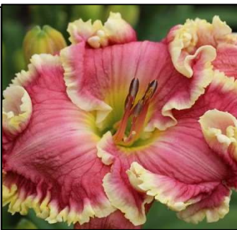
THE BIG PICTURE 29",Tet,7.25",Evr,E,Re PIERCE-G. 2012 $35