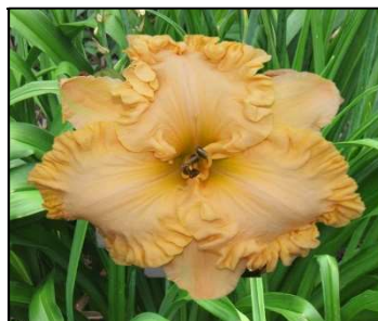
MANGO NECTAR 34",Tet,5.75",Evr,M,Re MARYOTT 2007 $20