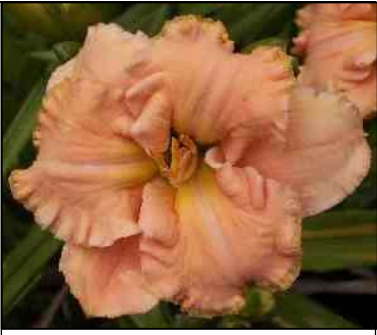
SET THE STYLE 26",Tet,4.25",SEv,EM,Re SALTER E H 2000 $25