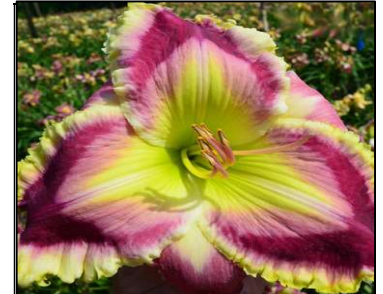
RASPBERRY MINT SORBET 37",Tet,8",Dor,EE,Frag,Re PIERCE 2019 DISPLAY