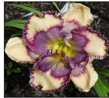
SPACECOAST PERFECT POSE 27",Tet,5.50",Evr,EM,Re GOSSARD, J-KENNEBREW J 2022 DISPLAY