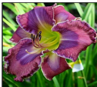
WESTERN RESERVE SONGBIRD 30",Tet,6.50",SEv,EM DICKENS, D 2016 $35