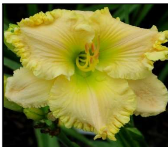
WILLIAM SHAKESPEARE 28",Tet,6.50",SEv,M,Re,Ext SMITH FR 2006 $30