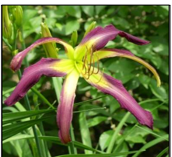
VERTIGO 41",Tet,12",Evr,EM,Re,Sp STAMILE 2007 $20