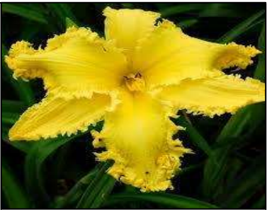
SHATTERED GLASS 28",Tet,6",Dor,M,Re RICE-JA 2010 $25