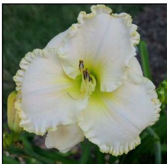
WHITE MOUNTAIN 28",Tet,6",Evr,EM,Re STAMILE 2006 $30