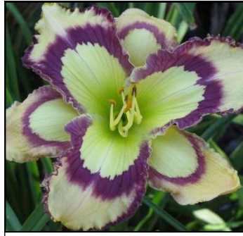
VIOLET STAINED GLASS 36",Tet,6.25",Evr,EM,Frag,Re STAMILE-PIERCE 2010 DISPLAY