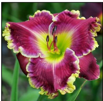
MAZATLAN 45",Tet,6.75",Evr,EM,Frag,Re STAMILE-PIERCE 2011 DISPLAY