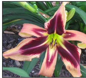
TUSK 40",Tet,12.50",Evr,EM,Re,UFO TRIMMER-J 2008 $25