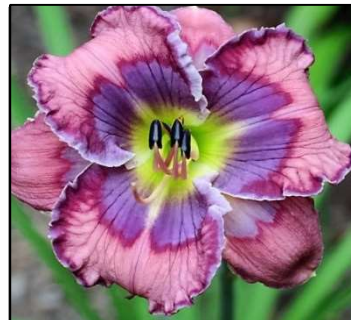
SMILE-N-DALES 55",Tet,5.75",Evr,EM,Re PIERCE 2014 $25