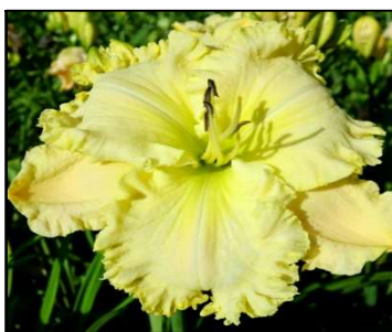
VERDANT SWEET 32",Tet,7.50",Evr,EE,Frag,Re PIERCE-G. 2015 DISPLAY