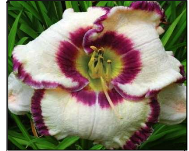
SHOCK APPEAL 24",Tet,6.50",SEv,M, Frag,Re PETIT 2010 $25