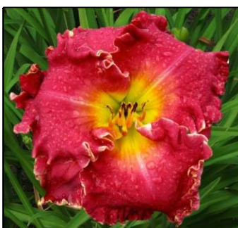
SALVADORE ALLENDE 36",Tet,6",SEv,E HANSON-C. 2016 $30