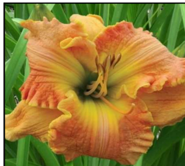
PEACHES EN REGALIA 39",Tet,5",SEv,M,Frag,Re HANSON-C. 2012 $30