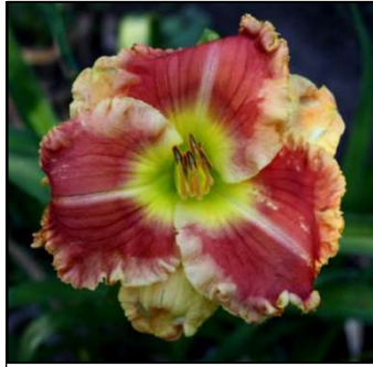
RED WHIMSEY 37",Tet,6.50",SEv,M, VFrag,Re STORY 2011 DISPLAY