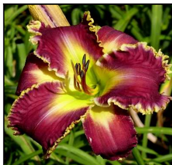
MCJAGGER 38",Tet,7.75",Dor,E,VFrag,Re PIERCE 2019 $75