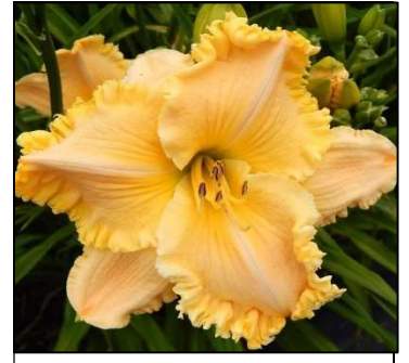
TRIPLE HONEY 34",Tet,6.50",SEv,M,Frag,Re POLSTON 2015 DISPLAY