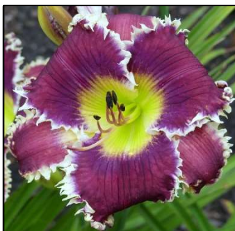
VAMPIRE ROMANCE 32",Tet,7.50",Evr,EM TRIMMER 2015 $40