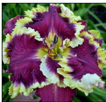
TWO STEPS FORWARD 45",Tet,7.50",Evr,EM,Re PIERCE 2016 $80