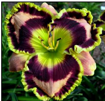
MR HAPPY BOJANGLES 37",Tet,6.25",SEv,EM PIERCE-G. 2015 DISPLAY