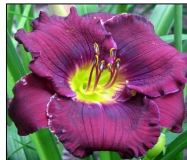
VINO DI TRAVIS 29",Tet,6",Evr,EM,Re MORSS 2010 DISPLAY