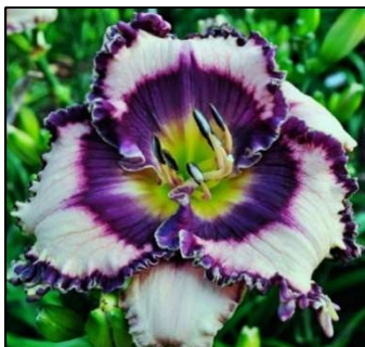
RAZZLE DAZZLE CANDY 36",Tet,5.50",Evr,EM,Re STAMILE-PIERCE 2011 $25