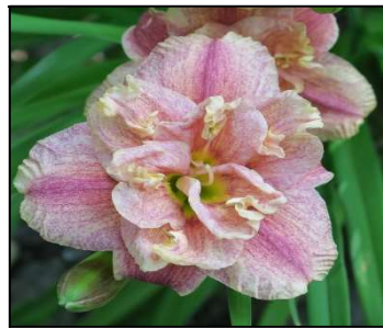
SPOTTED FEVER 22",Dip,3.75",SEv,M,Frag,Db BROWN-OAKES 1995 $20