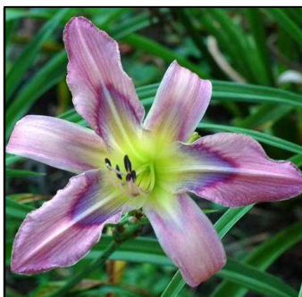
MAGNIFICENT HUMMINGBIRD 27",Tet,7",Evr,E,Re,UFO LAMBERTSON 2004 DISPLAY