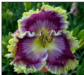
QUOTING HEMINGWAY 40",Tet,7.50",SEv,E,Re PIERCE-G. 2016 DISPLAY