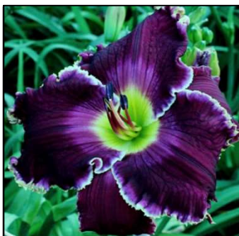
MAX FACTOR 42",Tet,8.25",Evr,EM,Re PIERCE 2015 DISPLAY