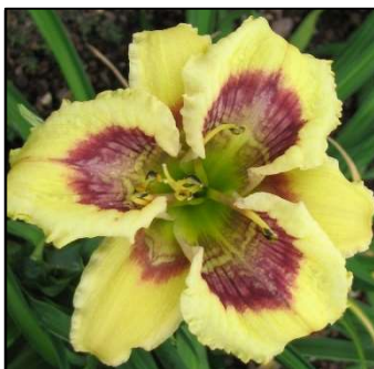
STENCILED di FRESCO 32",Tet,5.50",SEv,EM,Re STAMILE-PIERCE 2012 $35