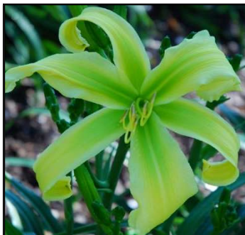
MINT OCTOPUS 32",Tet,8",SEv,EM,Re STAMILE 2008 DISPLAY