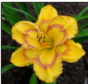
METALLIC APPARITION 33",Tet,70",SEv,EM,Re HARRY P 2013 $40