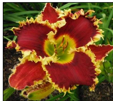
VAMPIRE CLOAK 27",Tet,5",Dor,M,Frag,Re POLSTON 2015 DISPLAY