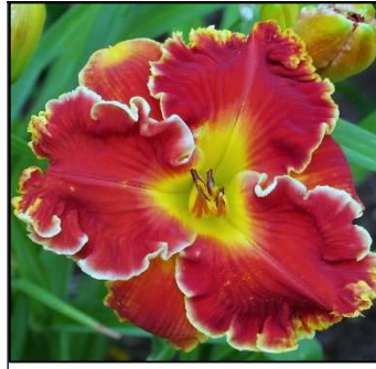
TRIGGER HAPPY 31",Tet,5.75",SEv,E,Frag,Re STAMILE-PIERCE 2011 DISPLAY