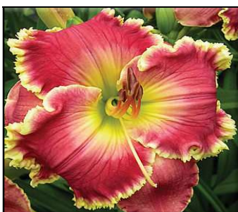
MELISSA BEGNAUD 28",Tet,6",SEv,EM,Re SMITH FR 2008 $30