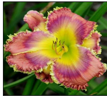
NANCY'S QUILT 23",Tet,5.50",Evr,M,Frag,Re AGIN 2007 $25