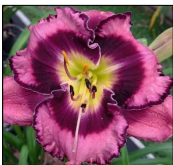
MIDNIGHT AMULET 36",Tet,6",Evr,E,Frag,Re STAMILE 2009 $30