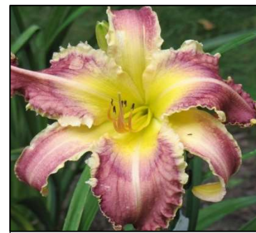
STIPPLED STARSHIP 29",Tet,7",SEv,M,Re,UFO LAMBERTSON 2006 $25