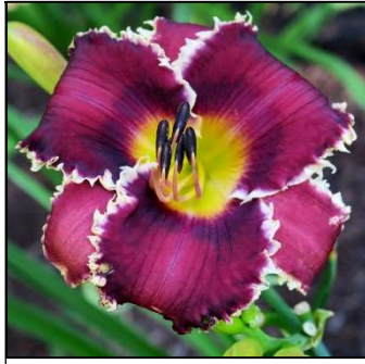
OKLAHOMA SAND BURR 27",Tet,5.50",SEv,EM,Re HOLLEY-S 2009 $25