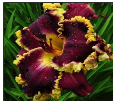
SAN JUAN NIGHTS 39",Tet,6",Evr,EE,Frag,Re PIERCE-G. 2013 $30