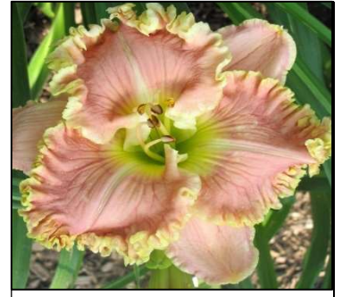
SIMPLY SMASHING 30",Tet,6.50",SEv,EM,Re SALTER 2009 $25