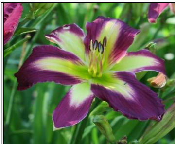
PURPLE SWORDFISH 34",Dip,7",Dor,M,Frag,Re,UFO GOSSARD 2013 $40