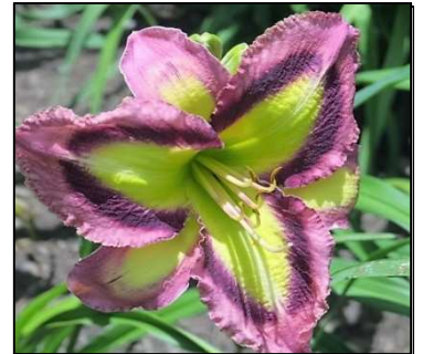
SMILING COBRA 40",Tet,10.75",SEv,EM,Frag,Re PIERCE 2015 $35