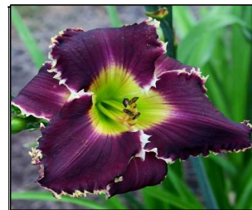
MEN IN BLACK 36",Tet,6",SEv,M,Frag,Re PETIT 2010 $25