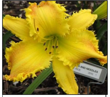
PINS AND NEEDLES 26",Dip,6",Dor,M RICE-JA 2010 $40