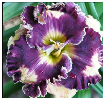
ROCK MY WORLD 25",Tet,6.75",SEv,EM DEVITO 2011 $40