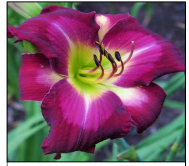
PARADISE BAR AND GRILL 36",Tet,6.50",SEv,M HANSON, C 2008 $25