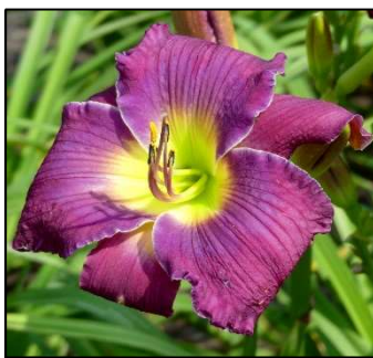
THE DREAM SOCIETY 33",Tet,7",SEv,ML HANSON - C. 2010 $30