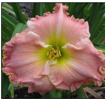
NANCY BILLINGSLEA 30",Tet,7.50",SEv,EE,Re STAMILE 2004 $25