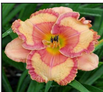
RUSSIAN TEMPLE 26",Tet,5.50",SEv,M,Frag,Re PETIT 2008 $30