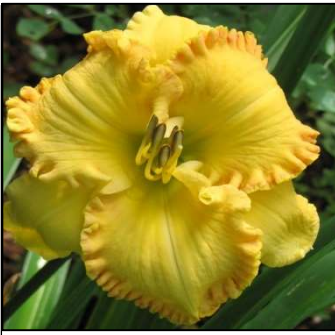
ROMANCING SUMMER 26",Tet,5.50",SEv,EM,Re SALTER 2008 $25