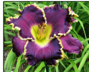
WINE COUNTRY 32",Tet,6.50",SEv,EE,Re PIERCE 2021 DISPLAY