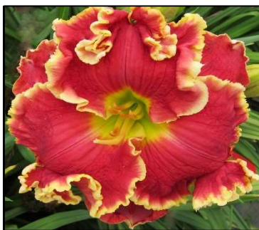
TRUMP THIS 29",Tet,6.50",SEv,EM,Frag,Re HARRY-P. 2017 $60