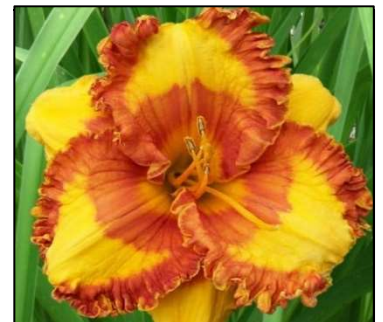
SET MY SOUL AFIRE 22",Tet,5",Evr,EM,Frag,Re BELL-T. 2007 $20