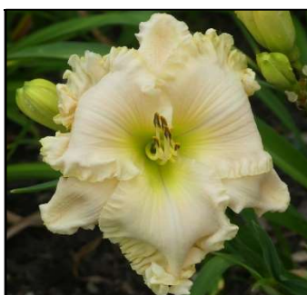
WHITE AMBROSIA 31",Tet,6.25",Evr,EM,Re TRIMMER 2018 $80