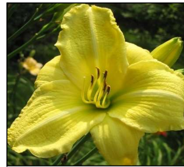
THE SPACE RACE 73",Tet,7",Dor,M HANSON - C. 2010 $25