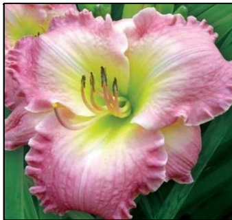
SKY CAPTAIN 50",Tet,5.50",SEv,ML HANSON C 2009 $25