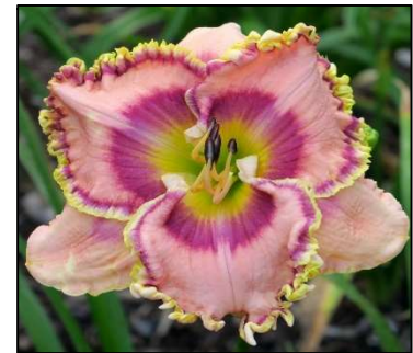
ROLLERCOASTER RUSH 44",Tet,6.50",Evr,EM,Re PIERCE-G. 2012 $30