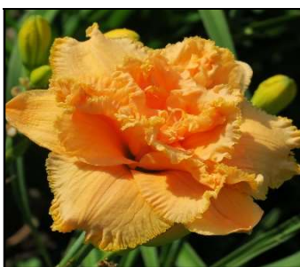
VERA MCFARLAND MEMORIAL 24",Tet,5.75",SEv,EM,Db,Re KINNEBREW-J 2010 $25