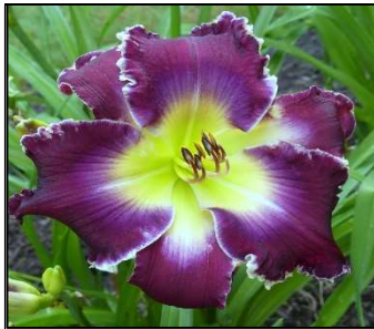
TERRIBLE SWIFT SWORD 20",Tet,7",SEv,M,Frag,Re EMMERICH 2012 $30