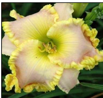
SERENITY BAY 26",Tet,6",SEv,M,Re SALTER 2008 $25