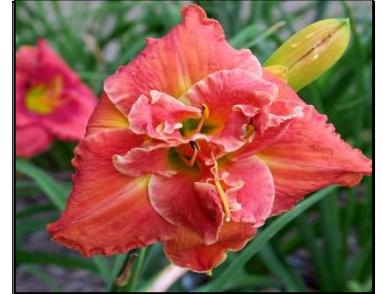
SIZZLING KISSES 40",Tet,6.50",SEv,E,Frag,Db,Re ELLER-N. 2010 $30