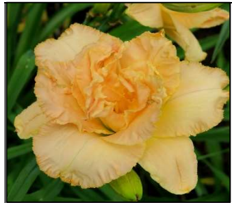
SHERLEY CHANNING 30",Tet,6.25",Evr,M,VFrag, Db,Re KIRCHHOFF-D. 2008 $25