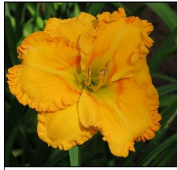
SPICE MARKET 38",Tet,7",Evr,EE,Re TRIMMER, D 2017 $40