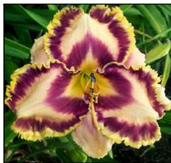
SIGN LANGUAGE 32",Tet,6",Evr,M,Re MARYOTT 2013 $25