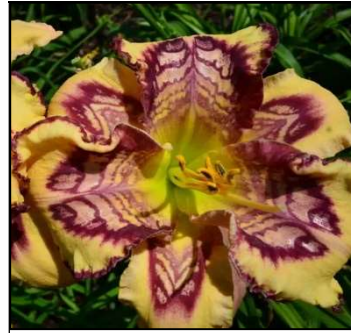
SIMPLY RIVITING 30",Tet,6.75",Evr,EM,Re PIERCE, G. 2022 DISPLAY