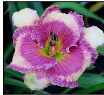
MISSISSIPPI MUSIC MAN 30",Tet,6",Evr,M,Frag SALTER 2009 $25