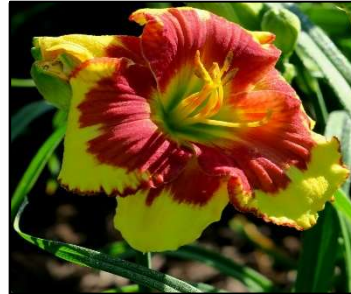
SIR FRANCIS DRAKE 32",Tet,6.50",Evr,M,Re STAMILE 2008 $25