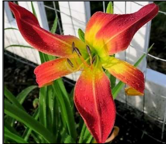
REV IT UP 38",Tet,10.50",SEv,ML,Frag DAVISSON-J. 2008 $25