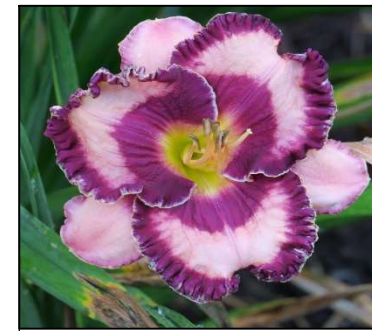
WRITTEN ON THE WIND 25",Tet,6",SEv,M,Frag,Re PETIT 2006 $25