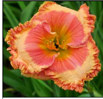
OPPORTUNITY KNOCKS 42",Tet,6.75",Evr,EE,Re PIERCE 2016 $50