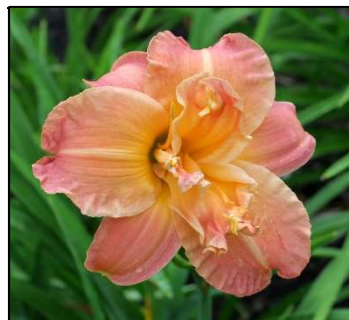
REALITY CHALLENGED 34",Tet,6.25",SEv,E,Frag, Db,Re ELLER N 2009 $25