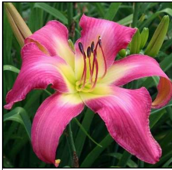
NEON FLAMINGO 35",Tet,8.50",Dor,M,Frag GOSSARD 2006 $30