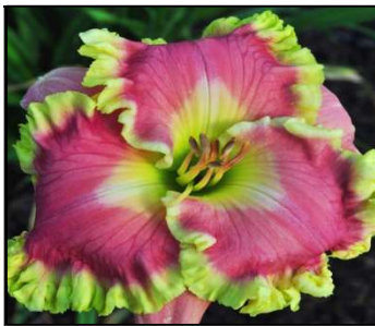
VIVACIOUS SPIRIT 35",Tet,6.50",Evr,EM,Frag,Re PIERCE-G 2011 $30