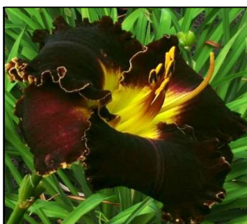
VICTORIAN GARDEN STAR BRIGHT 34",Tet,6.50",SEv,M,Re BROOKER-G 2007 $35