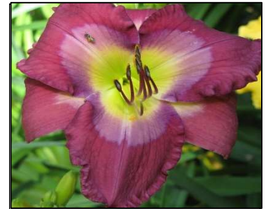
NORTHERN KINGFISHER 33",Tet,6",SEv,M,Frag HANSON C 2004 $20