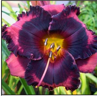
TANGO LESSONS 26",Tet,5",Evr,M,Frag,Re TRIMMER 2012 $60