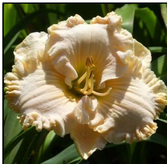
WEDDING GOWN 28",Tet,6",SEv,M,Re SMITH-FR 2007 DISPLAY