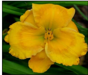
OUT OF FOCUS 30",Tet,7",SEv,E,Re HARRY P 2015 $40