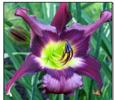
RAE'S ABRACADABRA 40",Tet,6.50",Dor,M,UFO DICKENS, R 2014 $25