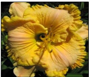
TWO FOR THE SHOW 28",Tet,6",SEv,EM,VFrag,Re,Ext BUNTYN 2006 DISPLAY