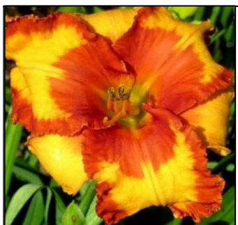
SPACECOAST FIESTA GRANDE 24",Tet,6",SEv,E,Re KINNEBREW-J. 2010 DISPLAY