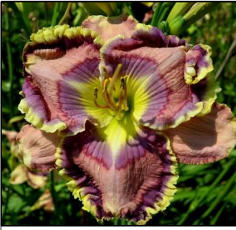
OH THANK HEAVEN 44",Tet,6",Evr,M,Re PIERCE 2016 DISPLAY