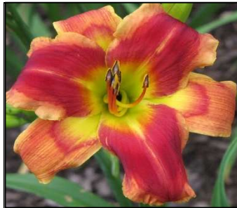
PASSION'S PROMISE 28",Tet,5",SEv,ML SAYERS 1999 $20