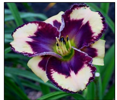
OCEAN WILD 29",Tet,5.50",SEv,M,Re PETIT 2013 $30