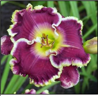
VIOLET LIGHT 34",Tet,5.75",Evr,EM,Frag,Re STAMILE-PIERCE 2010 $30