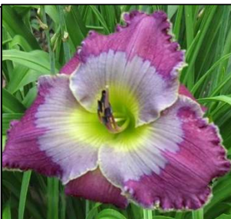
PAUL AUCOIN 29",Tet,6",Evr,M,Frag,Re AGIN 2009 $30