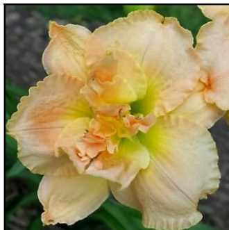
WEDDING CANDY TRUFFLE 29",Tet,6.75",SEv,EM, VFrag,Db, Re,Ext KIRCHHOFF D 2002 $20