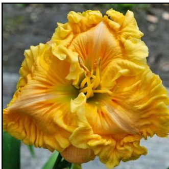
TUSCAN SUMMER 29",Tet,6",Evr,M,Frag,Re TRIMMER 2011 $25