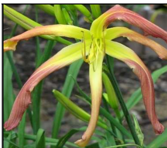
THE TINGLER 47",Dip,9",Dor,M,Re,UFO BACHMAN 2002 $25