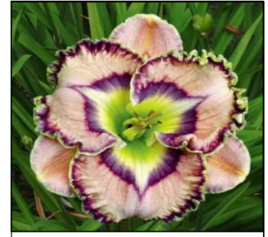
REGGIE MORGAN 27",Tet,6",Dor,M,Re PETIT 2008 DISPLAY