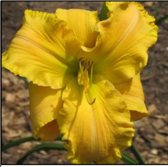
TALL BLONDE 36",Tet,9",SEv,ML HANSON-C. 2008 $30