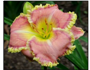
SECRET FAMILY RECIPE 30",Tet,7",SEv,M,Frag,Re SHOOTER-F. 2012 $25