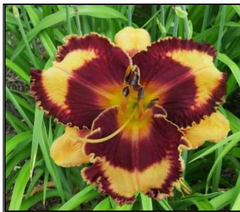
NO HOLDING BACK 36",Tet,7",SEv,EM,Re HARRY 2014 DISPLAY