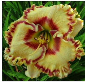
SASSY SADIE 22",Tet,5.50",Evr,M,Frag,Re BELL-T. 2012 $30