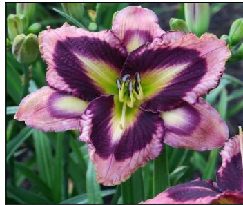
PIRATE'S PRISM 37",Tet,7",Evr,E,Re STAMILE-PIERCE 2011 $35