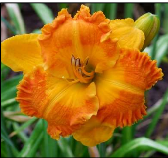
OVER HEATED 28",Tet,6.25",Evr,EM,Frag,Re GRACE-L. 2010 $25