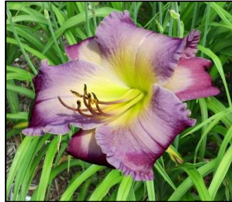
RHAPSODY IN THE RAIN 36",Tet,50",SEv,M,Re HANSON, C. 2019 DISPLAY