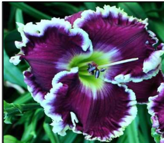
RANDALL LANIER BARRON 34",Tet,6.50",Evr,EM PIERCE 2015 $60