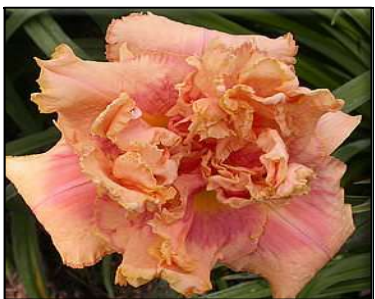
TUTTI FRUITI TRUFFLE 30",Tet,6.50",Evr,VL,Db KIRCHHOFF-D. 2007 $25