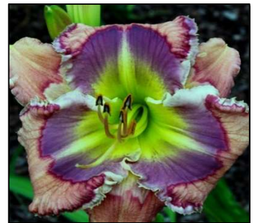
SILVER LIGHTNING 41",Tet,5.75",SEv,EM,Re PIERCE 2014 DISPLAY