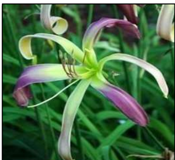
MORPHO'S DANCE 37",Tet,11",Evr,E,Re,Sp STAMILE 2007 $30