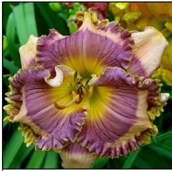
SAPPHIRE SUMMER 34",Tet,6",Evr,M,Frag,Re TRIMMER 2013 DISPLAY