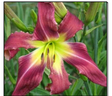
TURN TURN TURN 28",Tet,9",SEv,EM,Re,UFO LAMBERTSON 2003 $15