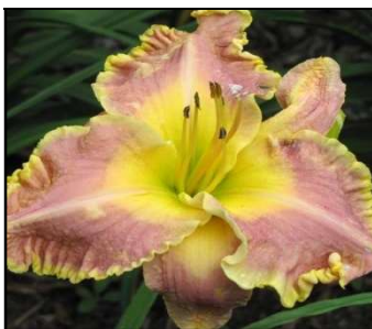
THE TERMINATOR 32",Tet,7.50",Evr,M,Re STAMILE 2006 $30