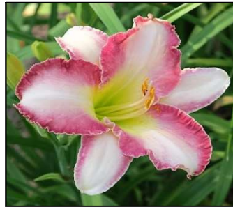
SHE'S GOT THE LOOK 28",Tet,5.25",Evr,M HANSEN-D. 2008 $25