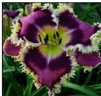
TUMBLEWEED 34",Tet,6.75",Evr,E PIERCE, G 2019 DISPLAY