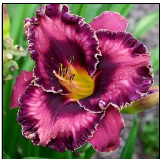
QUEEN'S CIRCLE 26",Tet,5",Evr,EM,Re MITCHELL K 2005 $20