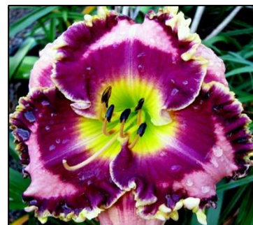
MOUNTAIN WILDFLOWER 28",Tet,5.50",Dor,M STAMILE 2008 $30