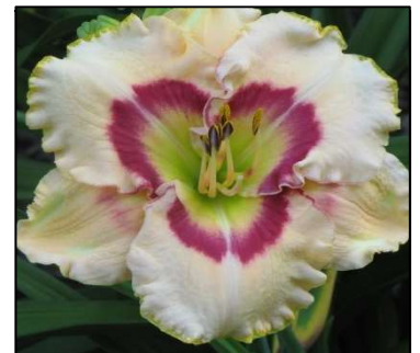
RUBY LIPSTICK 30",Tet,6",Dor,M,Frag,Re BENZ J 2006 $30