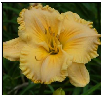
NADINE'S DREAM 36",Tet,6",SEv,M RICE-JA 2010 $25