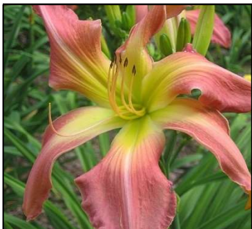
WEBSTER'S PINK WONDER 34",Tet,13",SEv,M,UFO WEBSTER-COBB 2003 $25