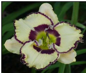
YOUR PLACE OR MINE 33",Tet,6.25",SEv,EM,Re HARRY-P. 2012 $25