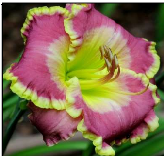
WIZARD OF AWE 30",Tet,6.50",SEv,EM,Re PIERCE, G. 2017 DISPLAY