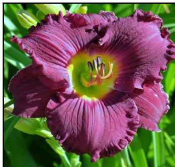
RUFFLED BLUE HAZE 29",Tet,5.75",SEv,EM,Re,Ext BUNTYN 2006 $20