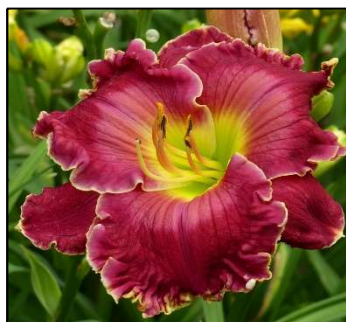
WATERMELON RED 32",Tet,7.25",Evr,M,Re STAMILE-PIERCE 2009 DISPLAY