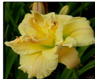
MOONSTRUCK TRUFFLE 30",Tet,6",Evr,L,Frag,Re,Ext KIRCHHOFF-D. 2011 $30