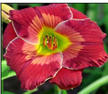
STUDS TERKEL 33",Tet,5",SEv,ML HANSON C 2009 $15