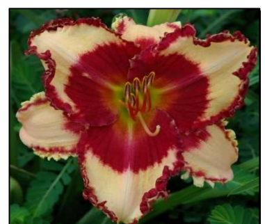
STELLAR STITCHERY 32",Tet,6",Evr,M,Re SALTER 2014 $40