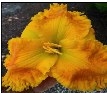
THE WHOLE NINE YARDS 32",Tet,9",SEv,EM,Re PIERCE 2021 DISPLAY