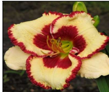
RASPBERRIES IN CREAM 27",Tet,5",Evr,EM,Re STAMILE 2004 $35