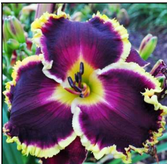
MIDNIGHT IN PARIS 42",Tet,6.50",SEv,EM,Re STAMILE-PIERCE 2012 DISPLAY