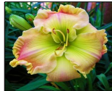
THELMA PRATTS 22",Tet,6",Evr,L,Re CARPENTER 2017 DISPLAY