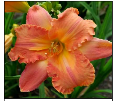
RAINBOW MESA 26",Tet,6",SEv,M HANSON-C. 2007 $30