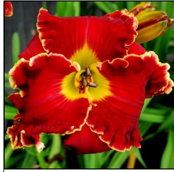
SHAKESPEARE'S RED 31",Tet,6.75",Evr,E TRIMMER 2014 $75