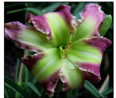
THE GREEN HAMMER 28",Tet,9.50",Dor,EE,VFrag PIERCE, G 2017 DISPLAY