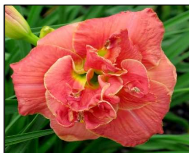
PETAL PUSHER 34",Tet,6.50",SEv,M,Frag,Db,Re PETIT 2008 $30