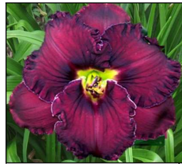
PURPLE PASHMINA 30",Tet,5.50",Evr,M,Re,Ext MARYOTT 2011 DISPLAY