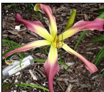
STRINGBEAN 36",Tet,11",Evr,E,Sp STAMILE 2005 $25