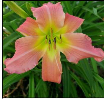
PINK TITAN 38",Tet,9",Dor,M,Frag,Re GOSSARD 2009 $15