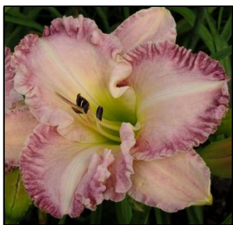
PACIFIC COAST 33",Tet,6",SEv,M,Re TRIMMER 2007 $20