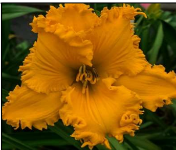
SPACECOAST THOR'S HAMMER 32",Tet,8",Evr,M,VFrag,Re KINNEBREW-GOSSARD 2018 DISPLAY