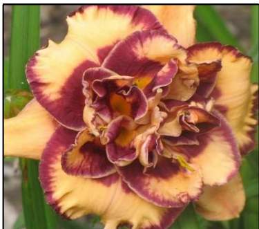
TURNING UP THE HEAT 22",Tet,5",SEv,M,Frag,Re PETIT 2006 $20