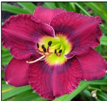
MIDNIGHT IN MOSCOW 28",Tet,5.50",SEv,M,Re MOLDOVAN 2008 $20