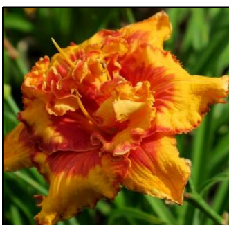
UPBEAT 34",Tet,6.50",Dor,ML,Db PETIT-GOFF 2016 $60