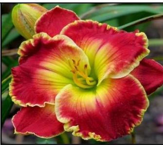
SCARLET BLAZE 30",Tet,6.50",SEv,EM,Frag HARRY-P. 2011 $25