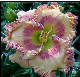
SENSE OF WONDER 24",Tet,5.50",Evr,E TRIMMER 2005 DISPLAY