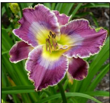
VEIL OF SECRECY 32",Tet,5.50",Dor,M RICE - JA. 2010 $25