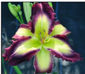
MAMA KNOWS BEST 30",Tet,7.50",SEv,EM,Re TRIMMER, D 2017 $50