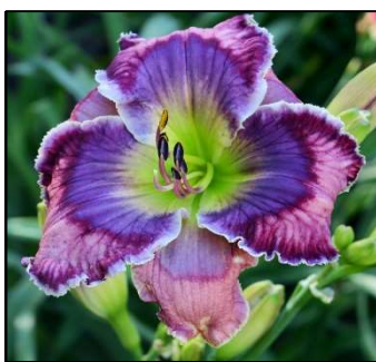
OCEAN LOTUS 42",Tet,6.75",Evr,EM,Re PIERCE-G. 2015 $50