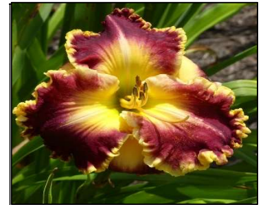
ROYAL GILDED MAJESTY 23",Tet,6.50",Evr,M,Frag,Re CARPENTER-J. 2008 $25