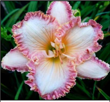
SNOW PRINCE 26",Tet,5.50",Evr,M,Frag,Re TRIMMER 2013 $35