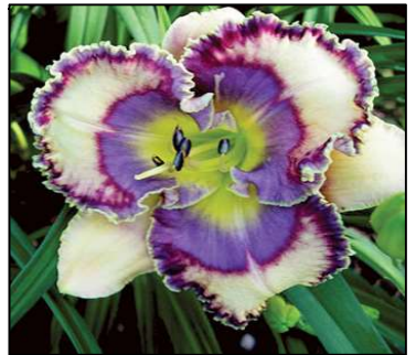
PONY POWER 28",Tet,5",SEv,E,Re HARRY-P. 2013 $25