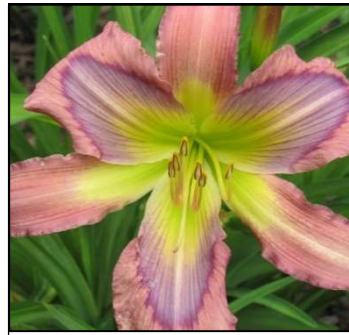
RAINBOW MAKER 38",Dip,9.50",Dor,M,Frag, Re,UFO GOSSARD 2011 $20