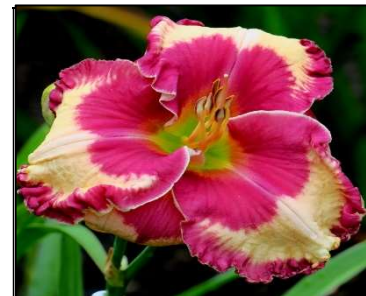
MARILYN MONROE 33",Tet,6.25",Evr,E,Frag,Re PIERCE-G. 2013 $50