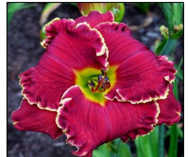
RED BULL 43",Tet,6.50",Evr,EM,Re STAMILE-PIERCE 2012 DISPLAY