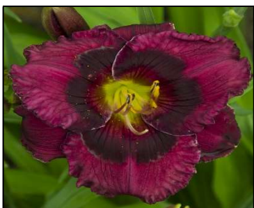
WESTERN RESERVE QUIET NIGHT 29",Tet,5.50",SEv,EM DICKENS, D 2016 $25