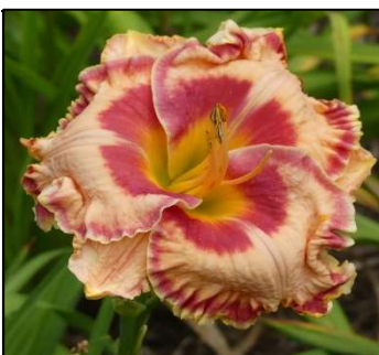
SPANISH FIESTA 32",Tet,6.50",Evr,EM,Re TRIMMER 2006 $25