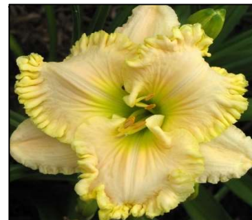
WONDER OF IT ALL 27",Tet,5.75",Dor,E,Re CARR 2005 $20