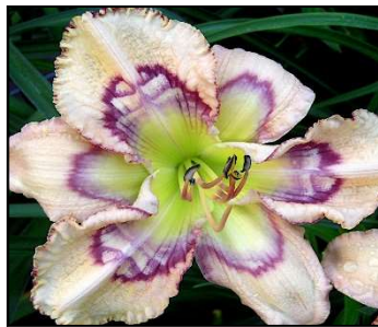
VIVID VIBRATIONS 29",Tet,70",Evr,M,Re TRIMMER 2014 $30