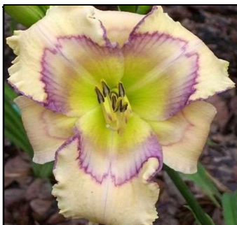
MARSEILLES WATERCOLOR 31",Tet,5.25",Evr,EE,Re STAMILE 2007 $25