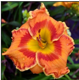
PUMPKIN TOWN 33",Tet,6",Evr,M,Re TRIMMER 2017 $40