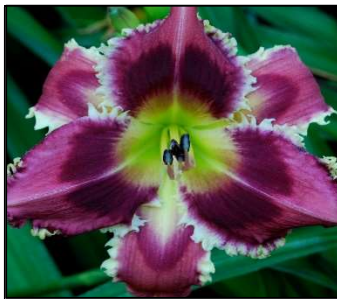
SPOOKY TOOTH 27",Tet,6",Evr,EM TRIMMER 2014 $40