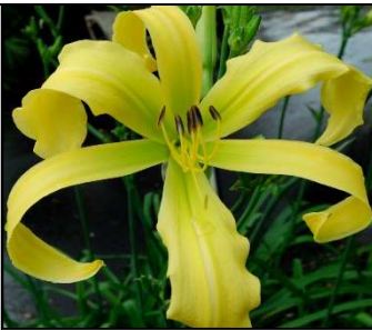
TEN FEET TALL 55",Tet,11.50",Evr,E,Re,UFO TRIMMER 2014 $20