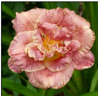
WORD OF HONOR 28",Tet,5.50",Evr,ML,Db,Re JOINER 2003 $25