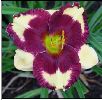
SIMPLY LEAVES ME BREATHLESS 28",Tet,8",SEv,EM,Re HARRY-P. 2012 $40