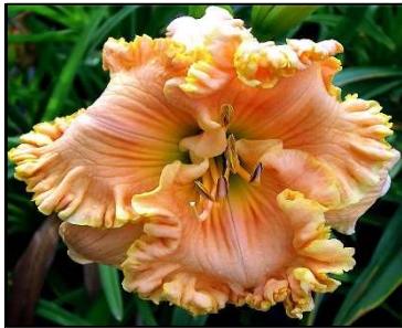
TROPICAL HOT FLASH 30",Tet,6",Evr,M TRIMMER 2008 $25