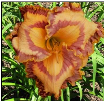
THE HEATHEN RAGE 22",Tet,5",Evr,EM,Frag,Re BELL-T. 2012 $30