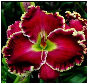
RUBY RIDGE 30",Tet,6.50",Evr,EM,Frag,Re STAMILE-PIERCE 2010 $40