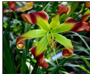
TWIST AND SPIN 50",Tet,7",Evr,EM,Frag,Re, UFO STAMILE 2008 $30