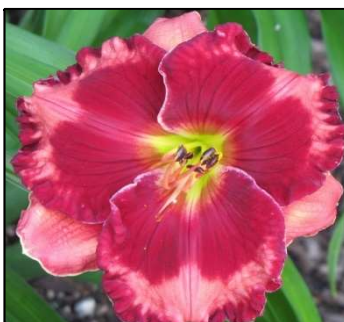
WALTER KENNEDY 28",Tet,5.75",Evr,M,Re STAMILE 2008 $25