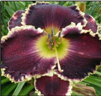
SKIN OF MY TEETH 26",Tet,6",SEv,M,Frag,Re EMMERICH 2011 $50