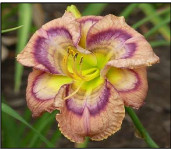
VIVA LAS VEGAS 42",Tet,6",Evr,EM PIERCE 2014 $25