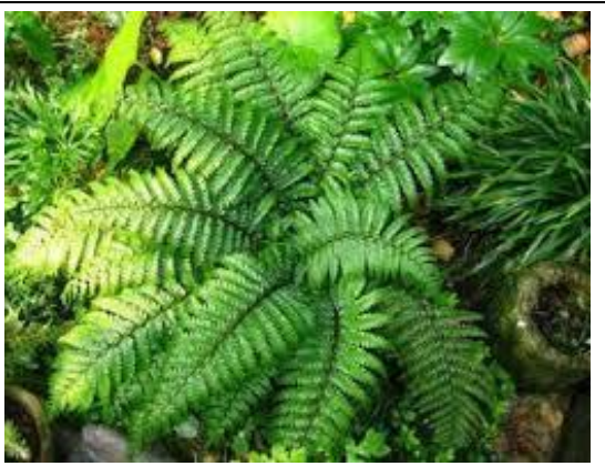
Shiny Bristle Fern, Arachnoides davalliaeformis Semi-evergreen

Height: 18-24 inches perennial (space 24 inches apart for full ground cover)