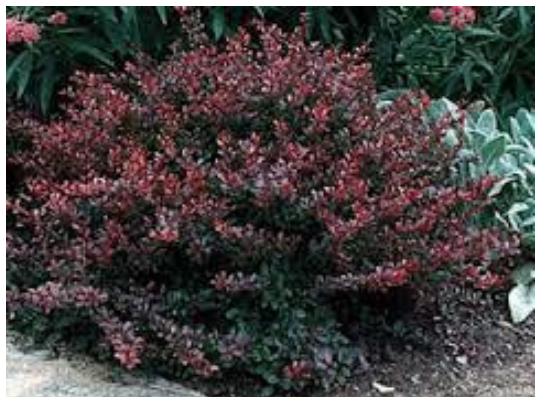
Japanese Barberry, Berberis thunbergii 'Crimson Pygmy' Deciduous

Height: 5-6 feet flowering deciduous shrub Plant in full sun to partial shade Blooms in early through mid-summer Color: huge blooms emerge creamy-white and age to a vivid dark pink/red (good for drying) Needs well drained but moist soil Blooms on old wood so if needed, prune just after flowering Attracts butterflies and bees Native hybrid Large 3-gallon plant