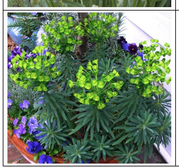
Spurge Eurphorbia wulfinii 'Shorty' Evergreen

This cultivar was born and bred in Lumpkin County