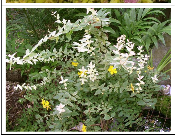
St. John's Wort, Hypericum patulum 'Stardust' Semi-evergreen

Height: 2-3 feet flowering semi-evergreen shrub