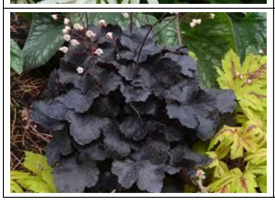
Coral Bells, Heuchera 'Blackout' Semi-evergreen

Height: 9 inches semi-evergreen perennial Plant in partial sun for darkest leaf color, in well