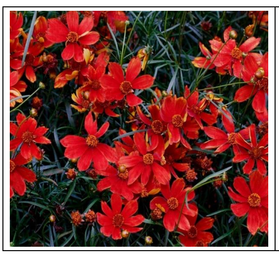
Tickseed, Coreopsis verticillata 'Broad Street'