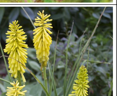
Red Hot Poker, Kniphofia 'Echo Yellow' Evergreen

orchid pink, unusual mixture Provides early nectar for bees Deer resistant Drought tolerant