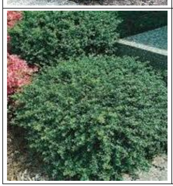
Japanese Holly, Ilex crenata 'Soft Touch' Evergreen

Height: 2-3 feet evergreen shrub Plant in full sun to partial shade