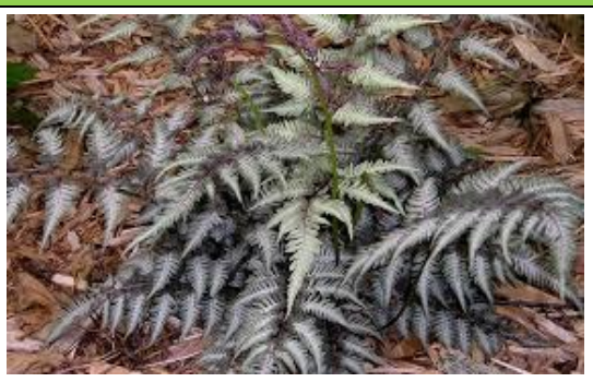
Japanese Painted Fern. Athyrium niponicum 'Pictum'

Height: 18 inches perennial (space 18 inches apart for full ground cover)