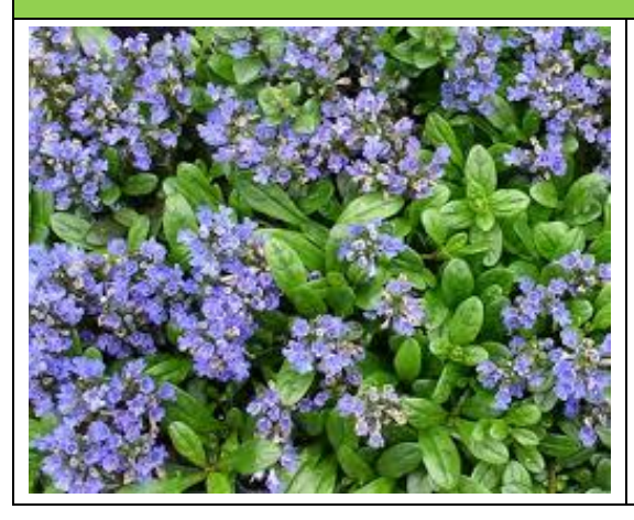
Bugle Weed, Ajuga 'Mint Chip' Evergreen

Height: 4 inches, with 9 inch spread evergreen perennial