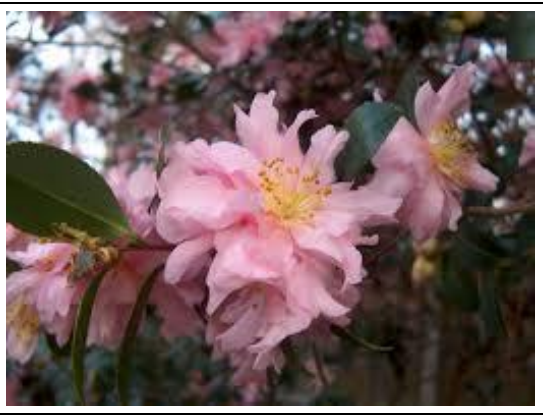
Camellia, fall Camellia sasanqua 'Pink Snow' Evergreen

First available in nurseries in spring 2019!