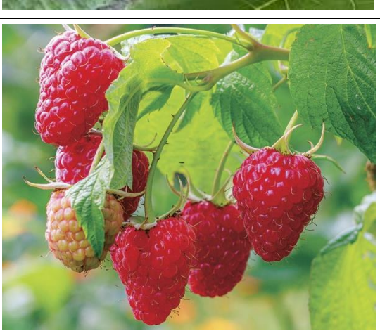
Raspberry, Rubus idaeus 'Caroline'

Birds are attracted to the fruit, leaves deer resistant Big 3 gallon plant