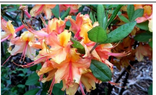
Azalea, native, Rhododendron x 'Tallulah Sunrise' Deciduous

Color: dark green toothed leaves speckled with gold, no obvious flowers but females will set red berries Wonderful to brighten a dark spot, loves acid soil Deer resistant