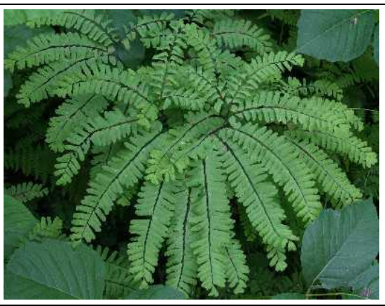
Maidenhair Fern, Adiantum pedatum (Northern Maidenhair)

Height: 12-18 inches perennial fern (space 18 inches apart for full ground cover) Finely-textured, frilly curved fronds on attractive wiry black stems.