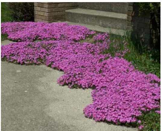
Thrift, Creeping Phlox Phlox subulata 'Old Time Magenta' Evergreen

Height: 6 inches, with 24 inch spread evergreen perennial