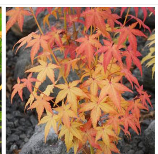
Close up of 'Bihou' fall leaf color