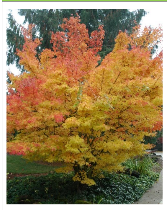
Acer palmatum 'Bihou' in its fall color

Dwarf Japanese Maple, Acer palmatum 'Bihou'