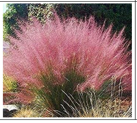
Pink Muhly Grass, Muhlenbergia capillaris 'Pink Muhly'

This is another cultivar born and bred in Lumpkin County