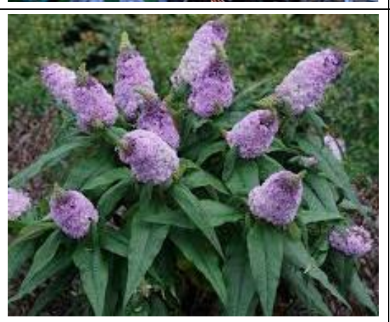
Butterfly Bush, dwarf Buddleia Pugster® 'Amethyst' Deciduous