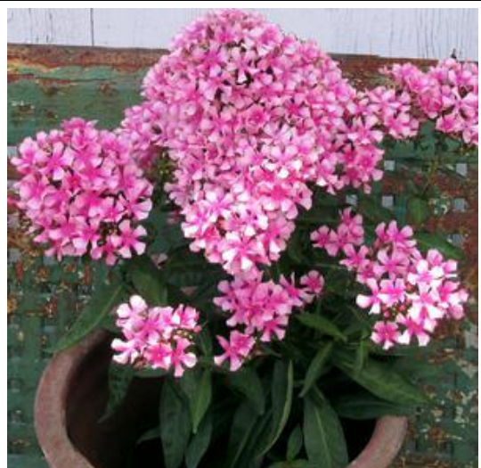
Phlox, dwarf Phlox paniculata 'Maiden America™'

NOTE: each plant will have only one flower color.