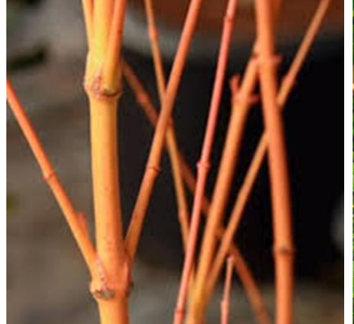
Showing off its golden coral and yellow colored bark in winter

The name 'Bihou' means "beautiful mountain range" in Japanese, and it's an apt name for this gorgeous specimen. This charming Japanese Maple features chartreuse green leaves in spring which deepen throughout summer and glow against its golden yellow summer bark. Autumn sees this tree burn with amber/orange foliage. Finally, once the leaves have fallen, in winter the golden coral and yellow bark shines like a beacon, and adds life to the cold and quiet winter season. It's a perfect specimen tree for your landscape!