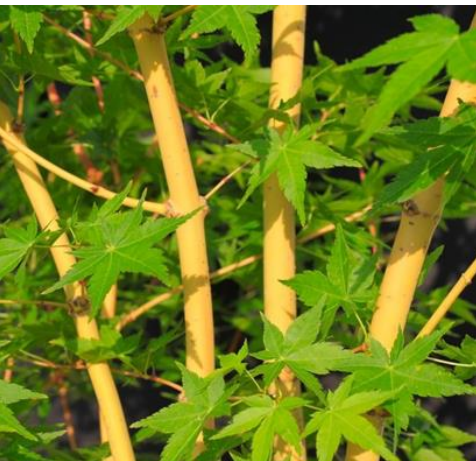
'Bihou' in summer with its golden yellow bark against the bright green leaves