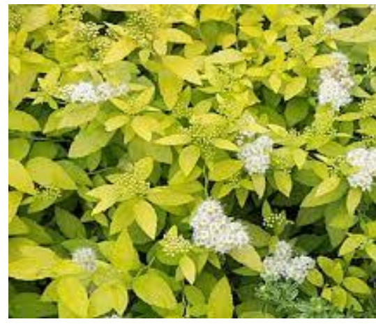
Spirea, dwarf, S. japonica 'White Gold' Deciduous

Height: 15 feet tall, 12 feet wide semi-evergreen