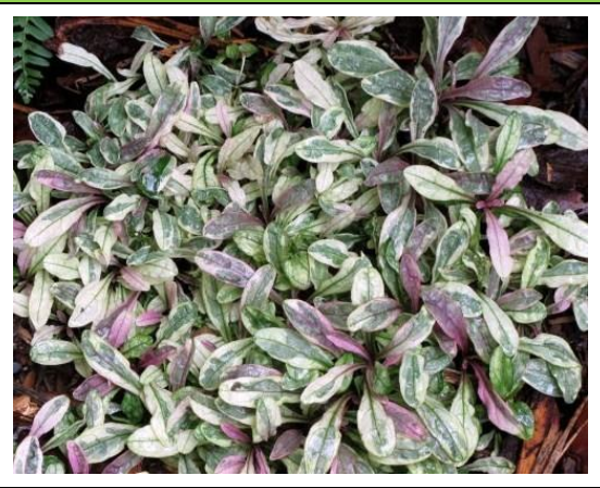
Bugle Weed, Ajuga 'Dixie Chip' Evergreen

Height: 4 inches, with 9 inch spread evergreen perennial groundcover