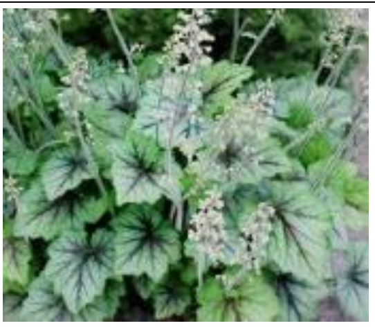
Foamy Bells, Heucherella 'Blue Ridge' Semi-evergreen

Height: 1-1/2 foot tall and wide semi-evergreen perennial