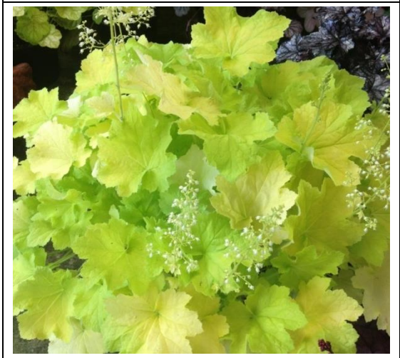
Coral Bells, Heuchera villosa 'Citronelle' Semi-evergreen

This cultivar was born and bred in Lumpkin County