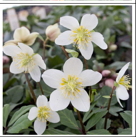
Lenten Rose, Helleborus niger 'Jacob' Evergreen

Wait until new growth begins again in spring to cut back after winter to protect the crown Mulch over winter will ensure winter survival Deer resistant, drought tolerant, generally pest free