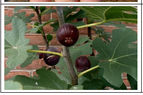
Fig, Ficus carica 'Chicago Hardy'

NOTE: One of the most important growing requirements of rabbiteye blueberries is their need for cross-pollination to set fruit. You must have more than one variety for a good crop.