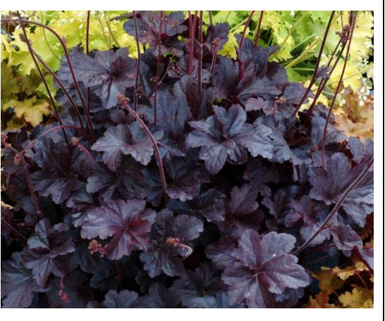
Coral Bells, Heuchera villosa 'Obsidian' Semi-evergreen

Height: 1-2 feet tall and wide semi-evergreen perennial