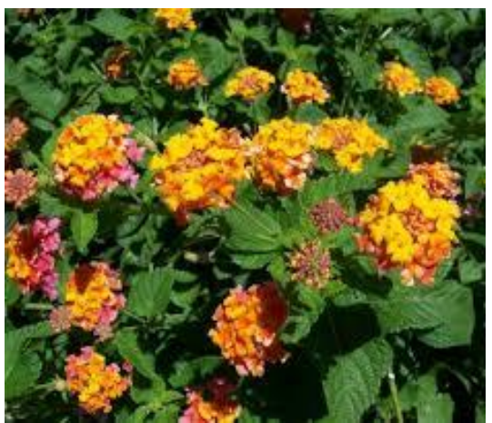
Lantana, Lantana camara 'Miss Huff'

Height: 1 foot tall and wide evergreen perennial Plant in part sun (with afternoon shade to prevent leaf scorch) in well drained but moist soil Blooms late spring through mid-summer Color: shocking bright yellow/green leaves with star shaped red center, with showy white flower spikes Attracts butterflies and hummingbirds Humidity and drought tolerant Deer resistant