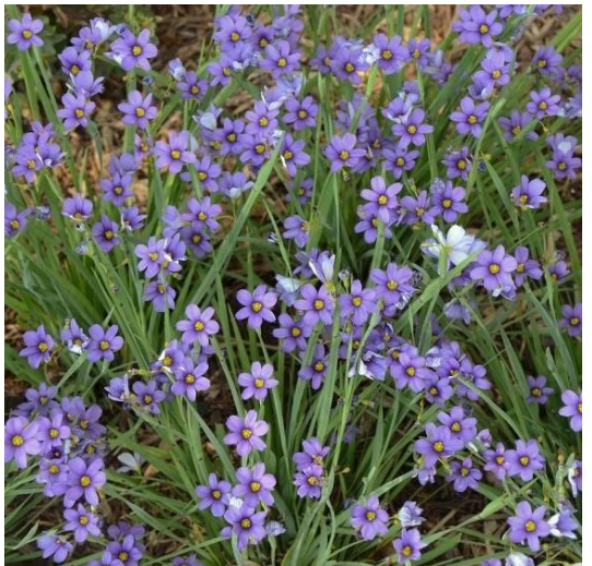
Blue Eyed Grass, Sisyrinchium angustifolium 'Lucern' Semi-Evergreen

Hummingbird and pollinator magnet Deer resistant, drought tolerant