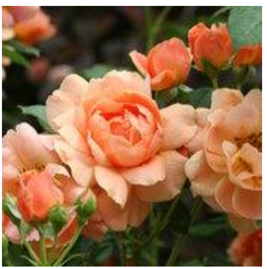
Rose, Rosa x 'At Last®' Deciduous

Color: coral apricot double flowers Blooms on old wood, so avoid heavy pruning Edible small yellow fruit attracts birds and wildlife, also makes a tasty preserve or jelly Deer resistant