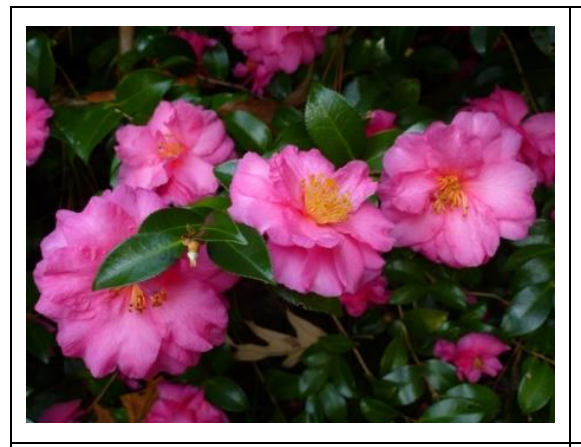
Camellia, fall Camellia sasanqua 'Shishi Gashira' Evergreen