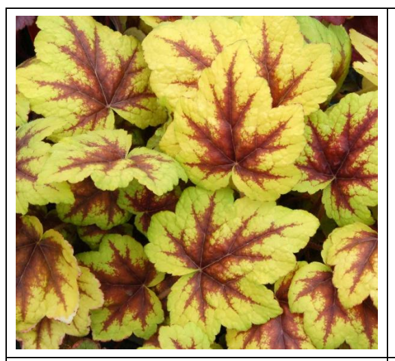
Foamy Bells, Heucherella 'Stoplight'' Evergreen

Height: 1 foot tall and wide evergreen perennial Plant in part sun (with afternoon shade to prevent leaf scorch) in well drained but moist soil Blooms late spring through mid-summer Color: shocking bright yellow/green leaves with star shaped red center, with showy white flower spikes Attracts butterflies and hummingbirds Humidity and drought tolerant Deer resistant