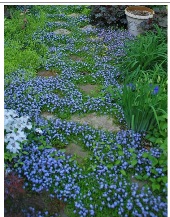
Mazus, Mazus reptans 'Blue'

Height: 4-6 inches tall and 1 foot wide perennial groundcover