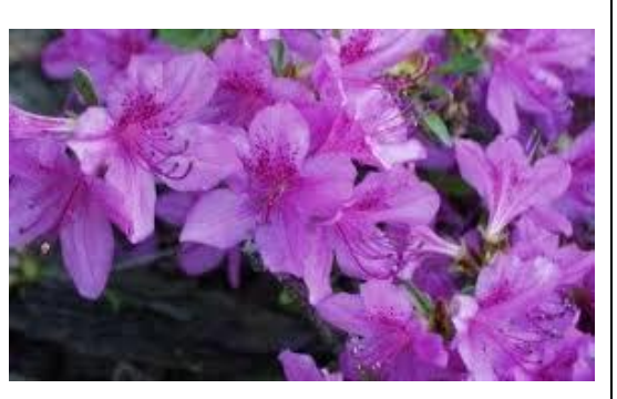
Azalea, dwarf Rhododendron yedoense 'Poukhanense' Semi-Evergreen

Attracts butterflies, bees and hummingbirds