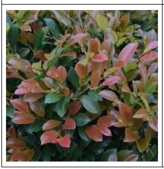
Distylium, 'Coppertone™' Evergreen

Height: 3-4 feet tall and 4-5 feet wide evergreen shrub