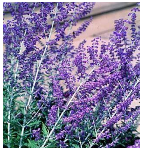
Russian Sage, Perovskia atriplicifolia

Height: 3-4 feet tall and wide perennial Plant in full sun in well-drained soil Blooms all summer