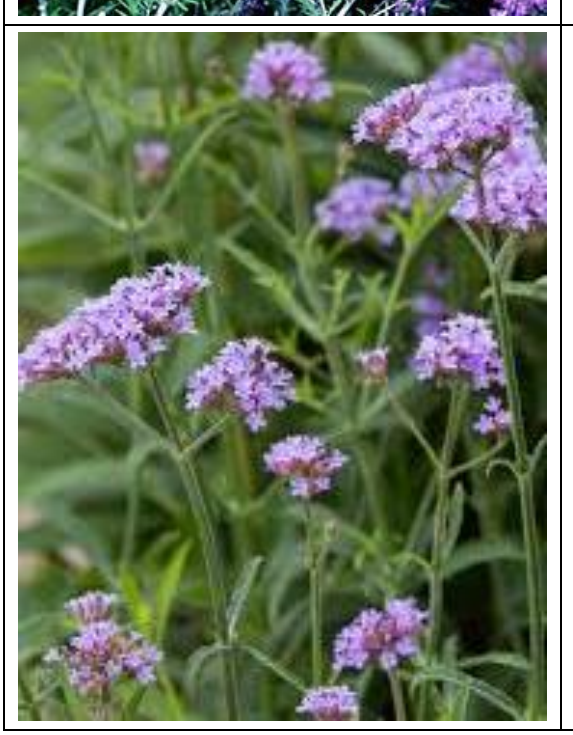
Verbena, tall, Verbena bonariensis 'Lollipop'

Height: 2 feet tall and wide perennial Plant in full sun in well drained soil