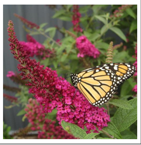
Butterfly Bush, Buddleia x 'Miss Molly' Semi-evergreen

Color: lavender flowers are fragrant and large Although not a native azalea, this one looks stunning planted with the orange and yellow natives Attracts butterflies and hummingbirds