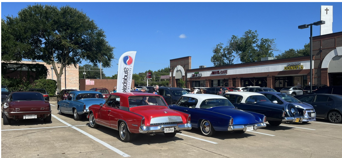
Flying that Studebaker banner for all to see