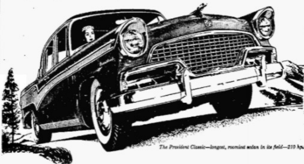
The President Classic—longest, roomiest sedan in its field—210 hp.