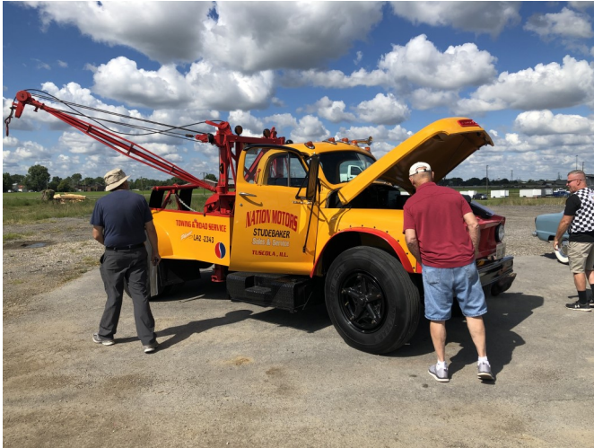
Something for everyone