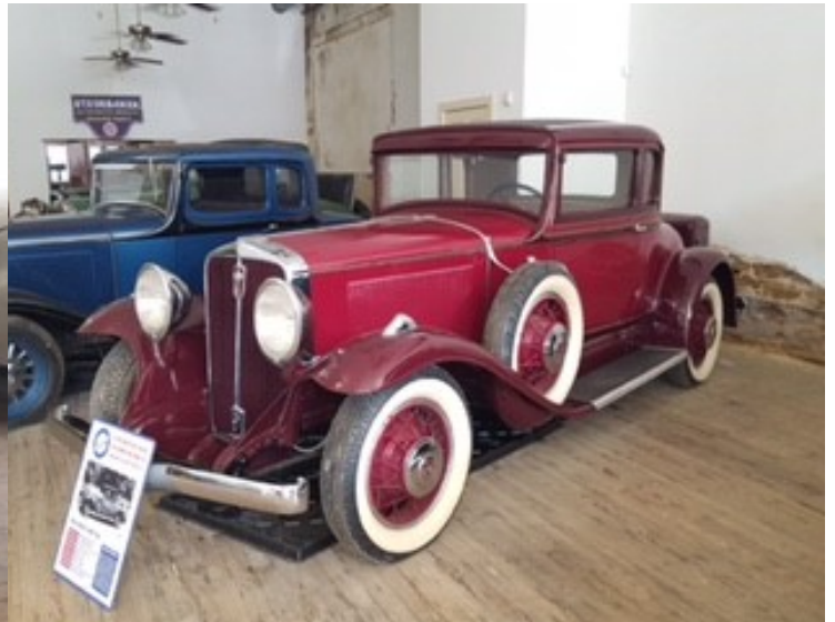
Burgundy Coupe, possibly a '31