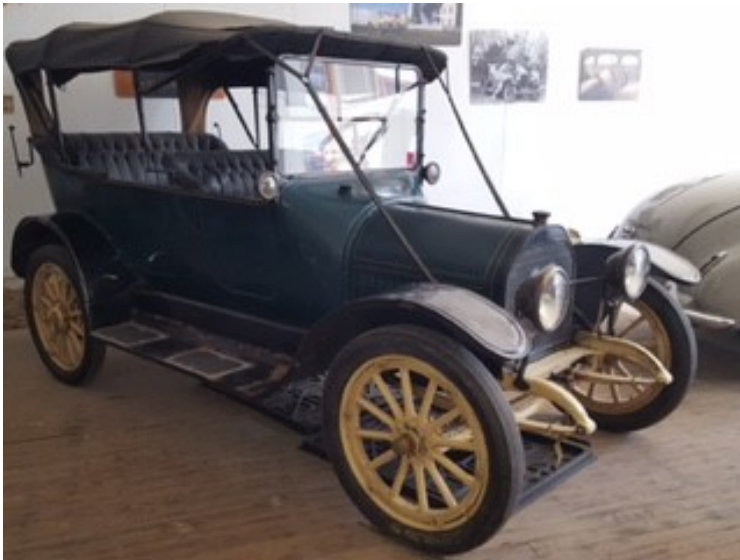
Open touring car from the teens.