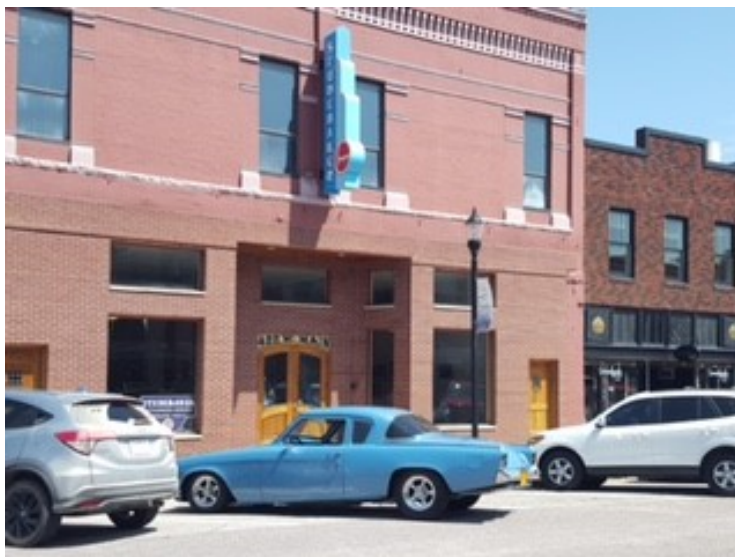
Eddie Ranne's custom '53 in front of Stude Museum