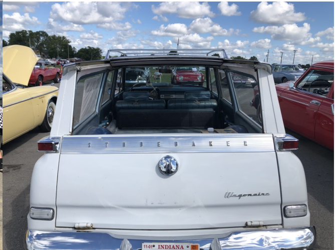
Sliding Roof Wagonaire