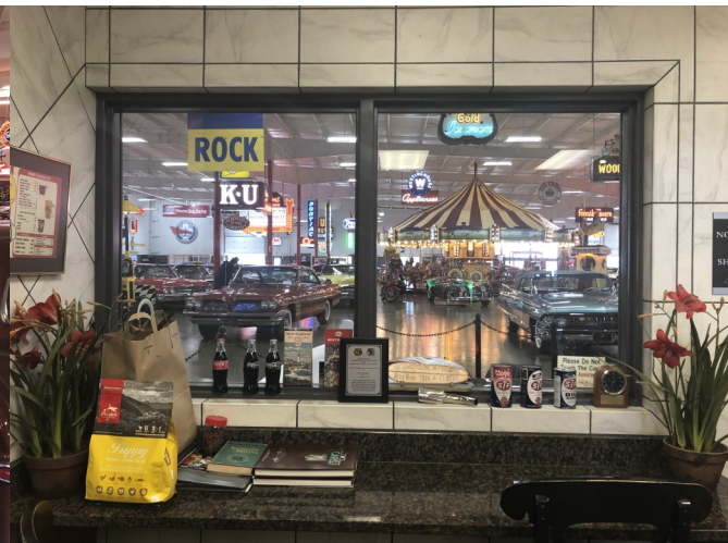
By invitation only to a huge private museum owned by Ray Skillman a mega car dealer in Indy