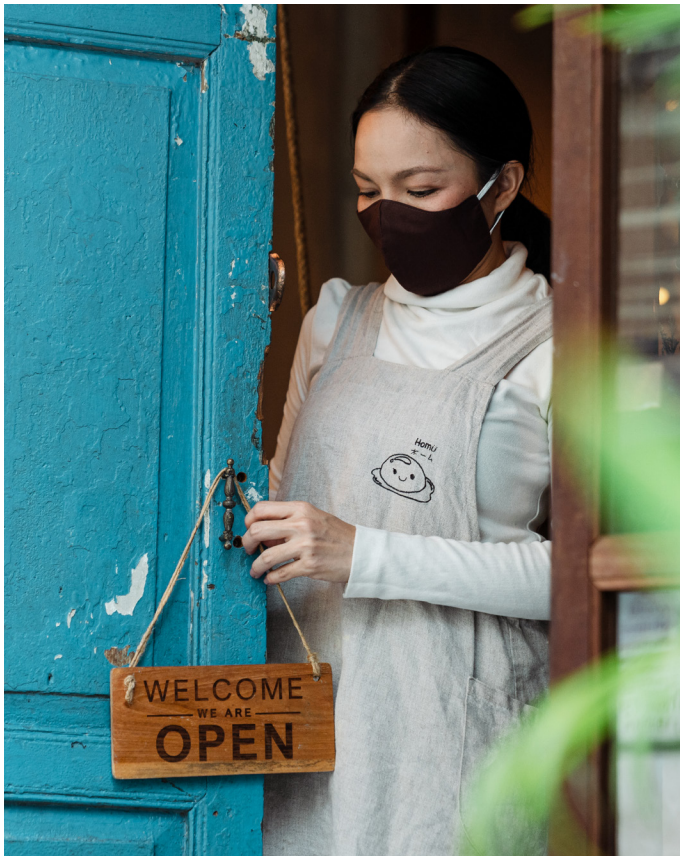
Example of face covering for employees