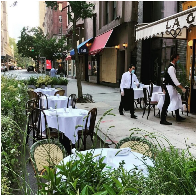
Restaurant participating in NYC Open Restaurant Program