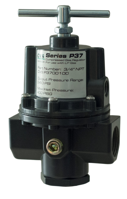
CVS P37 LP Gas Regulator