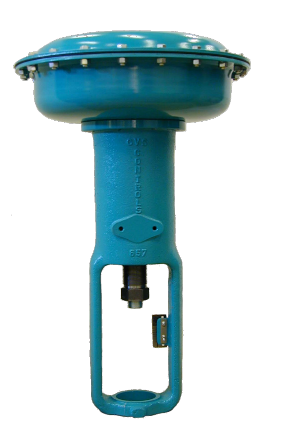
Figure 1: CVS Type 657 Actuator

Refer to Table 1 for the specifications for various sizes of CVS Type 657 Actuators. All accessories used with the CVS 657 have individual manuals which should be consulted regarding installation, operation and maintenance.