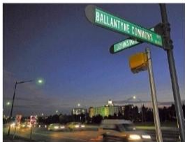
Traffic along Ballantyne Commons Parkway and Johnston Road near the Ballantyne Hotel.

ment that they don't want to restart talk of breaking away.