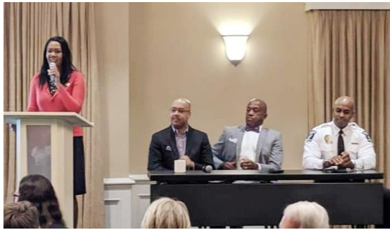
Community Safety Meeting