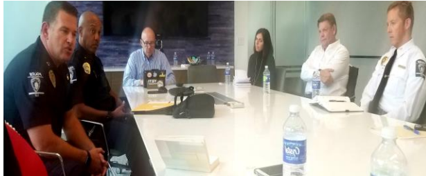
CMPD Leaders at SCP Board Meeting