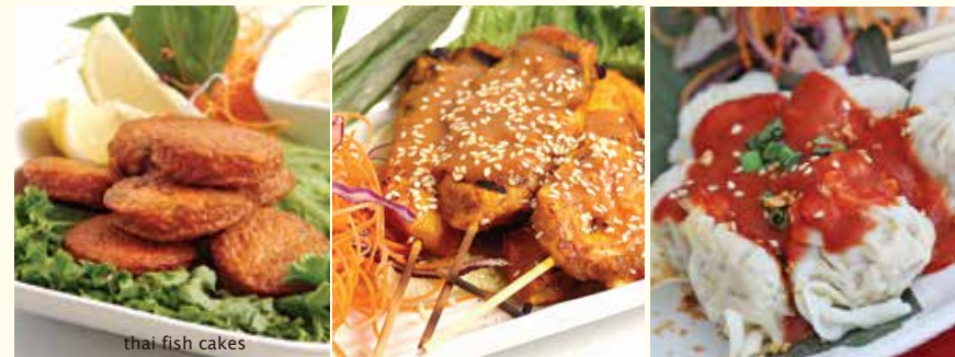
thai fish cakes