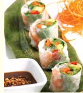
shrimp cold roll