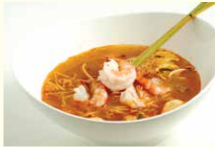
tom yum shrimp soup