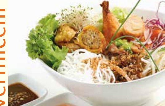
bun roll, beef & shrimp

steamed rice vermicelli, topped with ground peanuts and served with lemon vinaigrette