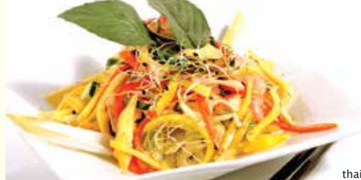
thai mango salad