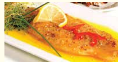
thai mango fish