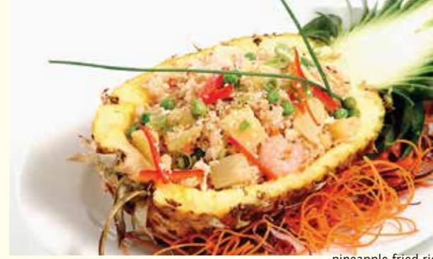
pineapple fried rice

all fried rice are prepared with eggs except for vegetarian version