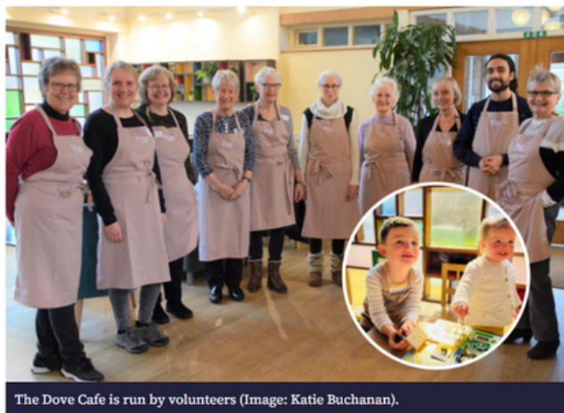
The Dove Cafe is run by volunteers.