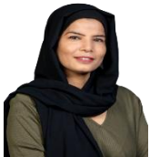
Placement Student Co-ordinator

Join us for our Open House from April 6th through April 10th! This is a wonderful opportunity to explore our classrooms, meet our dedicated staff, and engage in fun, hands-on activities with your child. We look forward to welcoming you and sharing a glimpse into your child's daily experiences with us.