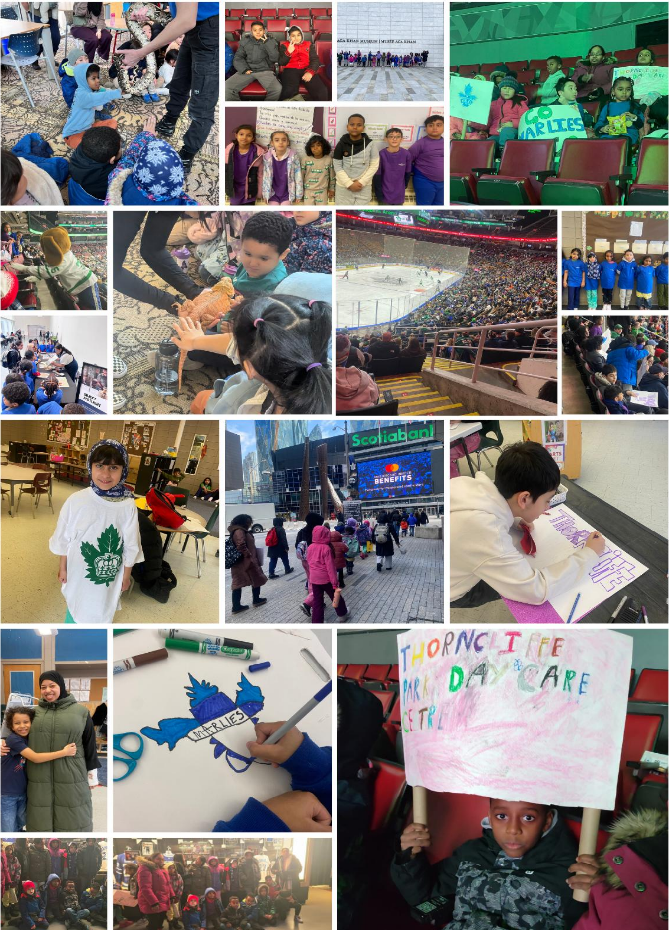
During March Break, our School Age program was full of exciting experiences! The children enjoyed two memorable trips to the Aga Khan Museum and Scotiabank Arena where they explored culture and cheered on the Marlies hockey team. It was a week full of fun, learning, and great memories!