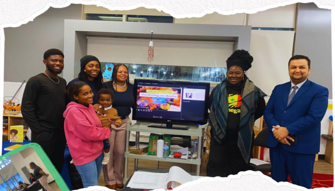
Parents from both of our location gather for a friendly photo

A big thank you to everyone who attended and contributed to such meaningful discussion. We look forward to continuing to provide workshops that support and empower our families both personally and in their parenting journey