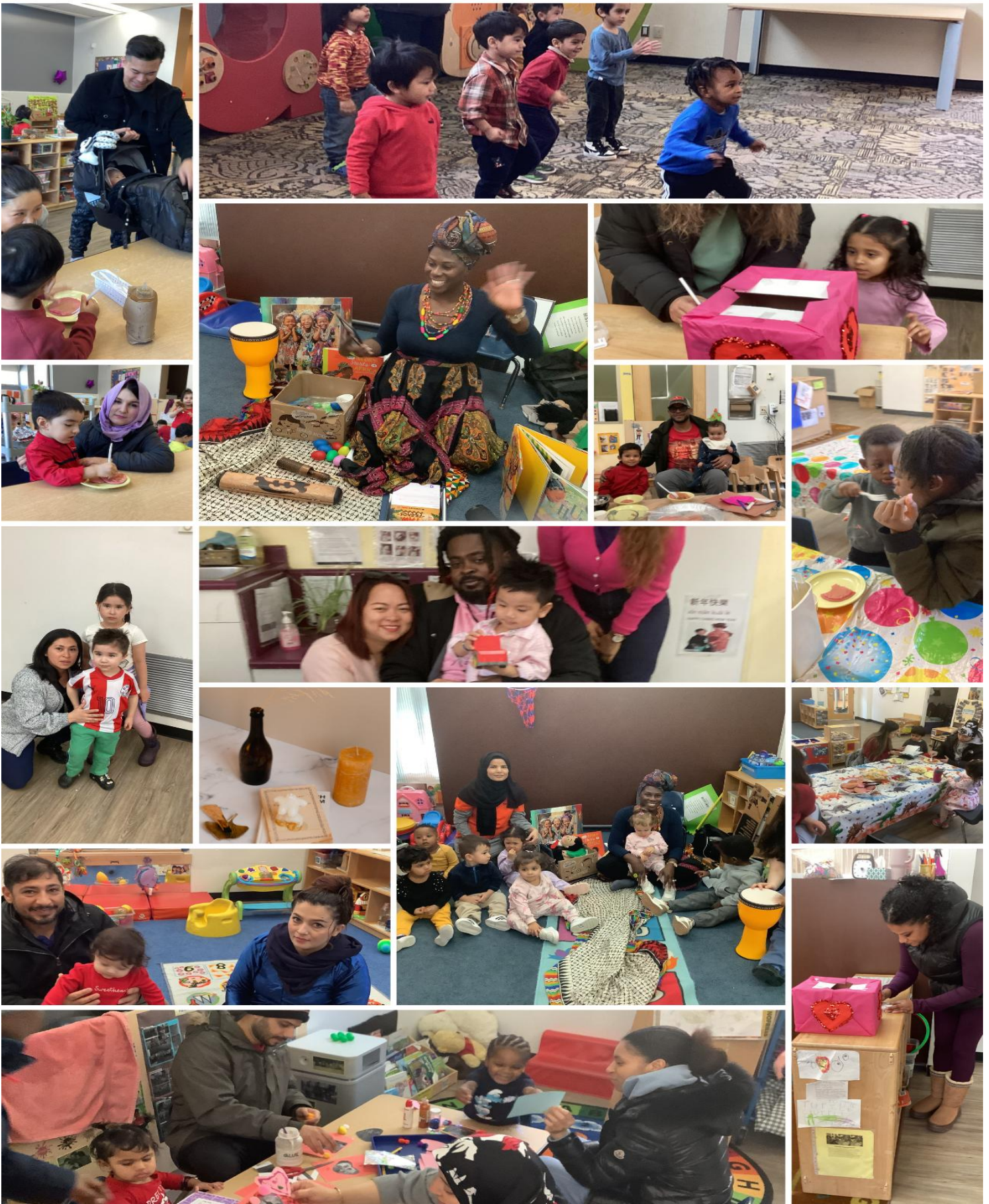
Our Main Centre has been full of fun and engaging experiences! We loved connecting with families during parent engagement activities, exploring rhythm through African drumming for Black History Month, and enjoying enriching library activities that sparked curiosity and hands-on learning.