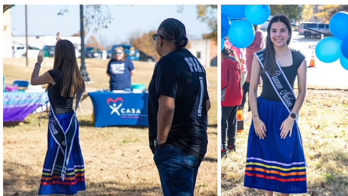
SIGNING THE LORD'S PRAYER WITH HER DAD SINGING AT THE ICW RESOURCE & FAMILY SAFETY FAIR