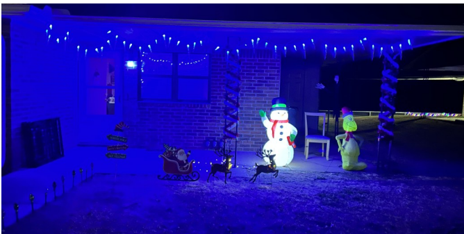
2ND PLACE - THE LEADING FOX FAMILY

Congratulations to the winners. We look forward to next year!