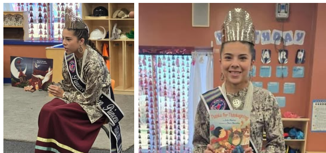
READING TO THE KIDS PN LEARNING CENTER KIDS FOR NATIVE AMERICAN HERITAGE MONTH