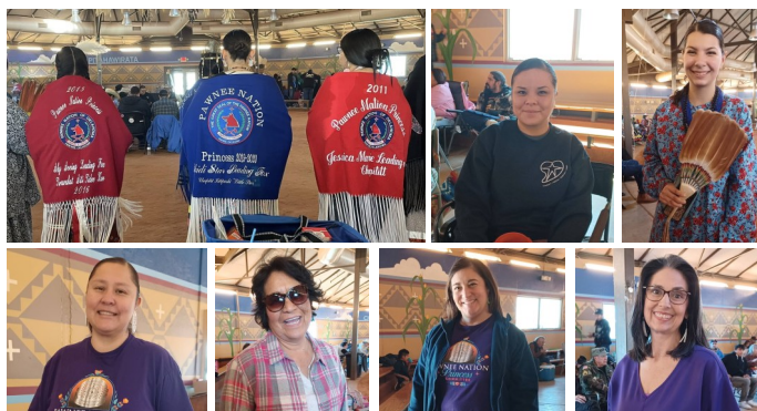
PAST PAWNEE NATION PRINCESSES AND PAWNEE TRIBAL PRINCESSES