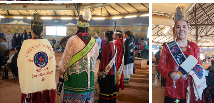
PAWNEE NATION PRINCESS DANCE AND CORONATION HELD ON FEBRUARY 22ND