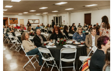
A few pics from the event. Left, you will notice our PNHA Staff and Commission attended the event.