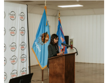
The State of the Nation delivered by President Misty Nuttle