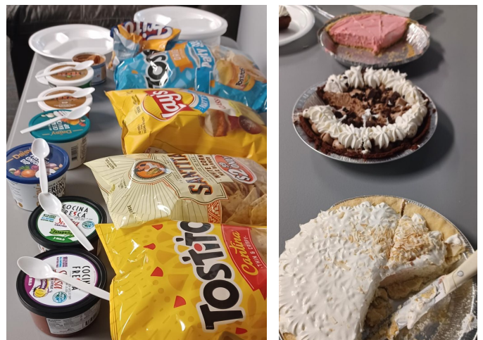
LEFT: NATIONAL CORN CHIP DAY AND RIGHT: NATIONAL PIE DAY

We want to thank all who have attended our additional holiday celebrations here at the Housing Authority. We wanted to make it fun for our tenants to come by the office, visit and enjoy some food and snacks. We look forward to the upcoming months. Below are some pictures of January and February activities.