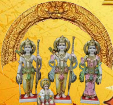
Sita Rama Parivar