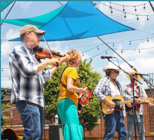
Carolina Gator Gumbo