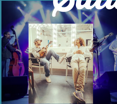
Charlotte Bluegrass All -Stars