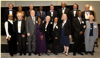
IACE Hall of Fame Board Members