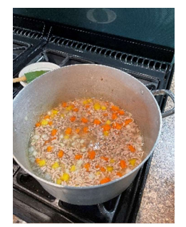
Vegetables added and all cooked