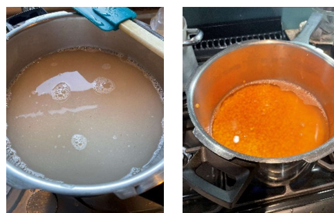
Lentils before and after washing

Method 3: Tip the lentils into a large pan or bowl and fill with water. Sloosh around then empty the water through a sieve. Return the lentils to the bowl and repeat 3 or 4 times. I still prefer Method 1 as this Method 3 can be a clert as you empty and refill the sieve.