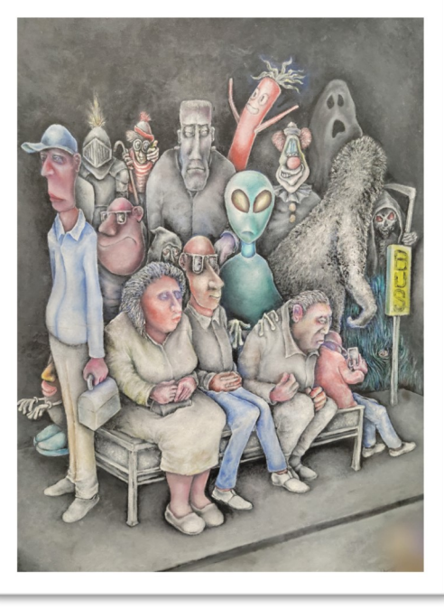
"Bus Stop" Paul Drummond