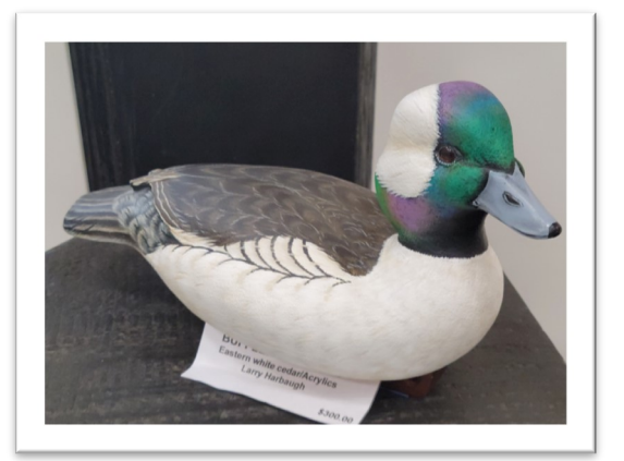
Bufflehead Drake Eastern White Cedar/Acrylics Larry Harbaugh