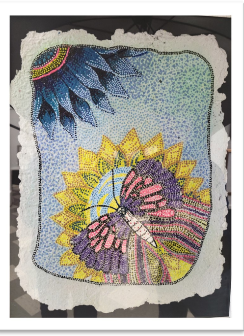
"Butterfly Heaven" Watercolor on handmade paper Lorie Woolett