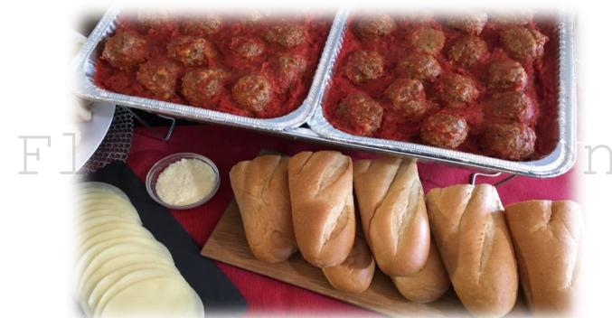
Meatball Sub Bar