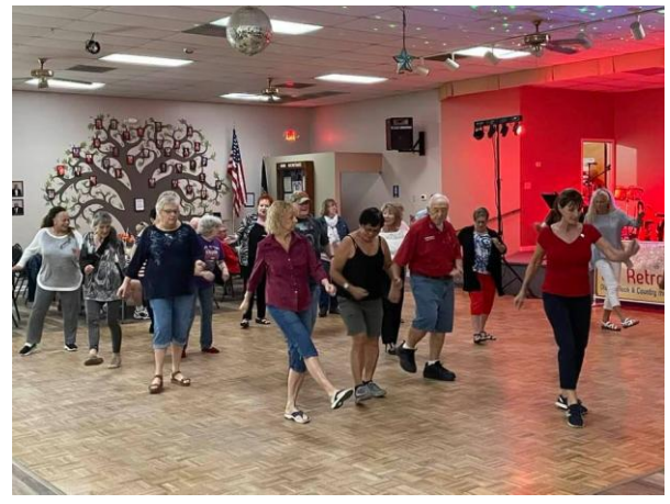
Some Pictures from the Year 2021