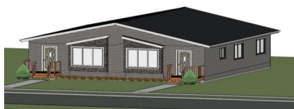
A rendering of a Dakotaplex duplex courtesy of South Dakota Housing Development Authority.

On June 17, the Governor’s House Program announced the town of Tyndall as the first recipient for their DakotaPlex Pilot Program. We are excitedly awaiting the development of this program for affordable housing options for our communities who qualify.