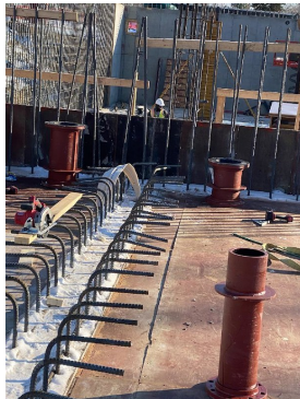
Pierre Drinking Water Treatment Plant

At the treatment plant, forms will start to show up on the tops of the finished walls in preparation for the ground level slabs.