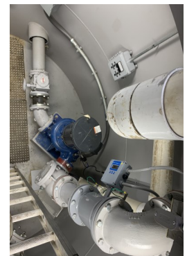
Lift station top.