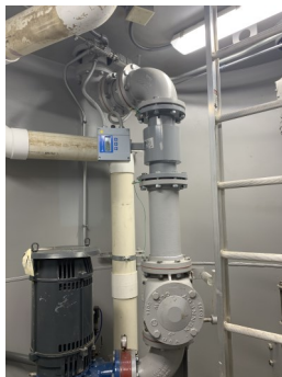
Lift station pipe.

(The Caisson is typically filled with water at an elevation similar to the river but was temporarily pumped down for this work).