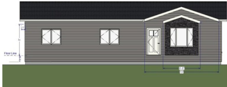
3 bed room, door right.