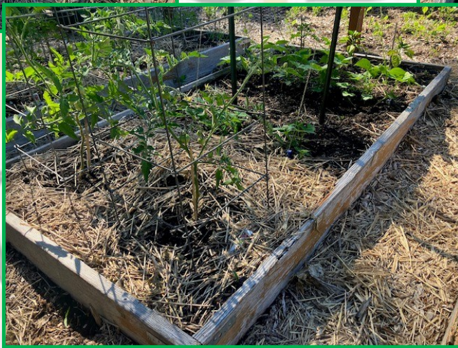
Below are pictures of the garden that Tiffney and our Sunday school kids planted.