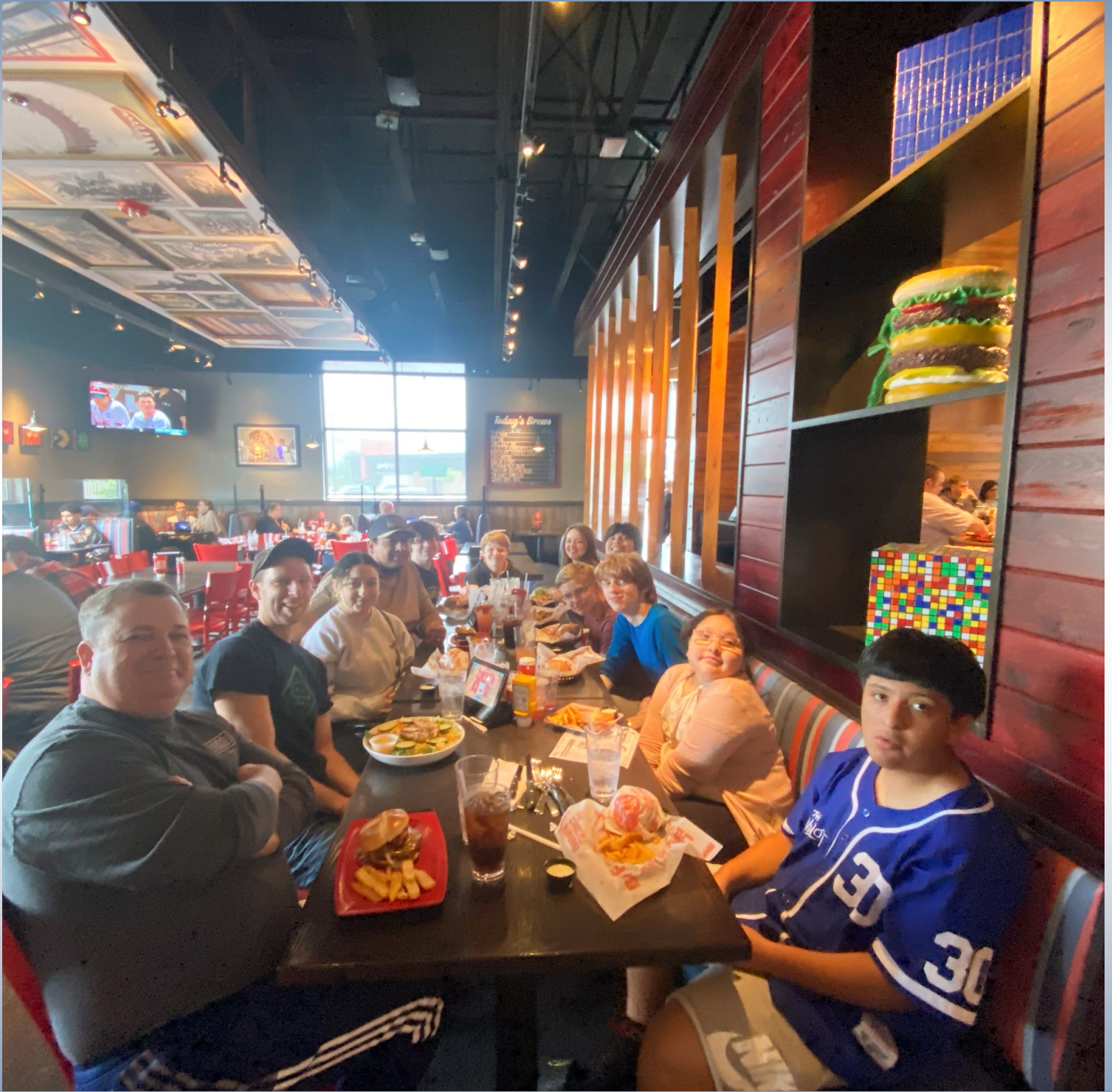
Youth Group outing to Red Robin YUM!