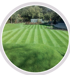
Turf care and installation