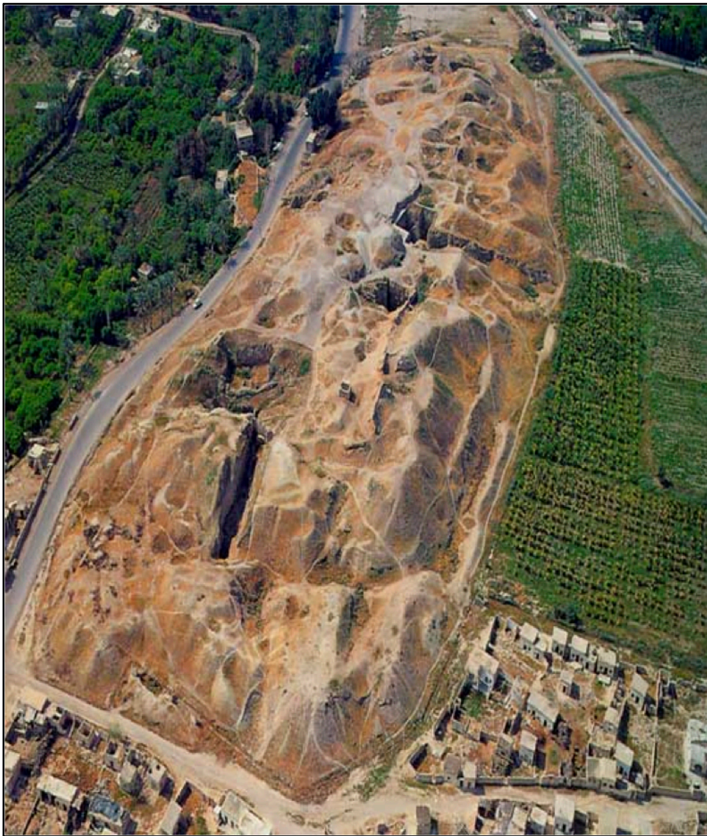
Figure 6. Excavated site of Jericho