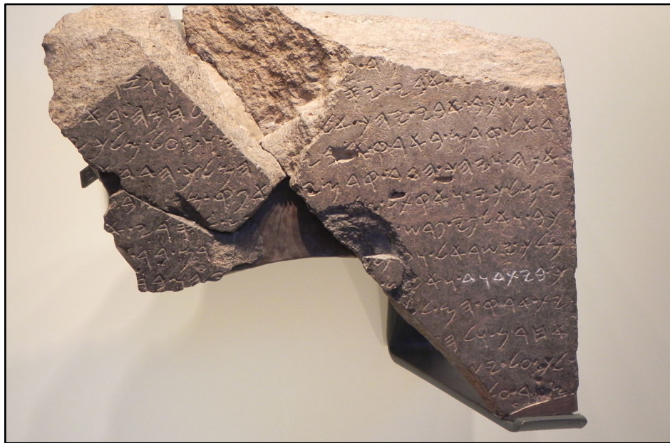
Figure 1. The Tel Dan Stele

A stèle is a type of upright stone (generally taller than it is wide) that was erected as a monument to commemorate an important event or achievement. These stones were typically inscribed with related details and were frequently used in Israel, Egypt, across Mesopotamia, the Far East and Central America. The large number of surviving steles constitutes one of the largest and most significant sources of information on those civilizations. The Tel Dan Stele is