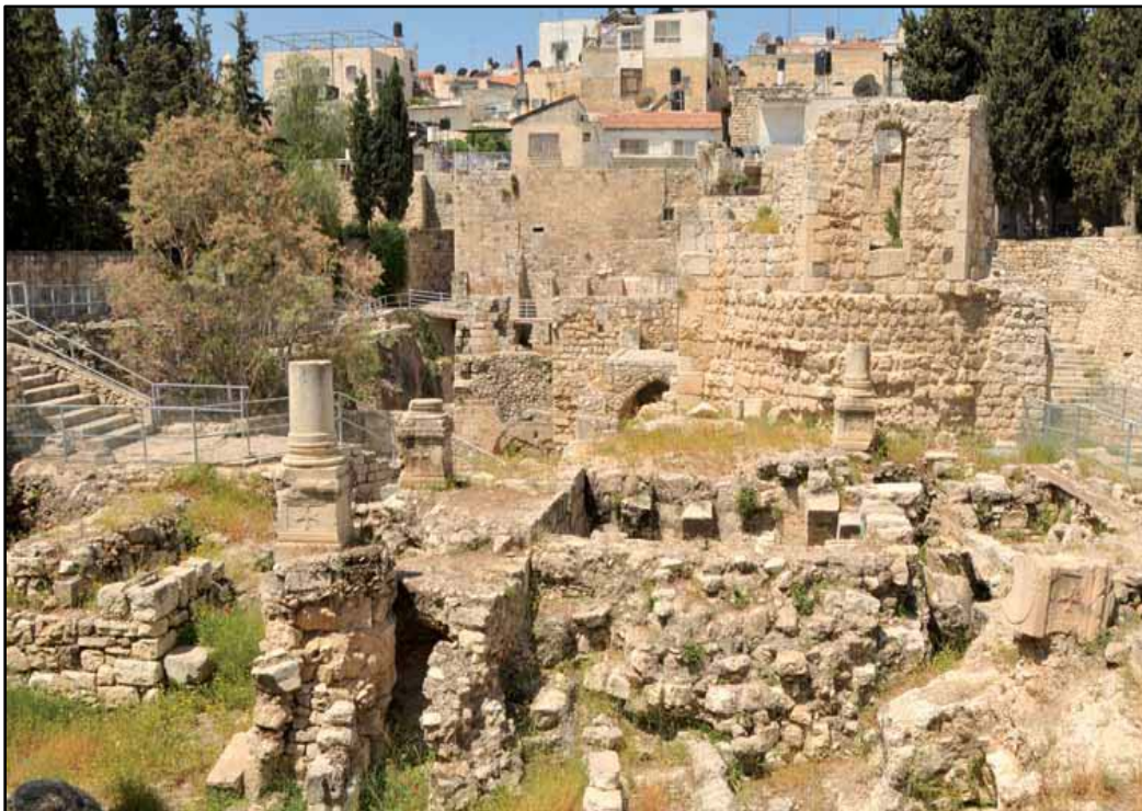
Figure 5. The Pool of Bethesda

The apparently odd description of five porticoes baffled scholars and archaeologists, as the description of a five-sided pool was believed to be symbolic and/or representative of the five books of the Torah. However,