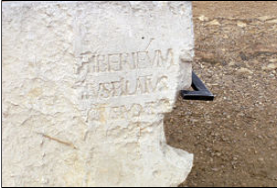
Figure 3. The Pilate Stone

For many years, Bible critics claimed the account of King Nabonidus of Babylonia was inaccurate due to a lack of archaeological evidence, particularly since Nabonidus is not mentioned in the Bible but his son Belshazzar is mentioned in the 5 th chapter of Daniel. However, in 1854, an archeologist found four clay cuneiform cylinders in the foundation of a ziggurat at Ur that are referred to as the four Nabonidus Cylinders from Ur.