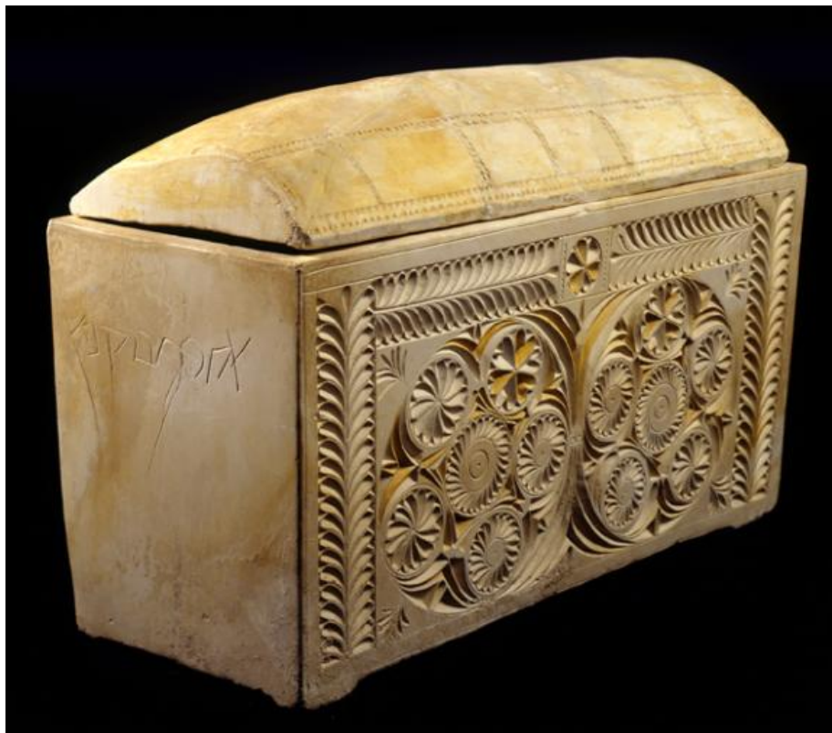
Figure 2. Caiaphas Ossuary

In the Peace Forest section of Jerusalem (a forest south-southeast of Jerusalem), a burial cave was discovered in 1990 that contained twelve ossuaries (small burial boxes) that were used to hold the bones of the dead following their decomposition. One of the ossuaries belonged to Caiaphas (Figure 2), the high priest who presided over the arrest and trial of Jesus. This discovery validates the events described in Matthew, Luke and John of the New Testament