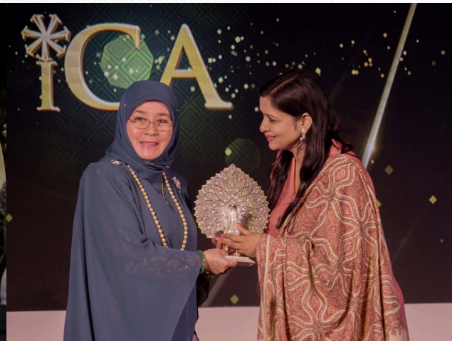
HRH QUEEN AZIZAH OF

"Congratulations to all the Awardees from the family of World Crafts Council - Asia Pacific Region. We express our pleasure and pride in having Craft Village among its member as one of the youngest and most active handicraft organizations."