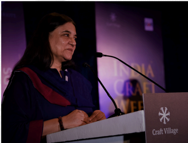
SMT MANEKA SANJAY GANDHI

Former Minister of Women & Child Development, Govt. Of India