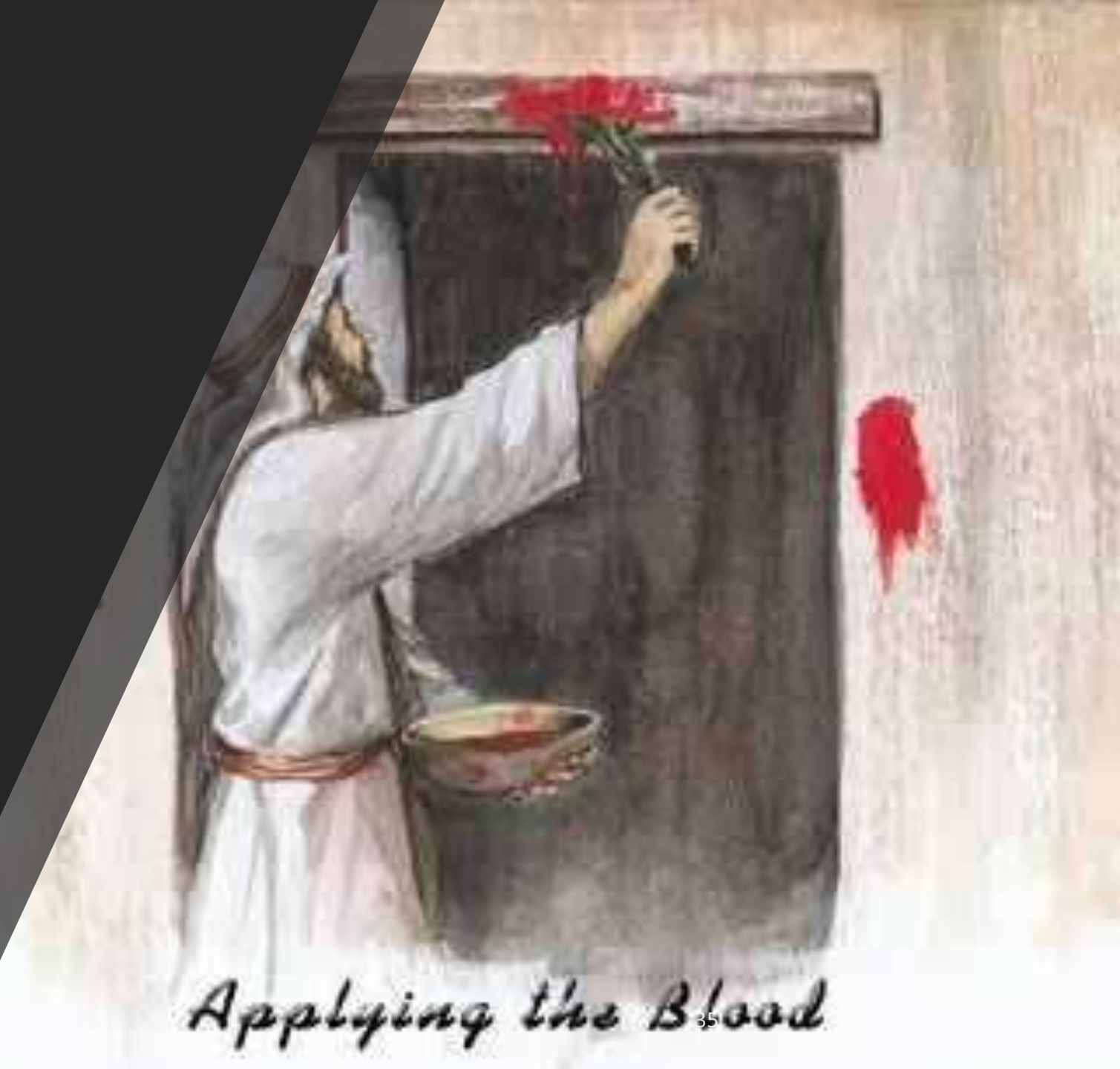
Applying the Blood

The first consists of the Passover, the same day on which Yahusha was put to death as a sacrifice for our sins.