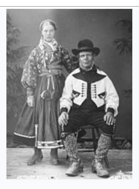
Traditional folk clothing of eastern Telemark, 1880's.

The bunad movement has been carried forward by enthusiasts all over the country and new bunad variations are frequently created and proposed for approval. Designers such as <u>Lise Skjåk Bræk</u> have developed entire lines of costumes based on the bunad tradition. In the field of folk costumes it is common to differentiate between bunad and folk costume , the latter being the local dress in previous times with all its variations and use. Modern interpretations of these costumes have often modified or done away with completely parts of the traditional dresses in order to align them with a more conventional idea of beauty and fashion. For example, few Norwegians still use the headdresses and headpieces that were a part of the traditional costumes, preferring instead to show their hair, in accord with modern, western fashions. Ironically, these headdresses, like the one in the photo at the top of this article, would often have been seen as the most important part of the costume for native practitioners of the customs as the headdress often indicated an individual's social or marital status.