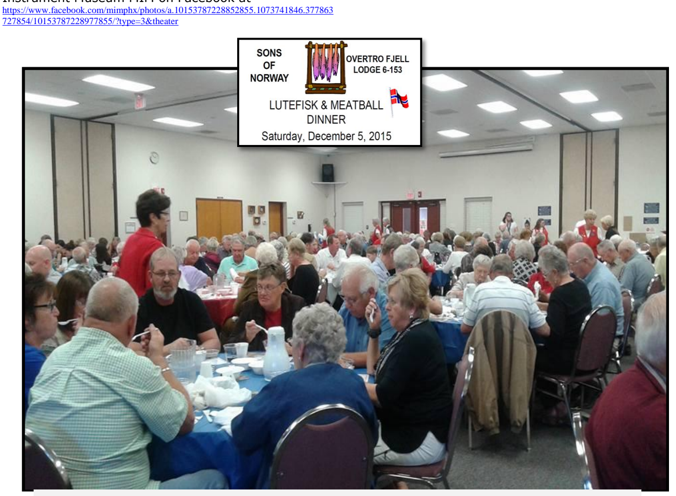
In this picture, Overtro Fjell Lodge, Mesa, Arizona, was serving the first 250 people to arrive.

Posted by Wendy Winkelman, on Sons of Norway District 6 Facebook Page. Thanks to Wendy for posting this picture!