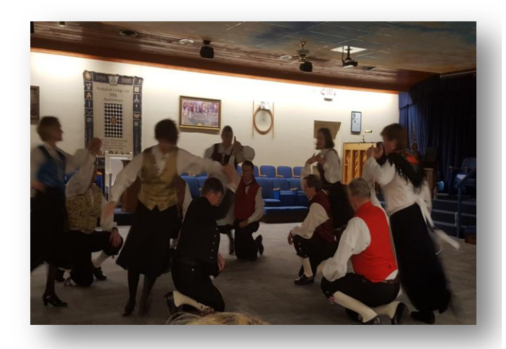
The Scandinavian Folk Dancers of Phoenix