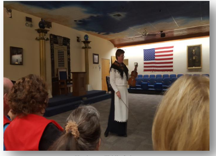
Hardanger Fiddle Solo.