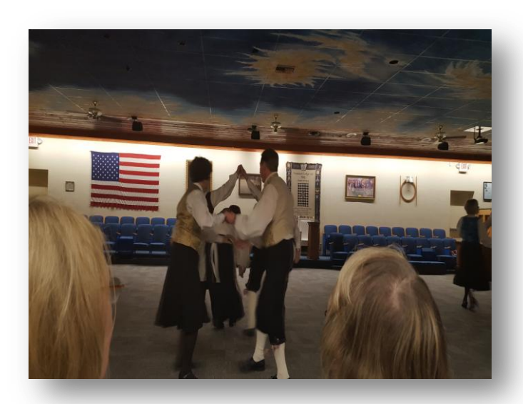
The Scandinavian Folk Dancers of Phoenix