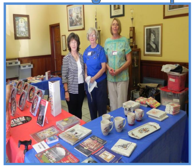
Available at the March Meeting