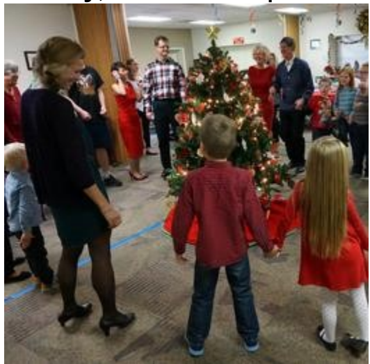
Trinity Lutheran Church 9424 N 7th Ave, Phoenix, Arizona 85021