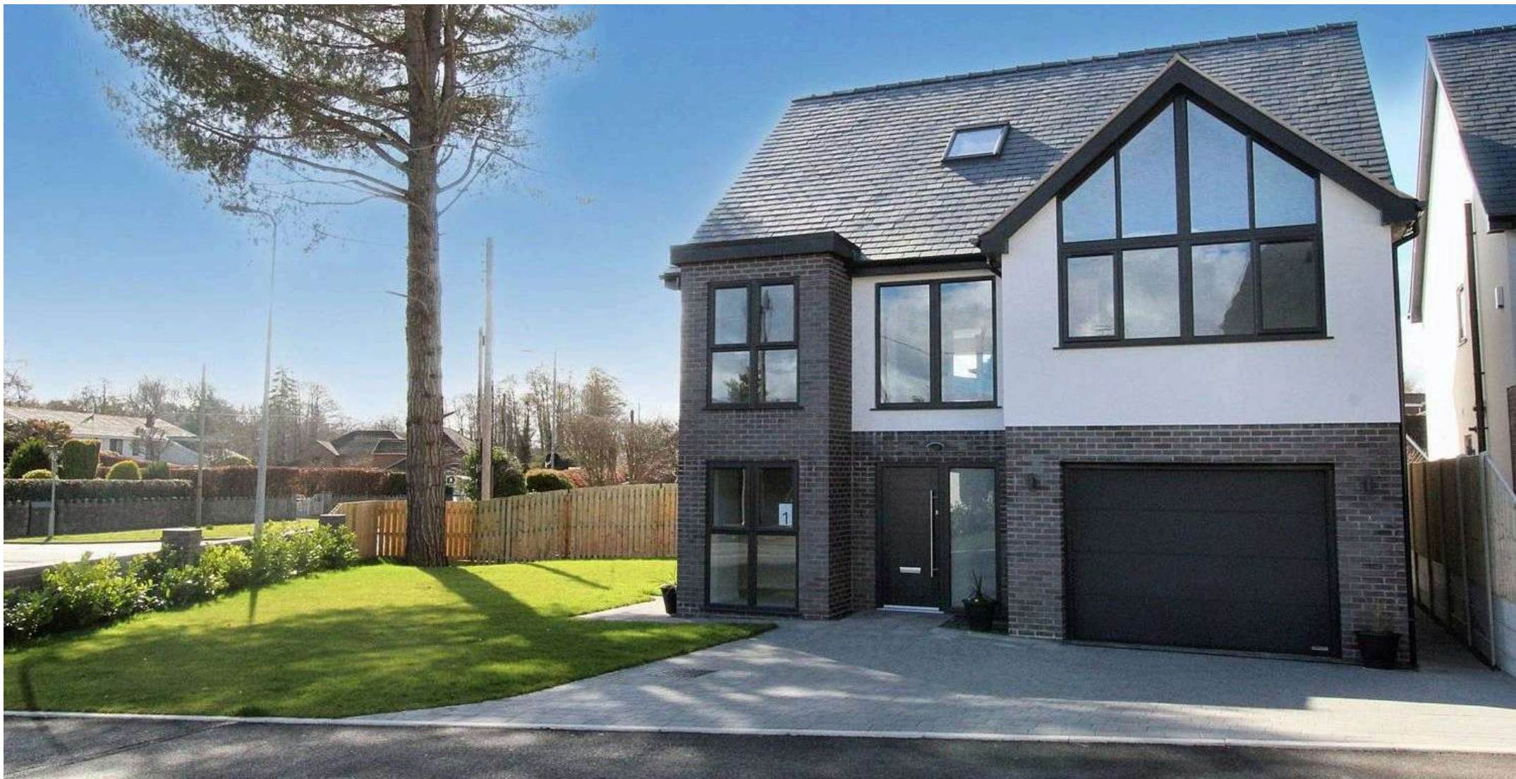
1 Tai Hydref, Sychdyn Mold