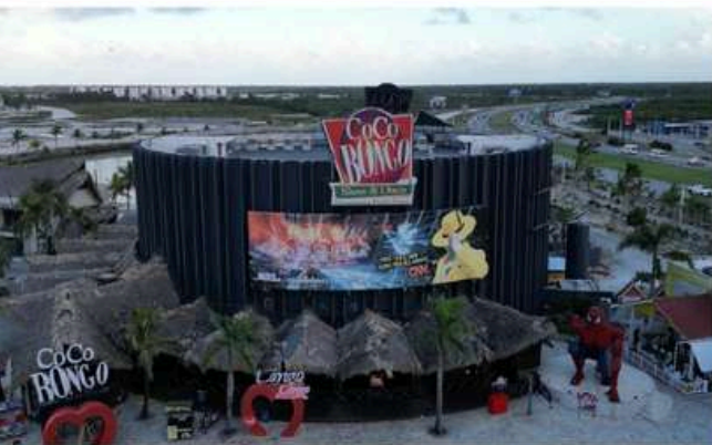
COCO BONGO (10MIN)