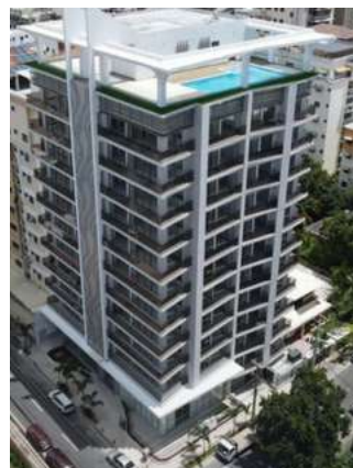
84 units delivered Brickell Condo Hotel