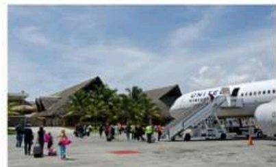
AEROPUERTO INTERNACIONAL DE PUNTA CANA (20 MIN)