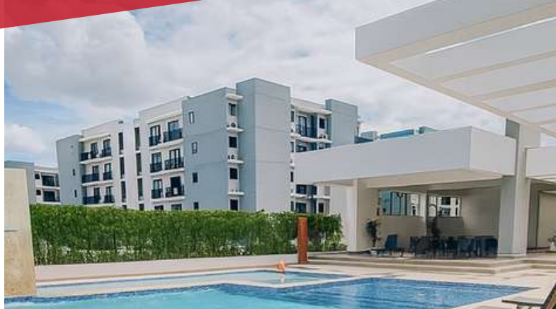
Jardines I - II - III 966 units delivered