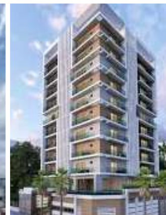
Brickell Evaristo Under construction