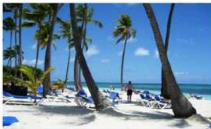
PLAYA BIBIJAGUA (18 MIN)