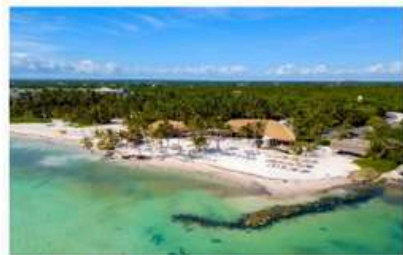
PLAYA BLANCA (20 MIN)