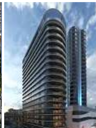
Brickell Naco Under construction