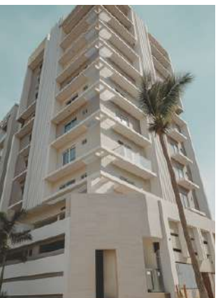
39 units delivered Torre Shanti I