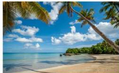
PLAYA BONITA (14 MIN)