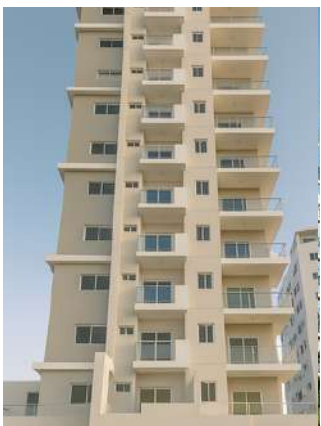
36 units delivered Torre Shanti II