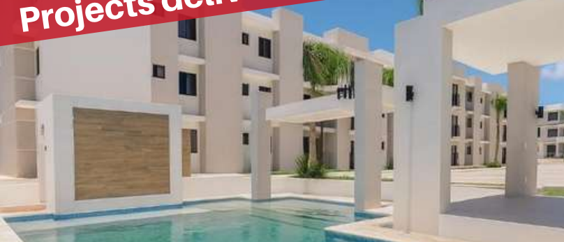
Bavaro Island I 120 units delivered