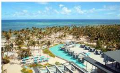
PLAYA CABEZA DE TORO PEARL BEACH CLUB (16 MIN)