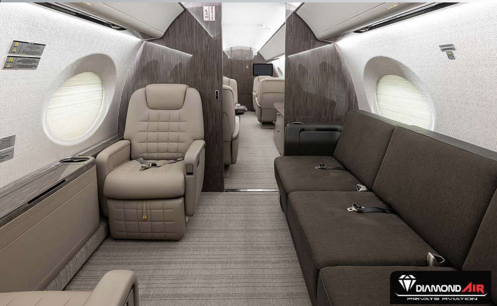
Aft looking forward