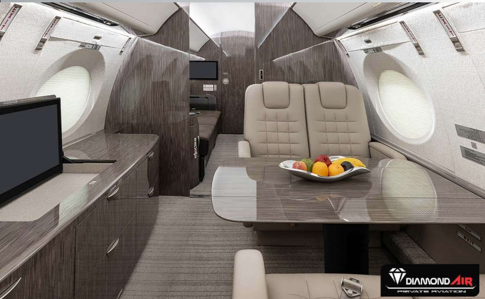
Mid looking aft