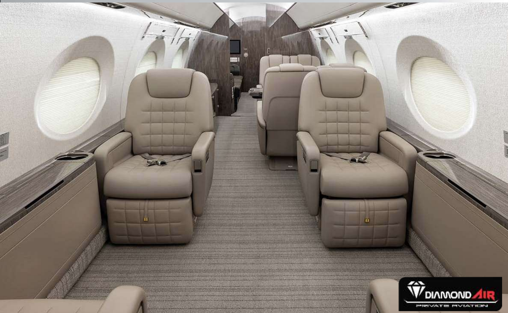
Forward looking aft