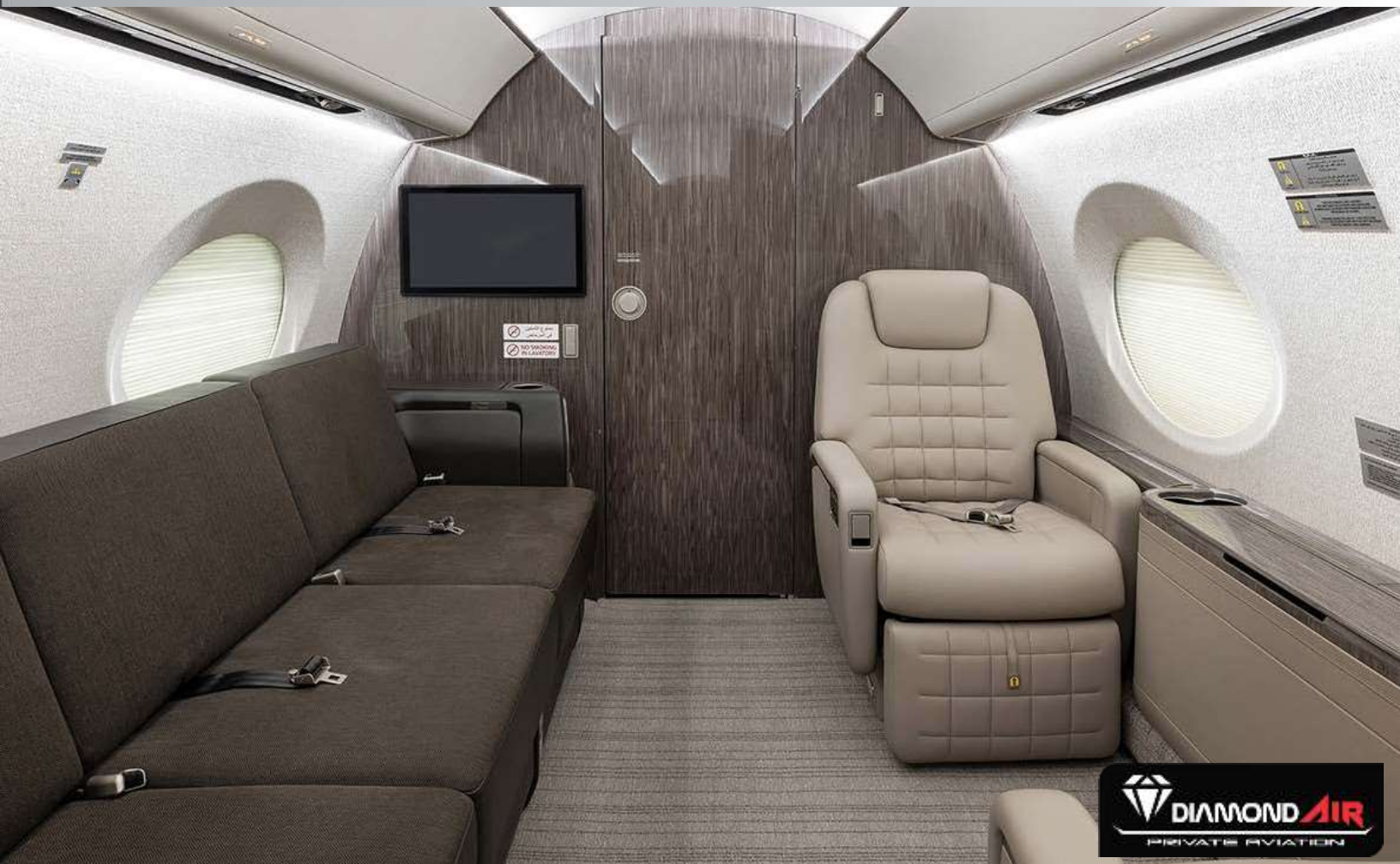
Aft looking aft