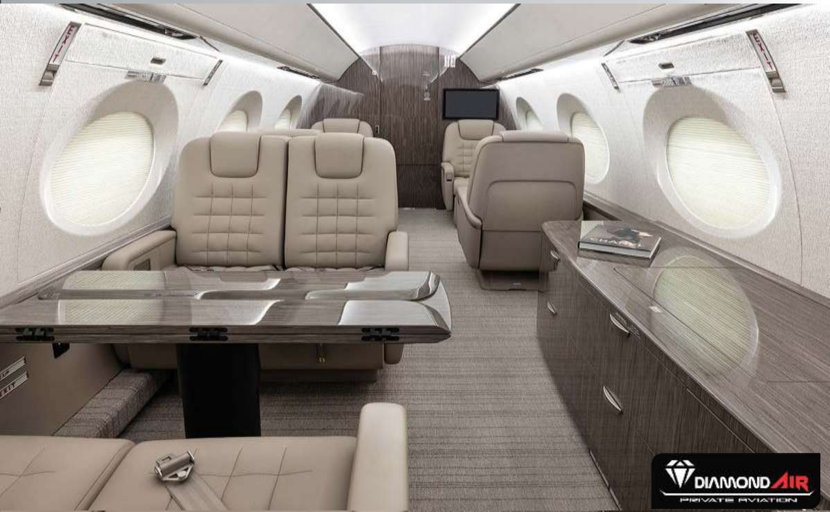
Mid looking forward