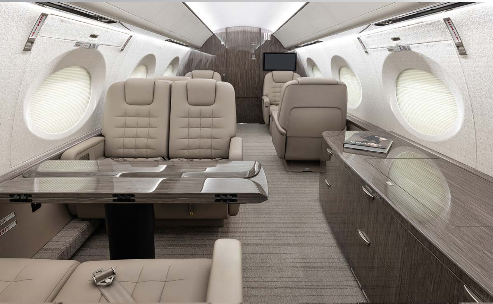
Mid looking forward