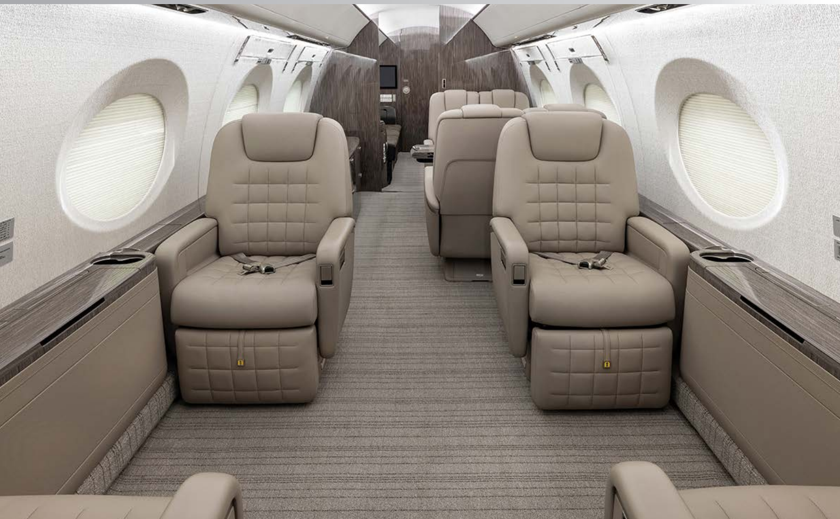
Forward looking aft