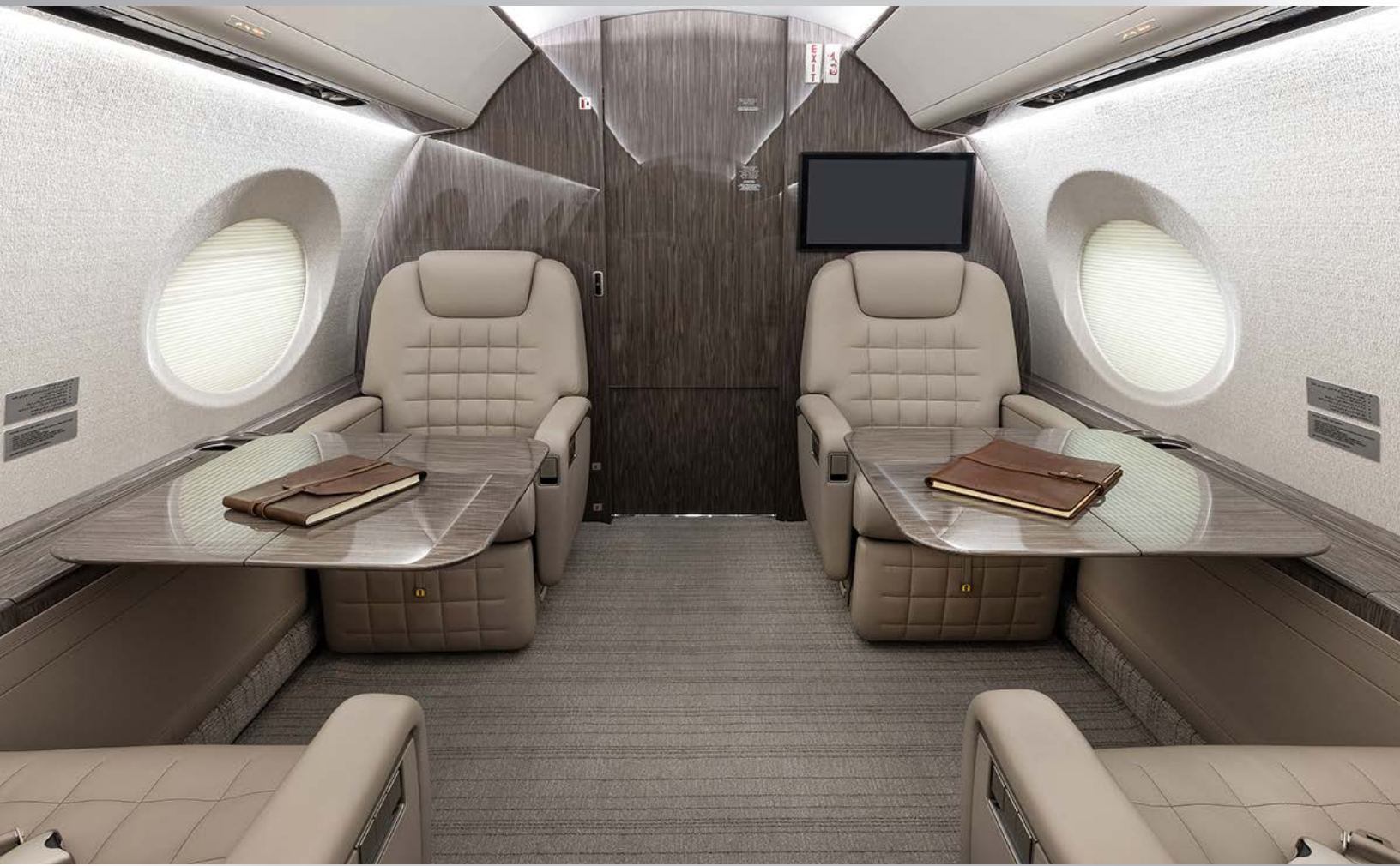
Forward looking forward