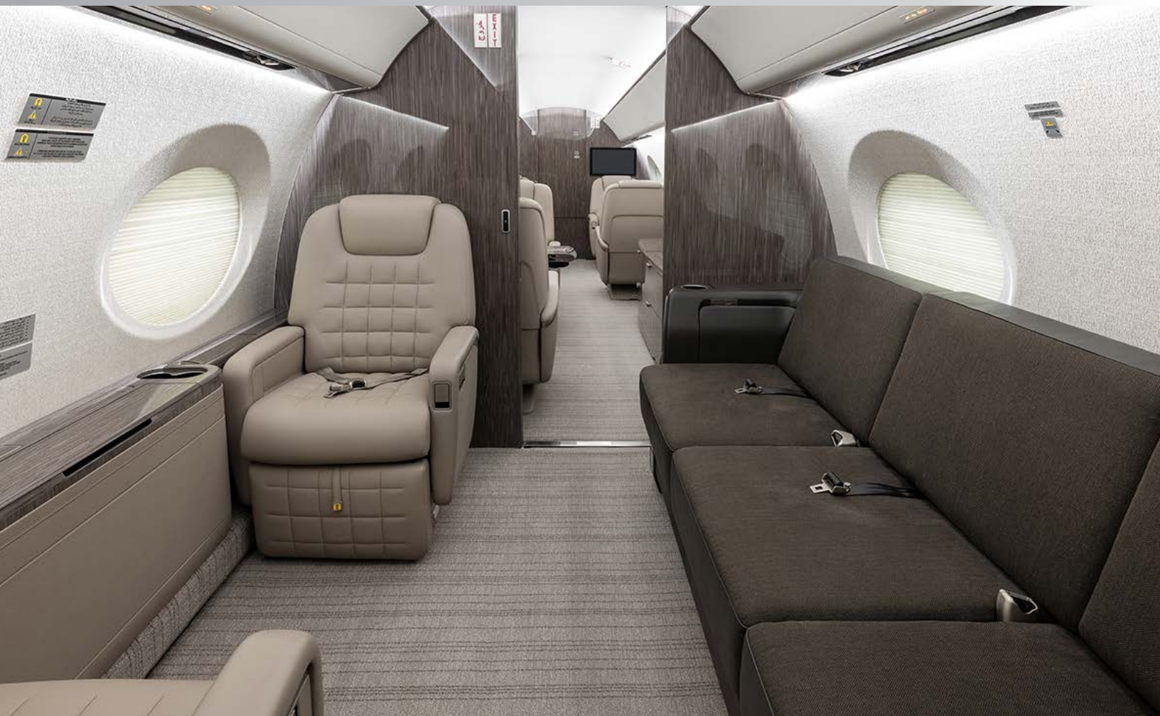
Aft looking forward