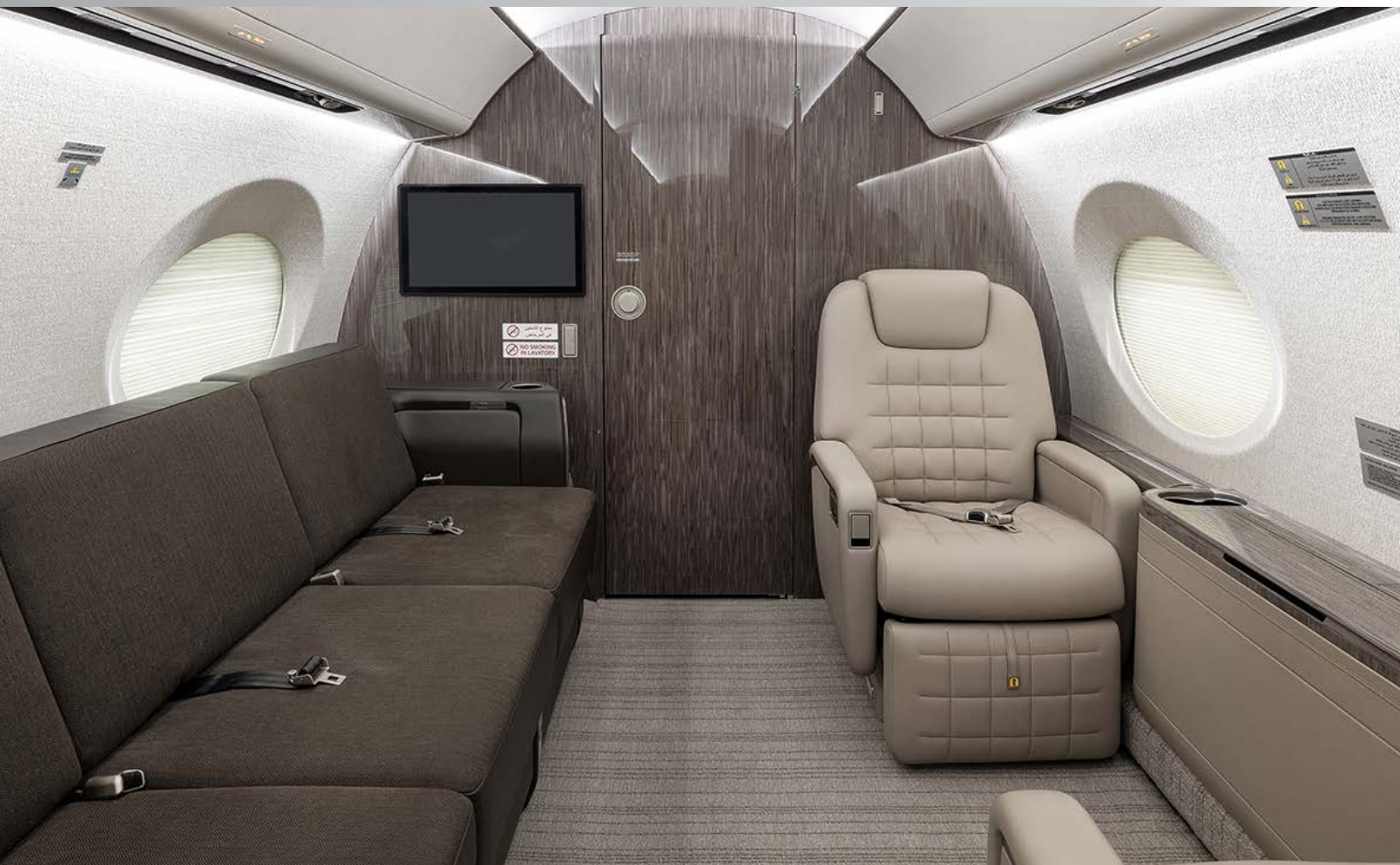
Aft looking aft