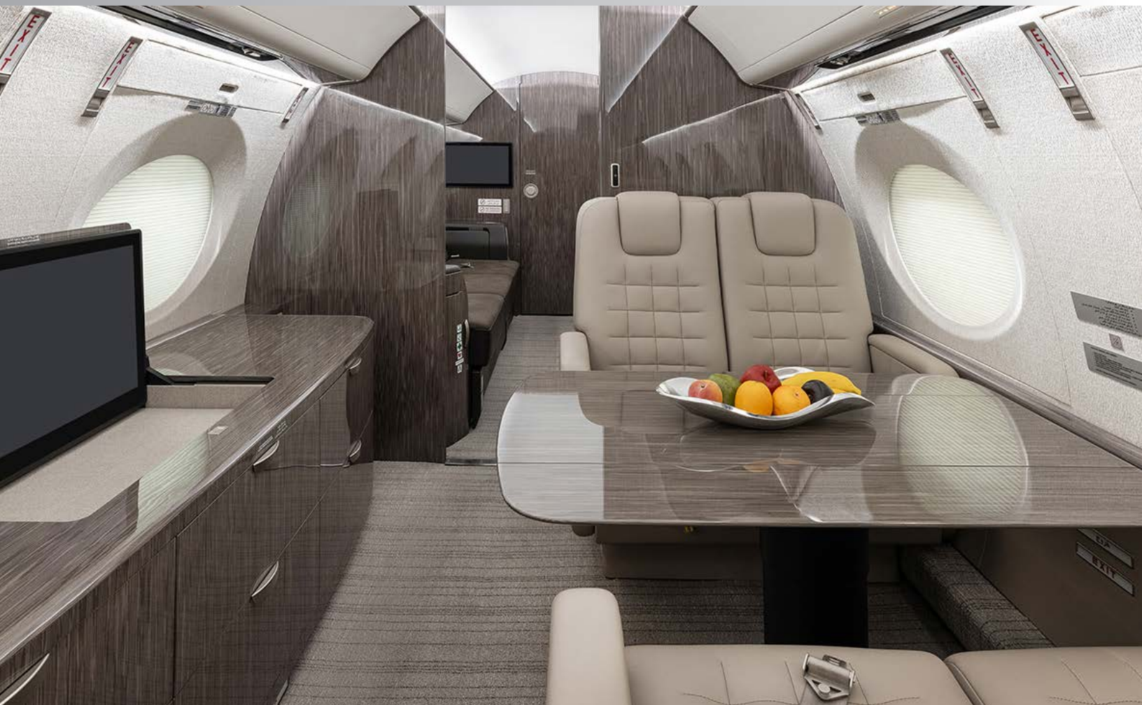
Mid looking aft