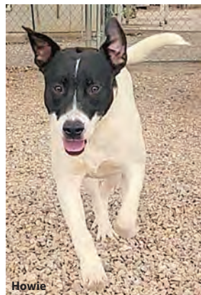
Howie is a 1 year old male Heeler mix. He is very active and best as the only pet

We still have lots of animals looking for homes so call today and we'll match you up.