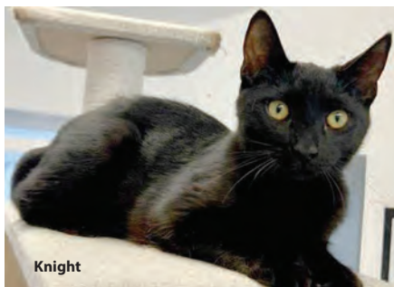
Knight is a 5 month old male black kitten. He is on the shy side but very sweet