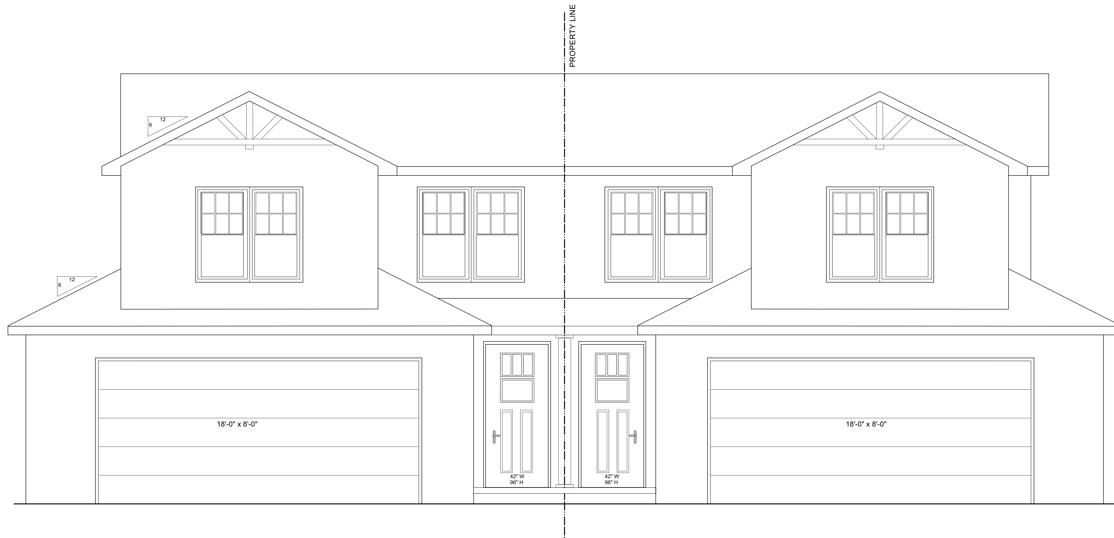
Front Elevation (TH 'ASTOR' & 'ADAGIO') Scale: 3/8" = 1'-0"